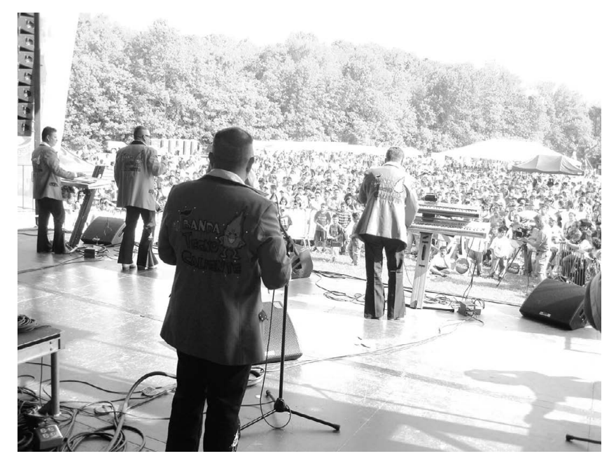
Banda TecnoCaliente at the Fanta Festival on Charlotte's Eastside

their frustration with being stuck in one place. They knew it would be a big risk to return to visit family in Mexico and perhaps not be able to return to the United States. While Charlotte's undocumented Latino residents might enjoy some of the cosmopolitan taste (Appadurai 1996) developed when one leaves a parochial setting, they were denied the ease and freedom of motion that other global travelers enjoy.