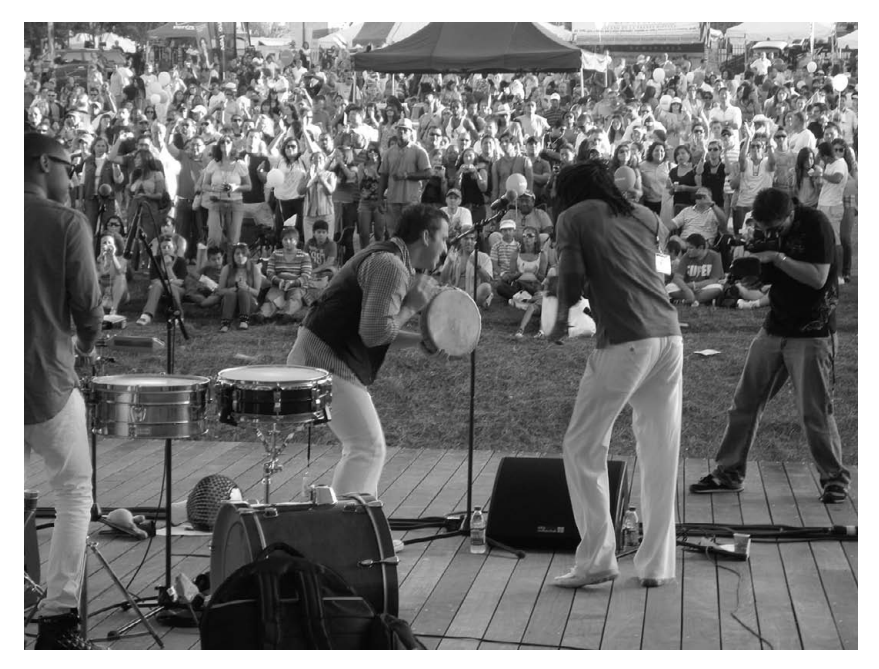
Plena Libre headlines the 2010 Festival Latinoamericano

In many ways, a festival is organized chaos. For festival organizers, the trick is to manage what at times feels like an out-of-control freight train barreling down the tracks. It helps if the vision for how the event should go is well-planned and flexible enough to deal with the series of unforeseen yet inevitable circumstances that arise to derail a festival—rain, late bands, poor turnout, or failing food inspections. It takes months of groundwork to prepare for an event that is over in a matter of hours. As I have explained elsewhere (Byrd 2012), manufacturing the festival experience involves extensive planning over many months and the hard work of poorly paid staff and gracious volunteers. Here, I focus on the musical and financial aspects of this organizing process to understand what values are expressed through the festival and how the festival relates to Charlotte's Latino musical communities.