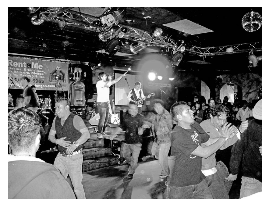
Fans dancing at a Dorian Gris concert