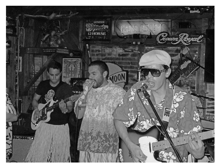
Bakalao Stars performing in Hawaiian shirts and skirts

financial investment in the band, particularly since it is not a given that its shows will make money. At some shows, Bakalao Stars loses money because the door receipts do not cover paying the sound manager; then band members each contribute to covering costs. Its members understand that the purpose of the band is not to make money; they often work for free in order to reach a goal, such as saving money to record an upcoming album (as the band was doing in 2010, when concert profits went toward recording studio costs).