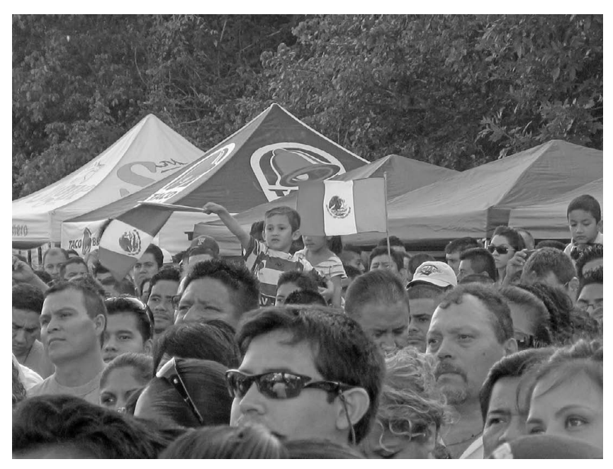
Corporate latinidad at a festival