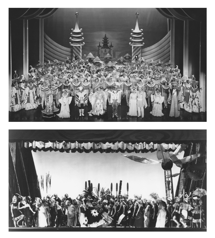
Fig. 1. ( top ) Act II finale, The Hot Mikado . Fig. 2. ( bottom ) Katisha and the Mikado cakewalk, Act II, The Swing Mikado .

imagined America's future through its relationship to Asia, while carrying its black Atlantic present into that negotiation. The creation of a swing adaptation of The Mikado seems at first glance a perfect example of Joseph Roach's circum-Atlantic performance—one that contributes to an "oceanic interculture" founded on the "diasporic and genocidal histories of Af-