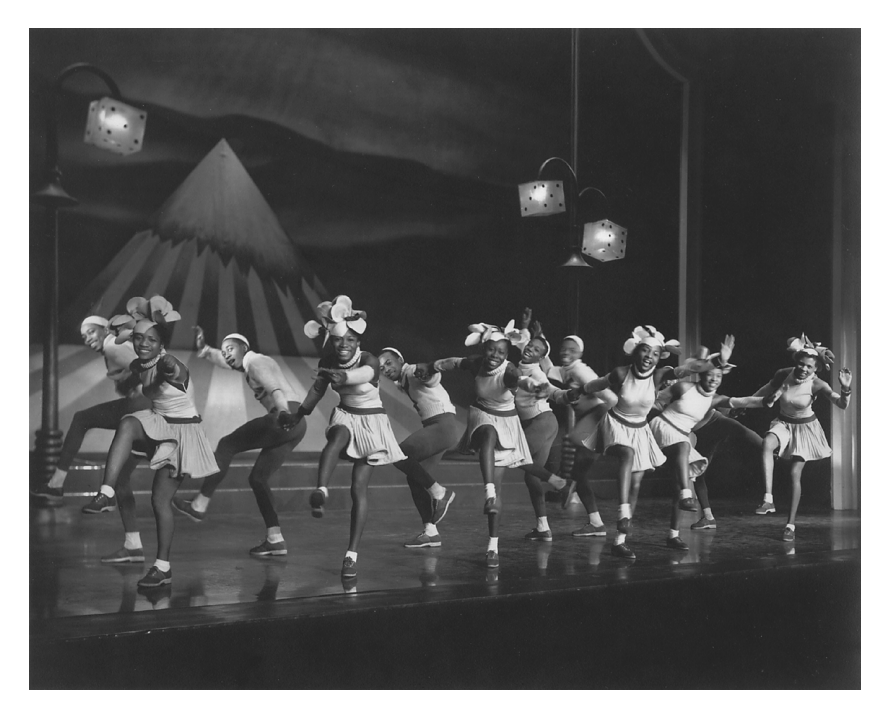
Fig. 3. Whitey's Lindy Hoppers, The Hot Mikado .

of the pagoda gates of the palace in the first act of the Hot Mikado that reviewers dubbed the "Japanese Jitterbug." Significantly, the dancers were billed in the program as Whitey's Jitterbugs, using the "white" slang for swing dance rather than the preferred black term "Lindy Hop." The phrase "Japanese Jitterbug" then, denoted the Asian/Pacific context for a white renaming of a black dance form, for a set of dancers known for the performance in a black nightclub whose own name had been appropriated from the D'Oyly Carte Savoy, and who now danced in front of a fantastic Cotton Club pagoda.