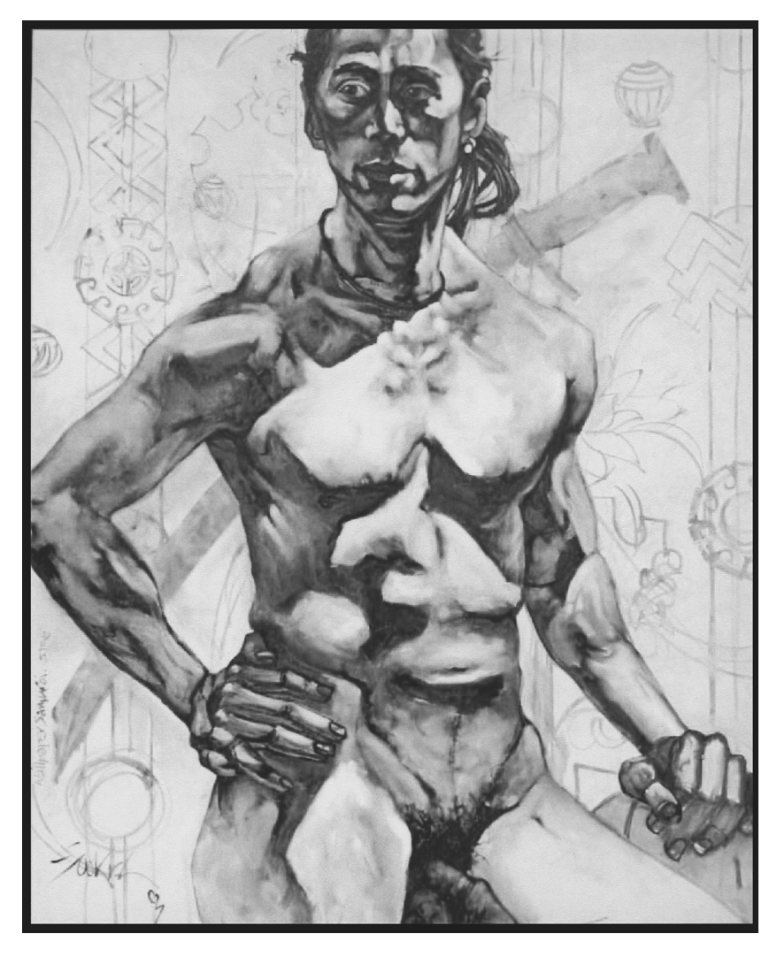
Fig. 4. Andrew Cheddie Sookrah, "Wallpaper Samurai" (oil on canvas, 2003). Used by permission of the artist.

cles of the arms and the legs hint at restrained power and energy. The métissage d body is perhaps another allusion to Guyana, his remembered home where multiraciality is a daily occurrence. Other than this, there is no direct reference to the Caribbean: that is, there is no religious symbolism, not even the uniquely adapted version of the modern. The portrait