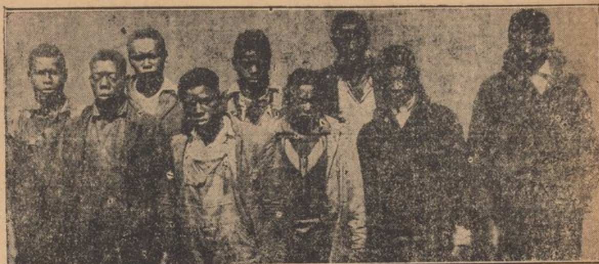
The nine boys are, left to right: Andy Wright, 19; his brother, Roy Wright, 14; Hayood Patterson, 17; Eugene Williams, 14; Willie Robinson, 17; Olen Montgomery, 17; Clarence Morris, 19; Charlie Weems, 20, and Owen Powell, 16.

These are the nine Scottsboro boys through whose tortured bodies the Alabama boss class hopes to shoot chained lightning. These boys are all innocent. But the bosses are growing more desperate as the movement toward unity of action between the white and Negro workers grows. The bosses are still trembling at the discovery that the croppers are organizing to fight against slavery. They are becoming rabid as they realize that the croppers' union at Camp Hill, which they tried to smash with blood and fire still lives. The bosses know that there are new Camp Hills that have grown since their murder drive. They know tomorrow there will be still more. They see the first steps toward a movement that must culminate in the agrarian revolution in the South. They know that the slogan of self-determination for the Negro national minority (which is a majority in 92 contiguous counties of the Black Belt) is striking deep root wherever it reaches, and that it is reaching farther and farther into the densest South.