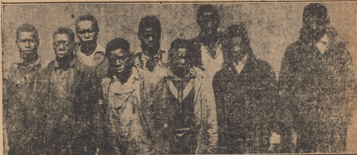
The nine boys are, left to right: Andy Wright, 19; his brother, Roy Wright, 14; Hayood Patterson, 17; Eugene Williams, 14; Willie Robinson, 17; Olen Montgomery, 17; Clarence Morris, 19; Charlie Weems, 20, and Owen Powell, 16.

These are the nine Scottsboro boys through whose tortured bodies the Alabama boss class hopes to shoot chained lightning. These boys are all innocent. But the bosses are growing more desperate as the movement toward unity of action between the white and Negro workers grows. The bosses are still trembling at the discovery that the croppers are organizing to fight against slavery. They are becoming rabid as they realize that the croppers' union at Camp Hill, which they tried to smash with blood and fire still lives. The bosses know that there are new Camp Hills that have grown since their murder drive. They know tomorrow there will be still more. They see the first steps toward a movement that must culminate in the agrarian revolution in the South. They know that the slogan of self-determination for the Negro national minority (which is a majority in 92 contiguous counties of the Black Belt) is striking deep root wherever it reaches, and that it is reaching farther and farther into the densest South.