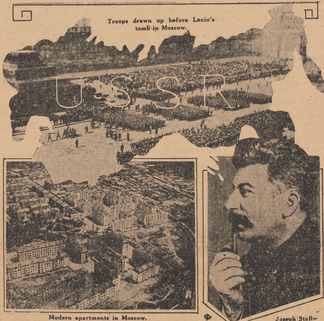
Modern apartments in Moscow.

Workers everywhere should fight for recognition by the United States government of the government of the Soviet Union.