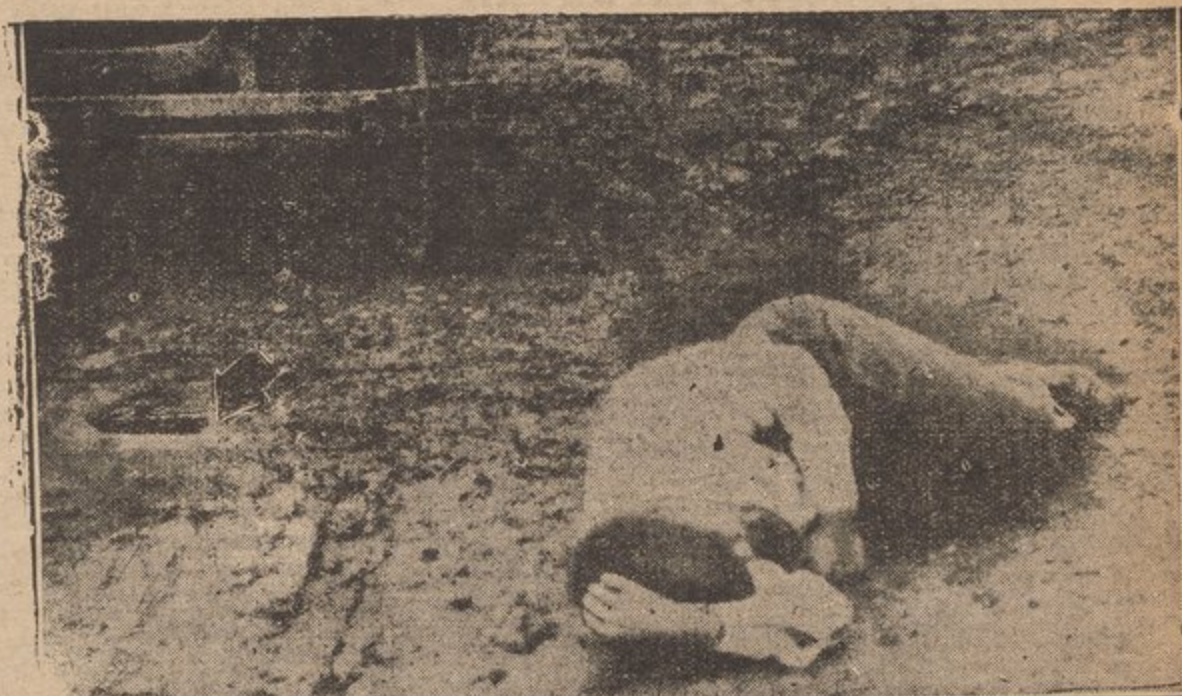
A miner wounded by bullets and shotgun slugs when company gunmen fired into a picket line from ambush at the Wildwood Mine of the Butler Consolidated Co. In front of the auto is a blackjack which one of the thugs threw aside in order to use his gun.