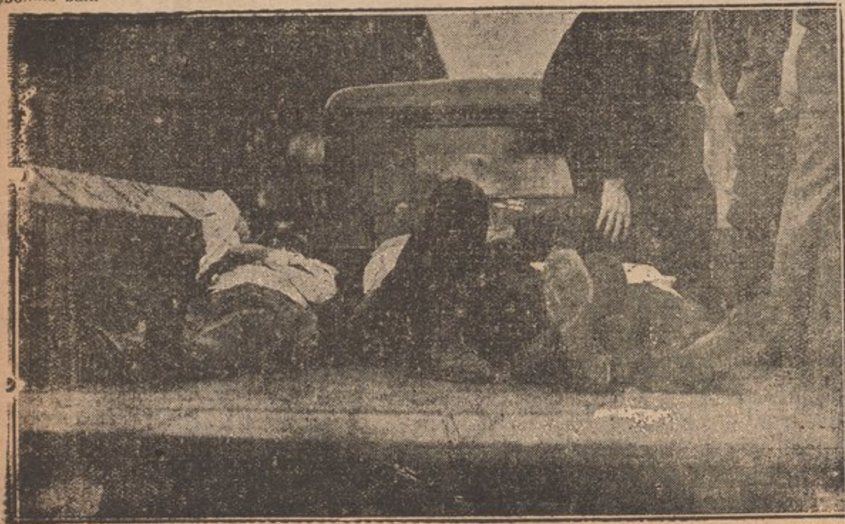
Three of the wounded strikers who were ambushed and shot while picketing the Wildwood mine, are shown lying on a coal truck, being held without any medical attention by the company killers. They were thrown on the steel floor of the truck and shoved about. Before they were picked up they were lying on the roadway for 20 minutes.