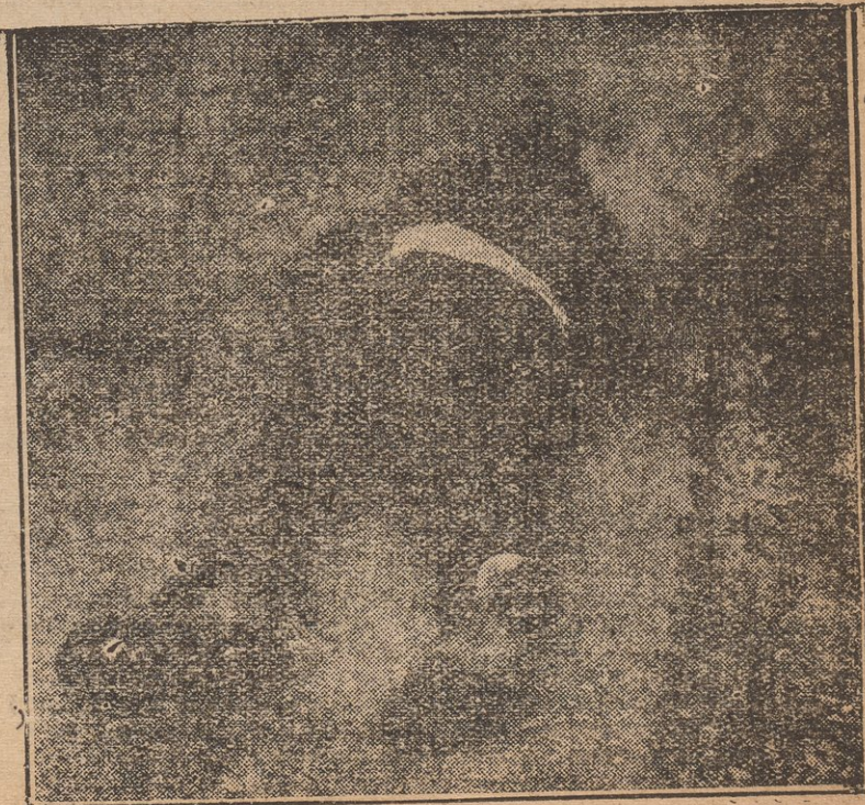
A wounded miner lying on the roadway at Wildwood, Pa. Despite the massacre and terror of the gunmen, another mass picketing demonstration is to be held at this mine. The miners are undaunted and are determined to die fighting rather than to die starving.