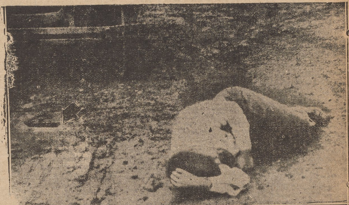
A miner wounded by bullets and shotgun slugs when company gunmen fired into a picket line from ambush at the Wildwood Mine of the Butler Consolidated Co. In front of the auto is a blackjack which one of the thugs threw aside in order to use his gun.