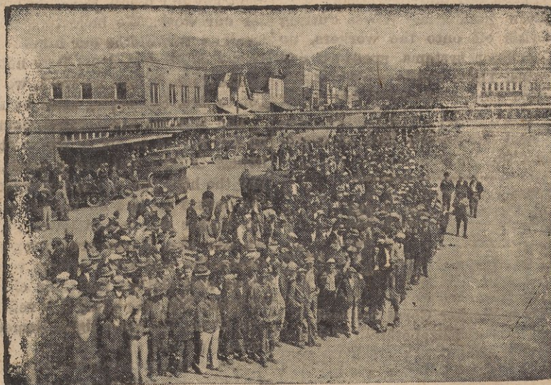
Second Picture—Part of the mob of 10,000 which surrounded the courthouse and howled for the blood of the nine Negro boys at the first trial in Scottsboro, Ala. The Southern boss papers are now saying that there was no mob at this trial.