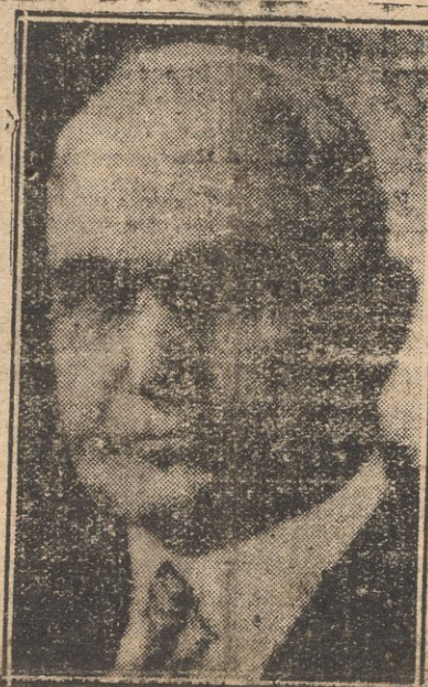
Gov. B. M. Miller of Alabama, who has refused to raise his hand to stop the legal lynching of nine Negro youngsters at Scottsboro.