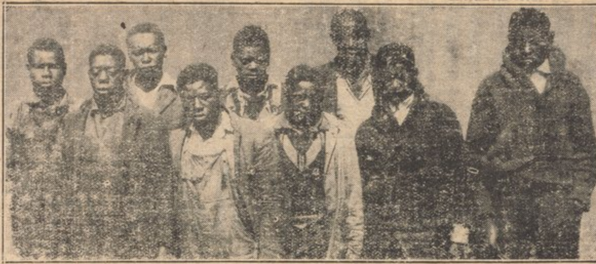
Left to right: Andy Wright, 19; his brother, Roy Wright, 14; Haywood Patterson, 17; Eugene Williams, 14; Willie Robinson, 17; Olen Montgomery, 17; Clarence Norris, 19; Charlie Weems, 20; and Ozie Powell, 16.