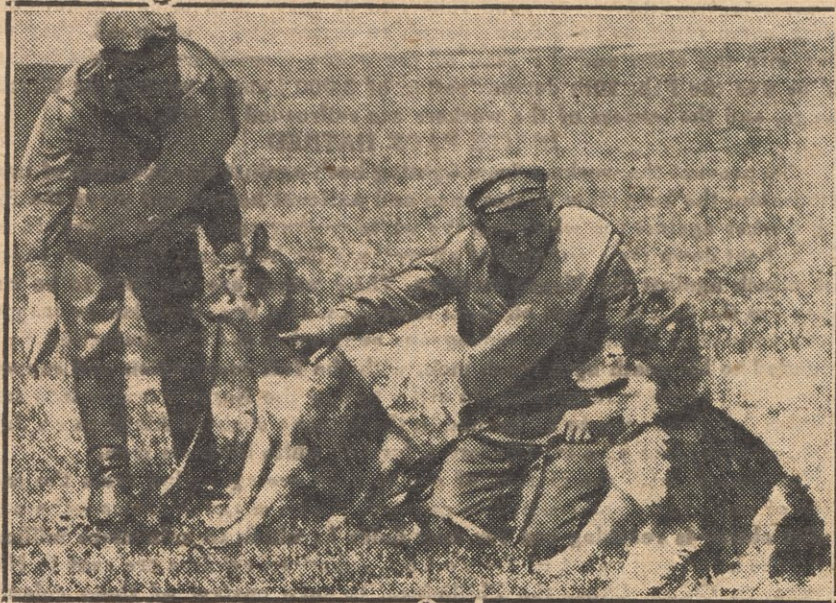
Soldiers of the Soviet Red Army, which is composed of workers and peasants ready to give their all for the defense of the first Workers' State.