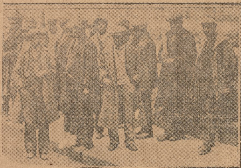
Groups like this wait outside the social service bureau in Chattanooga for the boss slop charity. Fight for cash relief!