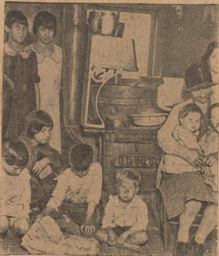
A family of Tennessee mill workers in Knoxville. Wages of a few dollars a week for the children and $9 to $16 a week for the adult workers under conditions of intense speed-up—these have brought about the destitution you see in the above picture. The Tennessee mill workers are organizing under the leadership of the National Textile Workers Union.