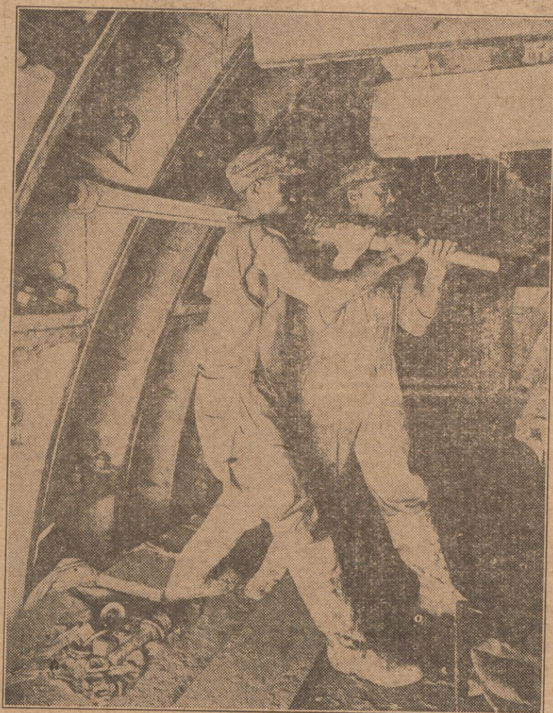
At work in the city tunnel in Chattanooga. These workers get 25 cents an hour, under unbearable speed-up, working sometimes at a 20-hour stretch. "If you don't like," says the boss, "get out." Workers fall from exhaustion at the end of the day's work. Organization and struggle is the only way out.

By a Worker Correspondent The bosses at the Highland Park Mill No. 1 here in Charlotte have installed what they call the efficiency system. They have hired a new man whom they call the efficiency man. His job is to cut wages for the workers. In fact, they told him when he was hired that he could stay with them only if he could cut the wages of employees enough to pay for his wage. He sure knows how to do that. First this efficiency man cut the overhead expenses, then he cut the truck drivers wages and the yard help. Now he is preparing to cut our meagre wages which are already so low from wage cuts that we can hardly live. In fact we are starving faster at work, it seems, than we would if we were not at work.