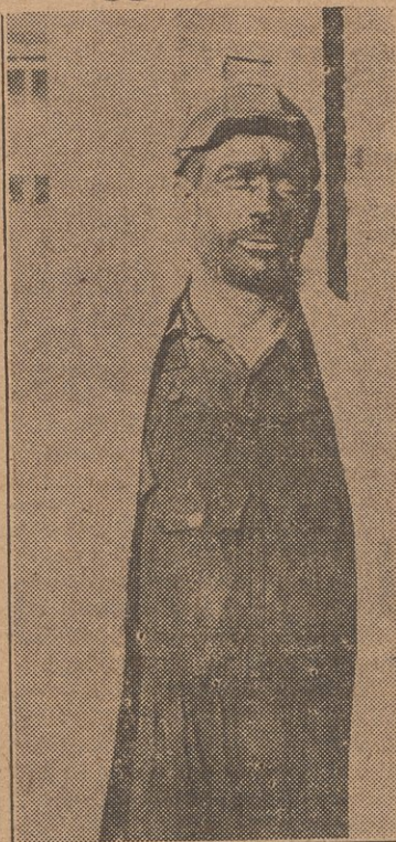
The miners at Birmingham prepare for struggle against the Tennessee Coal and Iron Co.