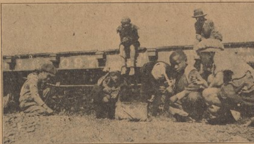
Negro children picking pieces of coal out of the cinders on a railroad track in Chattanooga.