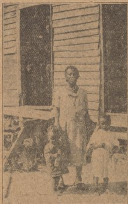
A tenant farmer's wife and children. Over 30,000 tenant farm families in Alabama are sure to starve this winter.

didates are allied on the basis of preventing the workers from organizing and fighting against lay-offs, wage-cuts and starvation.