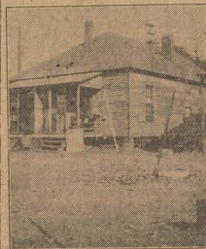
A Negro worker's home in Chattanooga. Notice the ramshackle building and the dirt street which is like a river bed when it rains.