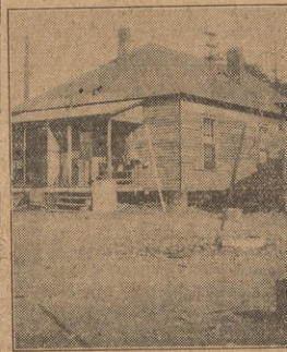
A Negro worker's home in Chattanooga. Notice the ramshackle building and the dirt street which is like a river bed when it rains.