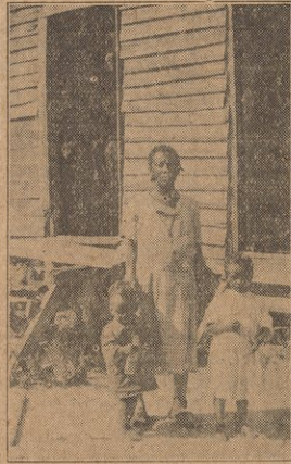
A tenant farmer's wife and children. Over 30,000 tenant farm families in Alabama are sure to starve this winter.

The boss candidates — Bankhead, Locke, Miller, or Hefflin—represent the interests of the employers, the same interests that are being carried out by the police department of Birmingham for the Tennessee Iron and Coal Company in the campaign of terror being waged against Communist and T. U. U. L. organizers. The K. K. K., which has sent death threats to our organizers and burned them in effigy, is closely allied with the A. F. of L. misleaders and also supports Hefflin. The Democratic city government arrested our organizers and gave them chain gang sentences, throws hundreds of unemployed workers on the chain gang. All these can-