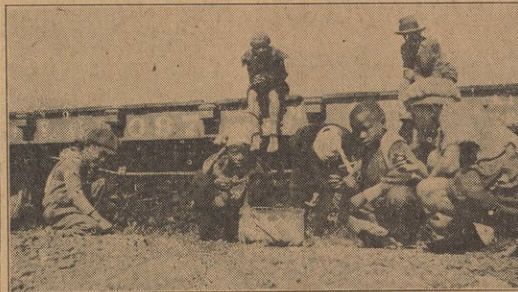
Negro children picking pieces of coal out of the cinders on a railroad track in Chattanooga.