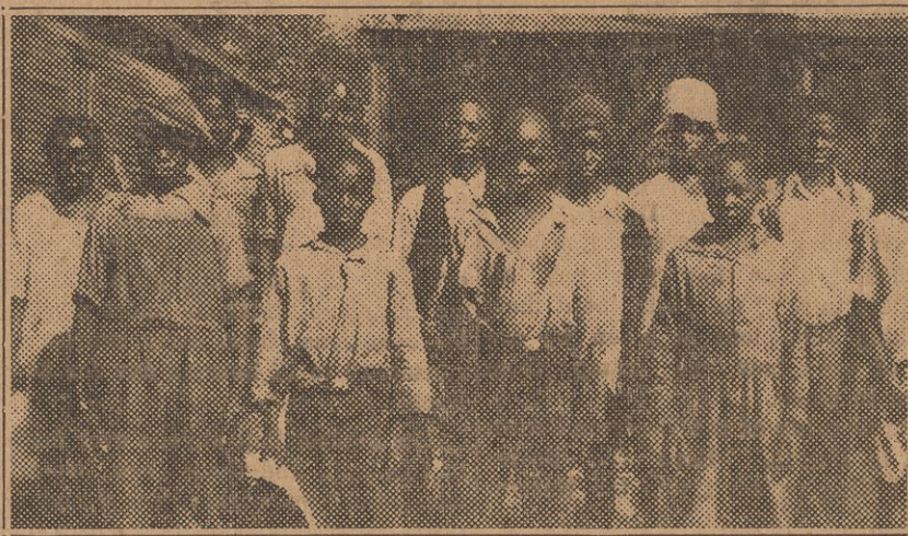
These Negro children, from 10 to 14 years old, work on ice wagons, in lunch counters, for stores. Most of them must be up at 4:30 in the morning. They are members of the Pioneer Group of Chattanooga.