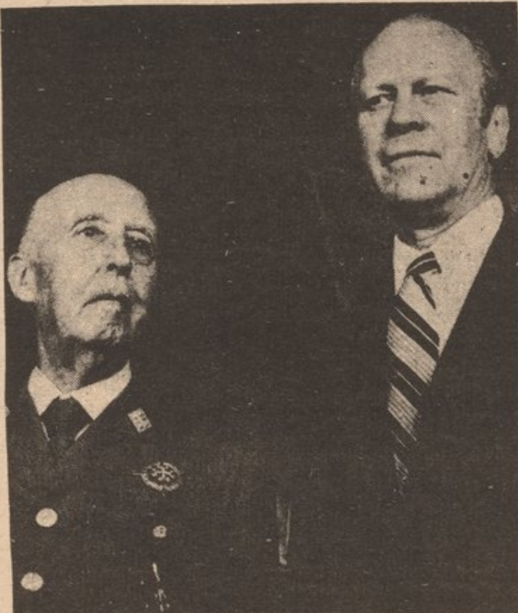
Franco and Ford

The Cortes, parliament, was re-established in July 1942, but there were no elections for the Cortes' representatives until 1971, and those elections were for family representatives only which means they were going to deal with domestic problems. The Cortes elected Juan Carlos, Prince of Spain and Franco's heir, in July 1969. By 1966 Franco put out a program called the Organic Law. They made a lot of propaganda. The t.v., the radio and the press came out to please their fascist boss. They used to say, "Vote for a better life. Vote Yes. Vote for the welfare of the Spanish people. Vote for Peace and Social Order." We know that to vote No would not make any difference because there was only one candidate and that was Franco. Even so, there was a lot of people who voted No and many more who did not vote. Those were the people who wanted a change but for lack of or-