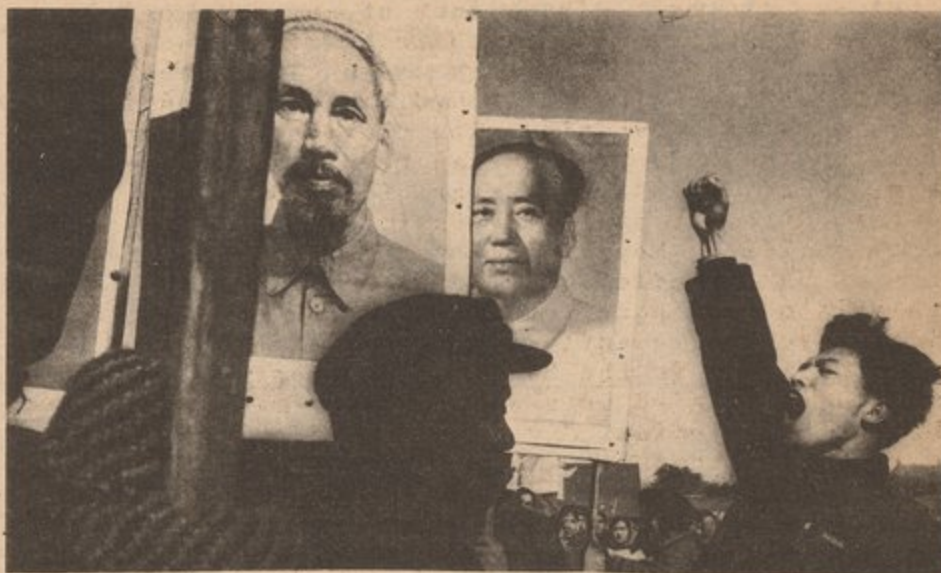
We must carry out our internationalist duty and build the Party. Above, demonstration in Peking, Feb. 7, 1965, after the first U.S. bombing of North Vietnam.

amounts to attacking, distorting and revising the fundamental principles of Marxism-Leninism-Mao Tse-Tung Thought. The days of claiming to be profound, of claiming to be the sole representatives of the line which is going to "vaccinate" us against "old germs" the sole basis, and guarantee that the Party won't degenerate, the days in which as a result of belittling theory, as a result of