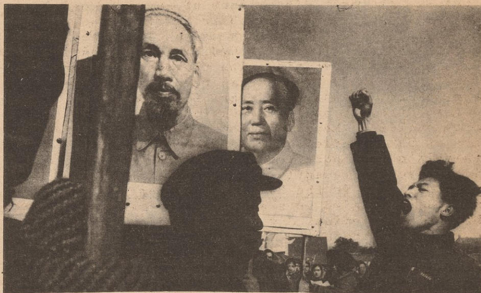
We must carry out our internationalist duty and build the Party. Above, demonstration in Peking, Feb. 7, 1965, after the first U.S. bombing of North Vietnam.

amounts to attacking, distorting and revising the fundamental principles of Marxism-Leninism-Mao Tse-Tung Thought. The days of claiming to be profound, of claiming to be the sole representatives of the line which is going to "vaccinate" us against "old germs" the sole basis, and guarantee that the Party won't degenerate, the days in which as a result of belittling theory, as a result of