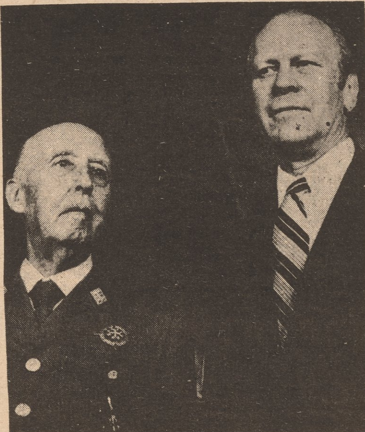
Franco and Ford

The Cortes, parliament, was re-established in July 1942, but there were no elections for the Cortes' representatives until 1971, and those elections were for family representatives only which means they were going to deal with domestic problems. The Cortes elected Juan Carlos, Prince of Spain and Franco's heir, in July 1969. By 1966 Franco put out a program called the Organic Law. They made a lot of propaganda. The t.v., the radio and the press came out to please their fascist boss. They used to say, "Vote for a better life. Vote Yes. Vote for the welfare of the Spanish people. Vote for Peace and Social Order." We know that to vote No would not make any difference because there was only one candidate and that was Franco. Even so, there was a lot of people who voted No and many more who did not vote. Those were the people who wanted a change but for lack of or-