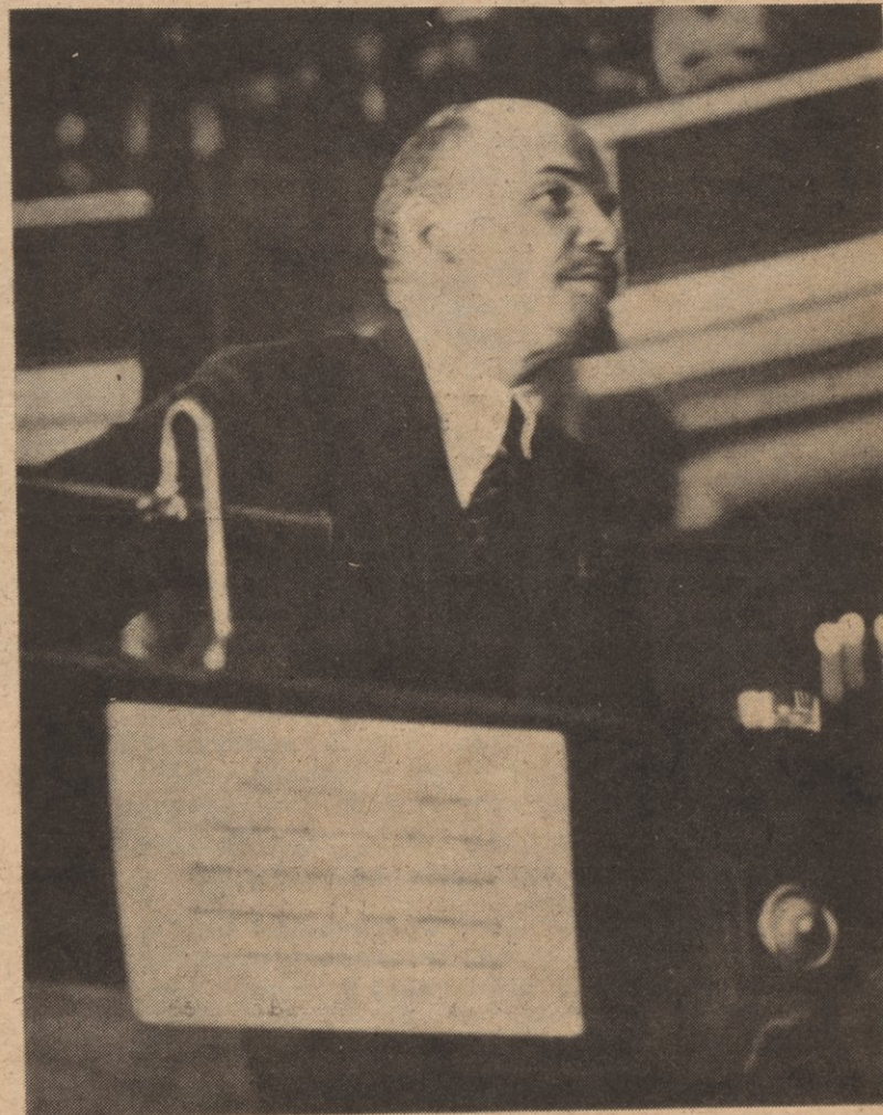
cont. on pg. 8

It is true that the WVO has made some contributions in the struggle against the OL, but they also failed to go to the essence of the OL's right opportunist line. This is because, in essence, they are in unity on how they see party building. The Menshevik line on party building coming forward in the WVO line is contained in a