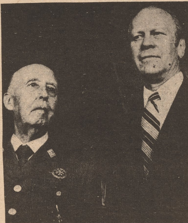
Franco and Ford

The Cortes, parliament, was re-established in July 1942, but there were no elections for the Cortes' representatives until 1971, and those elections were for family representatives only which means they were going to deal with domestic problems. The Cortes elected Juan Carlos, Prince of Spain and Franco's heir, in July 1969. By 1966 Franco put out a program called the Organic Law. They made alot of propaganda. The t.v., the radio and the press came out to please their fascist boss. They used to say, "Vote for a better life. Vote Yes. Vote for the welfare of the Spanish people. Vote for Peace and Social Order." We know that to vote No would not make any difference because there was only one candidate and that was Franco. Even so, there was a lot of people who voted No and many more who did not vote. Those were the people who wanted a change but for lack of or-