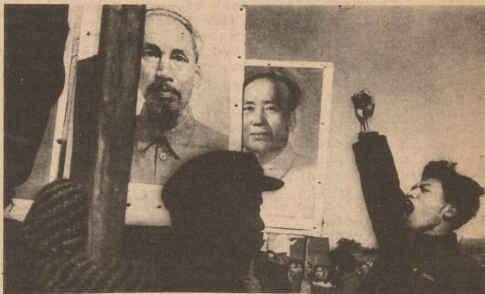
We must carry out our internationalist duty and build the Party. Above, demonstration in Peking, Feb. 7, 1965, after the first U.S. bombing of North Vietnam.

amounts to attacking, distorting and revising the fundamental principles of Marxism-Leninism-Mao Tse-Tung Thought. The days of claiming to be profound, of claiming to be the sole representatives of the line which is going to "vaccinate" us against "old germs" the sole basis, and guarantee that the Party won't degenerate, the days in which as a result of belittling theory, as a result of