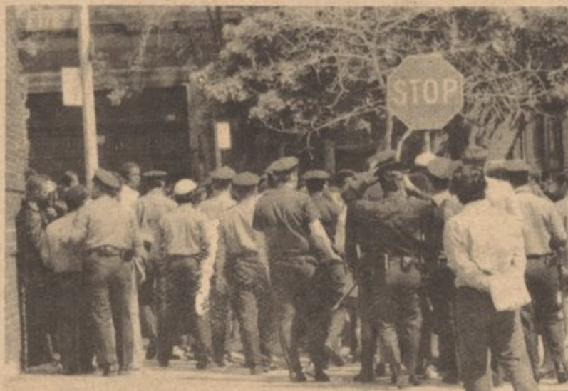
Pigs Defend Rag

LONG LIVE THE PUERTO RICAN FLAG! LONG LIVE THE BLACK