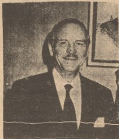
PUERCO DE LA SEMANA

El 17 de Febrero es un día nacional de llantos para Puertorriqueños. Ese día hacen 66 años luis ferre, gobernador colonial de Puerto Rico, nació. La familia de este bandido vale $120,000,000, a la misma vez que el mantiene el salario promedio del Puertorriqueño, a $1,200. La familia ferre levanto su imperio capitalista con dinero prestado del gobierno gringo que usaron para hacer fabricas de cemento y venderle ese mismo al ejercito que contruia bases militares en Puerto Rico durante la segunda mundial. ferre le a vendido $2 billiones de minas de cobre de la cordillera central de Borinquen, a compañías yanquis, por un permiso de $10. Este compañero de cama de nixon (los dos estan en el partido republicano de una forma o otra) esta tratando de venderle la isla de Culebra a los marinos norteamerikkkanos. Un miembro de junta directiva de la universidad M.I.T. en massachusetts (de donde se graduo—tambien atendio escuela superior en morristown, n.i.) ferre se a descrito el mismo como "revolucionario en mis ideas, liberal en mis objetivos, y conservativo en mis metodos"—que suma a zero para Puerto Rico.