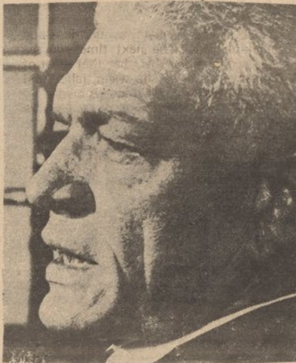
JUAN BOSCH- P.R.D.

2) La compania de aluminio de amerikkka (alcoa) son los duenos de la mina de bauxite en Cabo Rojo. La proxima vez que Ud. vea sus anuncios en el television recuerdese que la plancha de aluminio fue