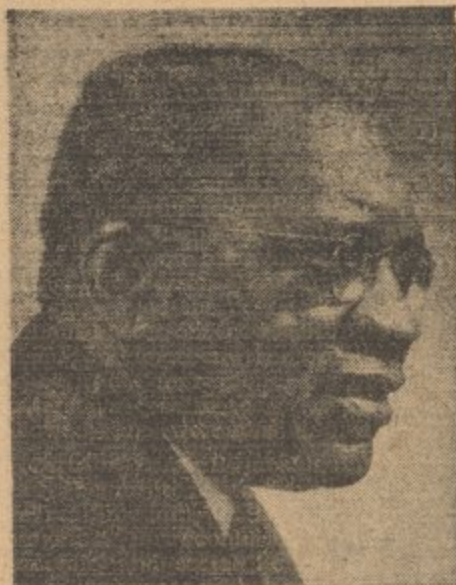
William L. Patterson

In New York a committee of women relatives of civil rights victims is sponsoring a testimonial dinner to Patterson on Thursday, August 26, 7:00 p.m., at Small's Paradise, 2294 7th Ave. Reservations, at $2.00 a plate, may be had by calling WATKINS 4-6356.