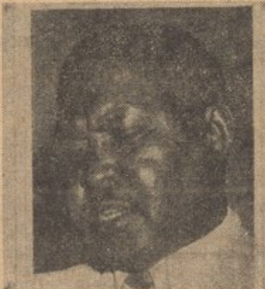
Chief James A. Luthuli (Pres. A. N. C.)

The right of freedom of assembly is being increasingly trampled upon in South Africa. Meetings anywhere require special sanction of local authorities, and when granted the permit contains onerous conditions. For example, the permit for the A.N.C. (Cape) to hold its annual conference at Uitenhage last June con-