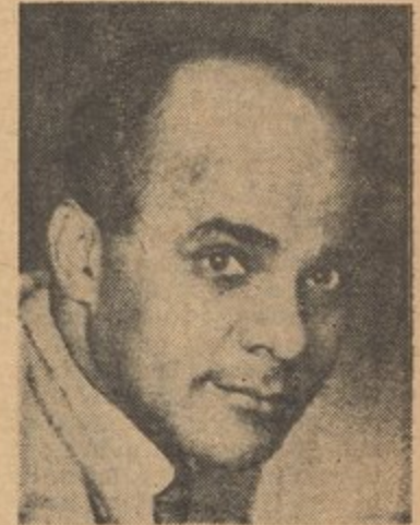
John O. Killens

YOUNGBLOOD, by John O. Killens. The Dial Press, Inc., 461 Fourth Ave., New York 16, N. Y. $3.95.