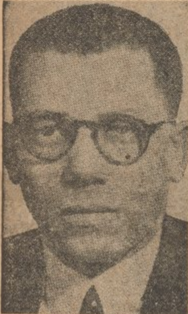
Walter Sisulu (Sec.-gen. A. N. C.)

So say we. One thing you can do is write the South African Embassy, Washington 8, D. C., and demand that A. N. C. leaders James Luthuli and Walter Sisulu be freed from all restrictions on their activities. All support to the African National Congress and to the coming Congress of the People in South Africa!