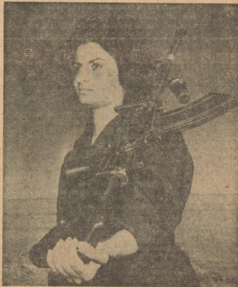
STANDING ON GUARD with Bren gun, this Egyptian patriot reflects the determination of her people to decide their own destiny.

Guatemala is today a symbol for the future merging of the three main human races, the Mongoloid (to which the Indians belong), the Negroid, and the Caucasoid. Her heroic fight for the restoration of real democracy has been taken up by the people of every Latin American nation. With this support and that of the rest of the people of the world in whose hearts and minds the fight for justice and peace is uppermost, they cannot lose.