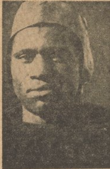
Robeson of Rutgers

Well, it was Walter Camp himself, the foremost authority on the game, who named Paul