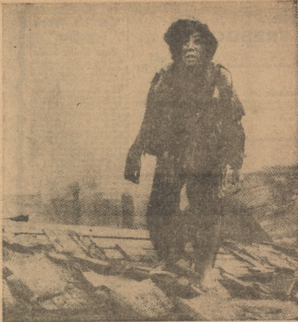
MINE, with her head burnt, manages to get out through the collapsed roof of her house. "MITCHIKO! . . . AKIO! . . ." Her cry rings out calling her children — but it finishes in a strange silence.

The Patterson Defense Committee urges all friends to send birthday greetings to: William L. Patterson, PMB 10811, Danbury, Conn.