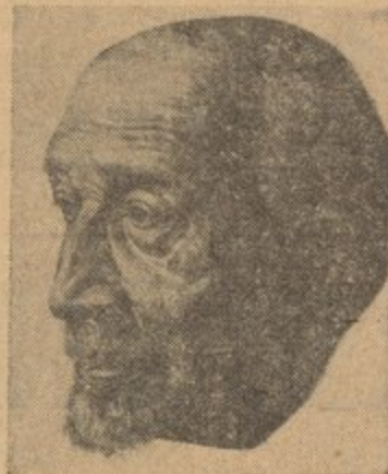
W. E. B. DuBois

African movement after the first World War during the peace efforts which followed. This had no wide backing among American Negroes and few tangible results in the world. But the Congresses, held regularly from 1919 to 1925, did several important things; they aroused the imperialists of Europe to the danger to them of African thought and co-operation; they inspired Africans in every center where they had active leadership to organize local African Congresses. Today there are such African Congresses in every land where African movements toward autonomy and freedom are taking place: in West Africa; in the Sudan; in South Africa; the Rhodesias and Nyassaland. The contemporary Garvey movement affected the Negroes in the U.S. and the West Indies toward attempts to organize there as peoples of African descent.