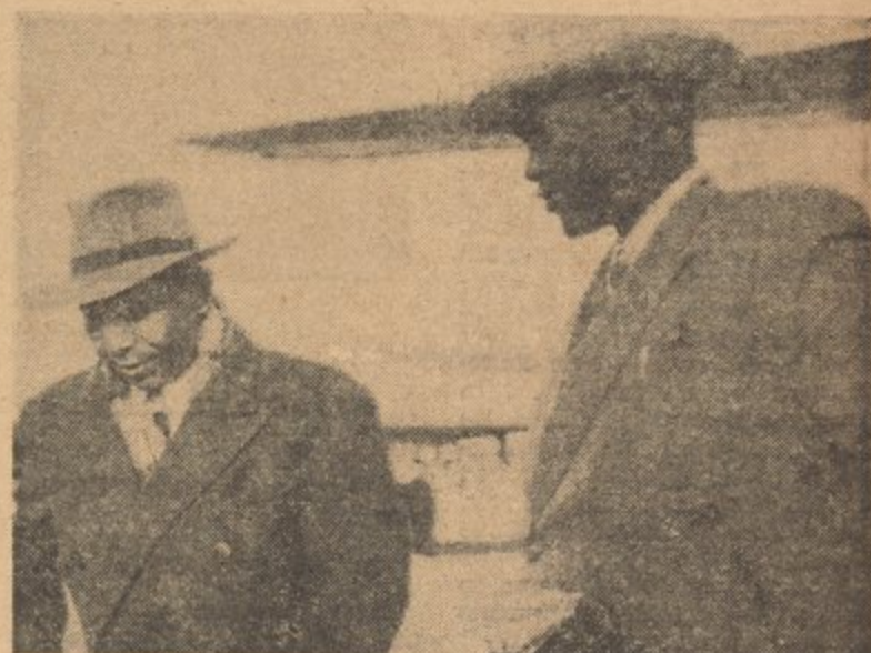
GABRIEL D'ARBOUSSIER, left, and Mamadou Konate, leaders of the powerful African Democratic Rally, anti-imperialist movement of the black Africans in the French African colonies, are shown at an airport in French West Africa. Dr. DuBois will discuss the Rally and other liberation movements in an article in the May issue of FREEDOM.

Thus the center of the fight for maintaining and restoring colonialism is moving today from Asia, where Europe and the U.S. are losing, to Africa, where they are organizing a determined last stand for making the color line perpetuated in the modern world. Surely this is a matter in which American Negroes must be interested, for if colonial serfdom is maintained in Africa the color line will not disappear in Afro-America. How then does the battle line in Africa stand today?