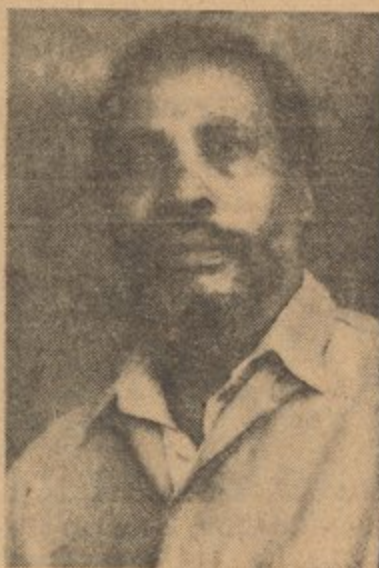
Jomo Kenyatta Leader of the KAU

Thus forced off their land, the Africans constitute a vast pool of cheap labor, more than often conscripted to work by the government. They are thus forced into the unspeakable slums of Nairobi and other cities, there to work for miser-