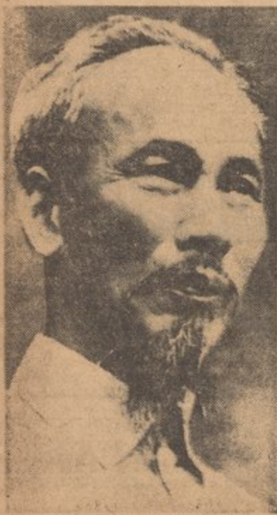
Ho Chi Minh