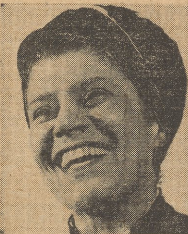
Eslanda G. Robeson ('A Very White Committee')