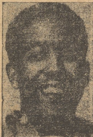
Langston Hughes (No Support for Simple)