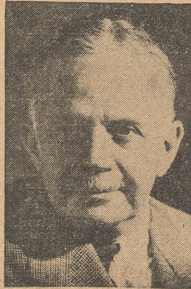
Walter White (War Book Irked Ike)