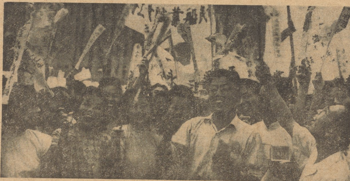
WAVING BANNERS AND SHOUTING SLOGANS for peace and independence, these Chinese students have found new dignity and new opportunity in New China.

Here I must mention the educational reform in New China. The new government of China has systematically carried out such reforms in all aspects of the old educational system according to plan. First, there was a general reform of the educational system. The key to the new system is the