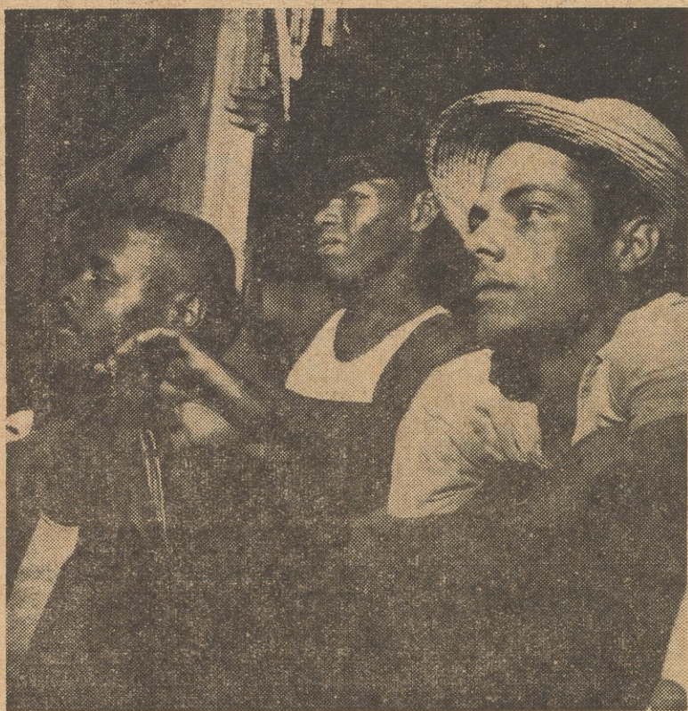
THESE LATIN AMERICAN sugar workers have a common fight with the Louisiana strikers.

About 80% of the farm workers in Louisiana cane fields are Negroes. Their wages and working conditions are directly affected by the sub-standard conditions imposed upon the workers in the sugar