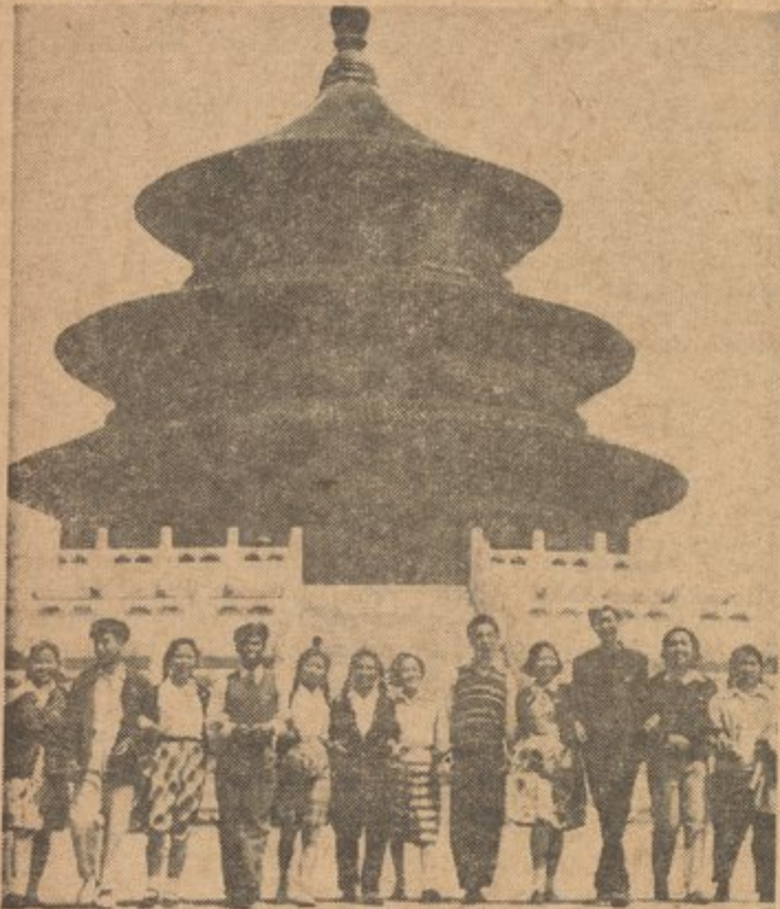
CHINESE YOUTH STROLL through the grounds of the ancient Temple of Heaven. The Emperor and his court used to worship here for good harvests; his subjects could not enter the grounds. In 1952 school enrollment had increased over 1949 levels as follows: primary schools, 101 percent; secondary schools, 142 percent; higher education, 55 percent.