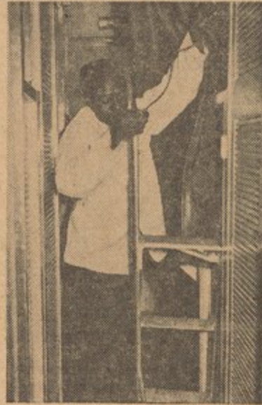
THIS PULLMAN PORTER cannot look forward to being a conductor.

Other groups of independent railway unions among Negroes include the Association of Train Porters, Brakemen and Switchmen; the Protective Order of Railway Trainmen; the Interstate Order of Colored Locomotive Firemen, Engine Helpers, Yard and Train Service Employees and Railway Mechanics; and the International As-