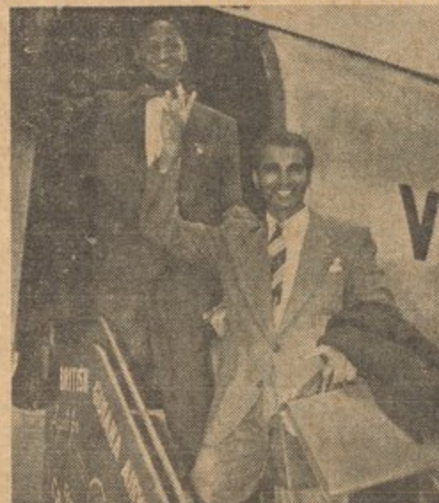
BURNHAM AND JAGAN take London-bound plane in British Guiana to argue their people's case.

GEORGETOWN, B. G. — In British Guiana, one of Britain's richest possessions, exploitation has for over a hundred years continued without any notable challenge. Up until recent years, the British have encountered only sporadic opposition to the prosperous rape of the wealth of the country. Sugar, rum, bauxite, gold, diamonds and recently the discovery of columbite and tantalite have made them even more greedy. With the growth of the trade union movement, workers began to learn that they had rights and increasing demands were made for better wages and working conditions. When the People's Progressive Party was organized four years ago, it immediately proceeded to unite all sections of the oppressed people and succeeded in overcoming the racial divisions which had previously prevented any form of united action. The majority of trade unions gave unstinted support to the new popular movement. When the Party, this year, was successful in winning a majority at