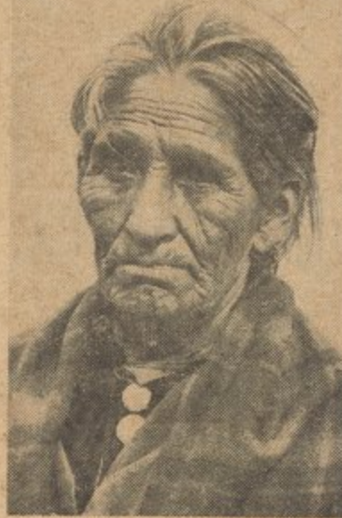
A NAVAJO WOMAN

Also take Kentucky the old stamping ground of Daniel Boone. The State motto is—"United we stand, Divided we fall." About one quarter of the State is covered with forests, oak, sycamore, walnut, pecan, ash, maple, willow, gum and laurel trees in abundance. Kentucky also got plenty of coal, petroleum, tobacco and corn and its got Fort Knox where all the nation's gold is stored . . . but Kentucky only has forty-four Indians. Maryland