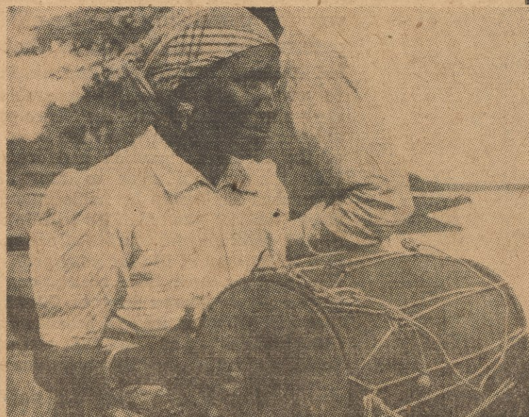
THIS WOMAN, beating an ancient drum in modern British Guiana, is typical of the 85% of the people who voted for the Peoples Progressive Party.

The man slyly hints in his confused column, "the only way to prevent communist control would be to take away the peoples' new political independence" (it's not really independence) and restore the full authoritarian power of the British governor." The British