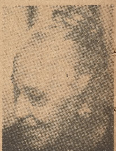
MRS. MARY C. TERRELL

Church dignitaries, women's leaders, in Africa and U.S., must join to resist attacks on Negro leadership.