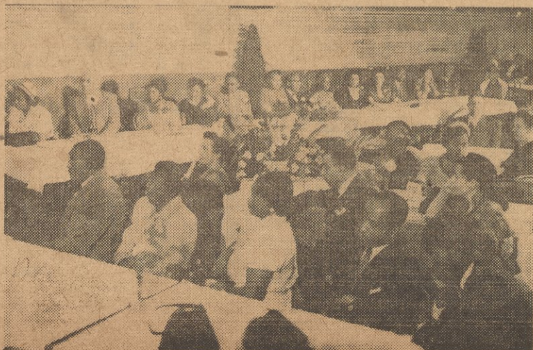
AN IWO celebration of Negro History Week in Chicago.

And of course it is a well known fact that these compa-