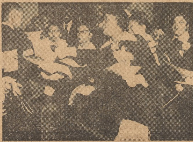
Church members pass peace and freedom petitions in a Chicago church.

And to the Negro Church has been entrusted the responsibility of translating the hopes and aspirations of the Negro for dignity and freedom into reality. When my grandparents sang the spiritual "I am Going to Eat at the Welcome