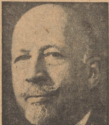
DR. W. E. B. DuBOIS