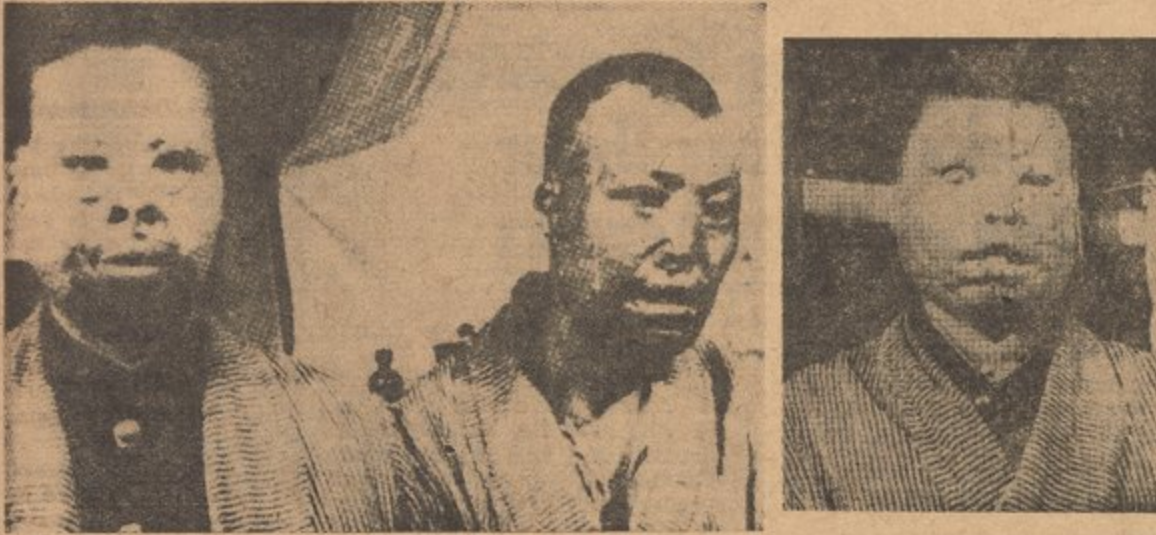
WAR IS HELL! These are victims of the tens of thousands of napalm bombs that have been poured into Korea in recent months. The bomb is made of jellied gasoline which bursts into flame and scorches everything (including human beings) in the area of its target. These victims will live the rest of their lives in horrible pain, their faces frightening masks. Some of them, asleep or awake, can never close their eyes again. They are being "liberated" by U. S. armed might.