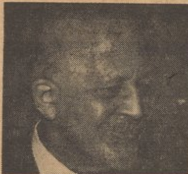
Dr. W. E. B. DuBOIS

In Battle for Peace tells of the indictment, the fight