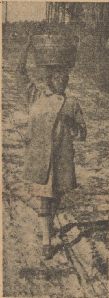
CHILDREN like this little girl are kept out of school for weeks in the cotton-belt to pick the crops of big plantation owners.