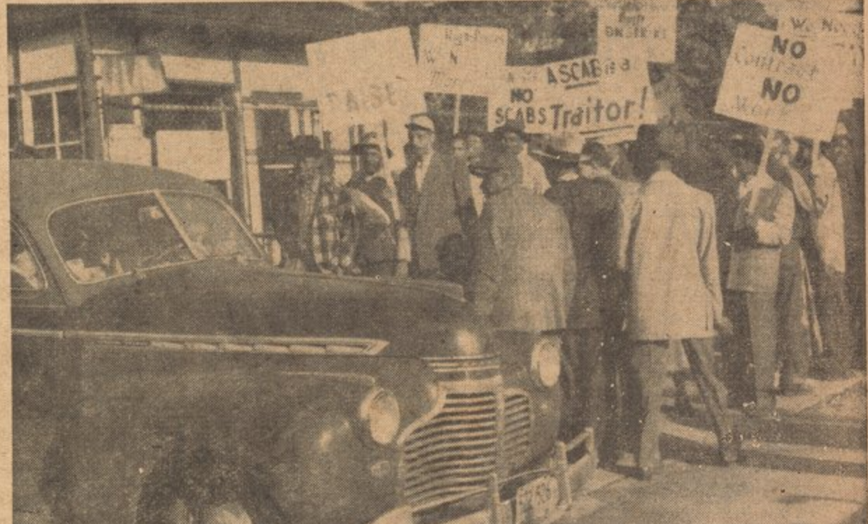
WORKERS AT INTERNATIONAL HARVESTER COMPANY give an unmistakable answer to efforts of industry chiefs to break their strike. Harvester banked on Un-American Committee hearings and a lavish newspaper ad campaign to lure union members back into the plant without improved contract and wage raises they demanded. As the strike moved into its second month the workers said "No." Car in foreground leaving gate contains foremen who visited workers in fruitless efforts to get them to scab.