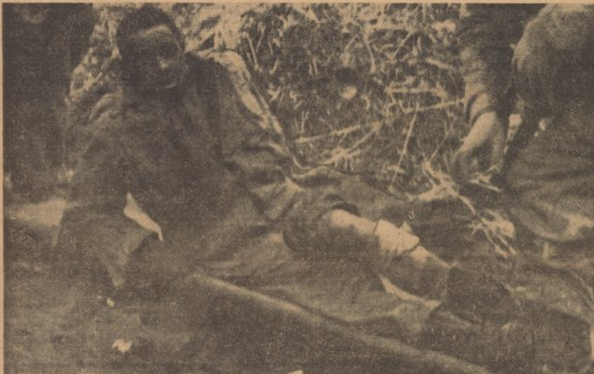
WRONG BATTLE! This Negro youth is one of the 100,000 casualties in Korea. Fighting against a colored people who are struggling for their independence and equality among the nations of the world, he is, himself, a victim of the anti-Negro prejudices of U. S. Army officers, most of whom are Southern "white supremacists." He is needed at home in the fight against Jim Crow and for full citizenship for the Negro people.