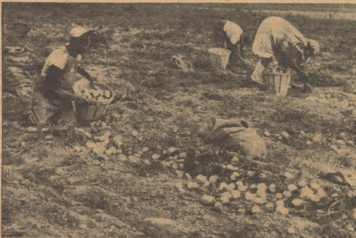
LONG ISLAND, N. Y., is popularly known as the home of solid middle and upper-class families, miles of beautiful beach-front, parks and recreation centers. Few people realize, however, that thousands of Negro migrants, like the potato pickers above, live under the most brutal conditions in "enlightened" New York.