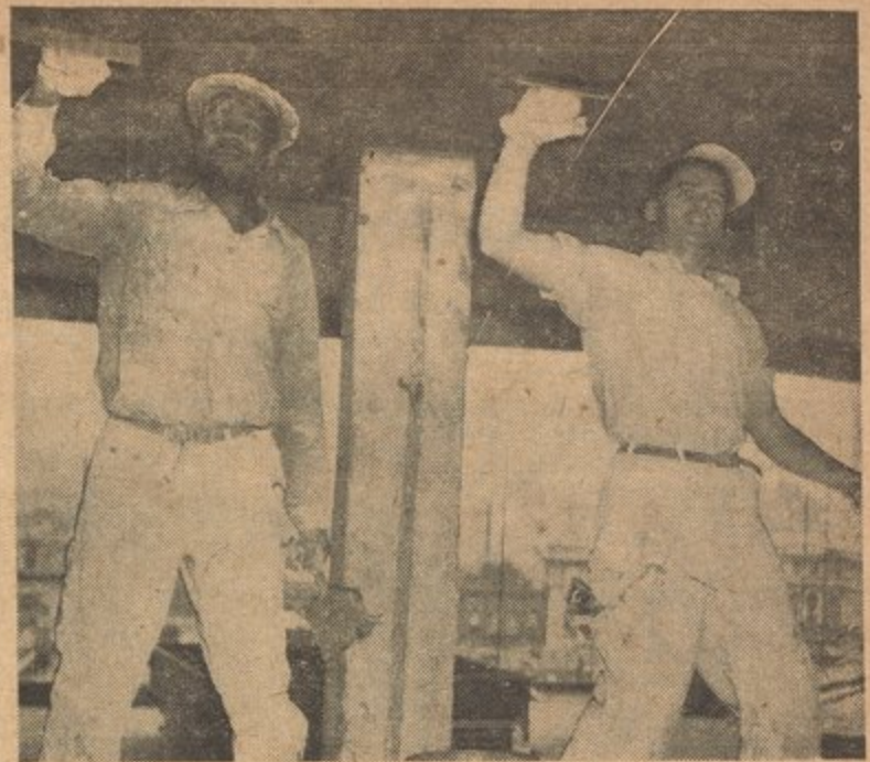
A MASS TURNOUT of Negro voters in November can help to stop the Jim Crow war program and force the use of the people's tax money for useful construction of homes, hospitals and schools.

Numerous assembly posts throughout the city will go to fighting Negro and Puerto Rican leaders, who have achieved the broadest kind of support.