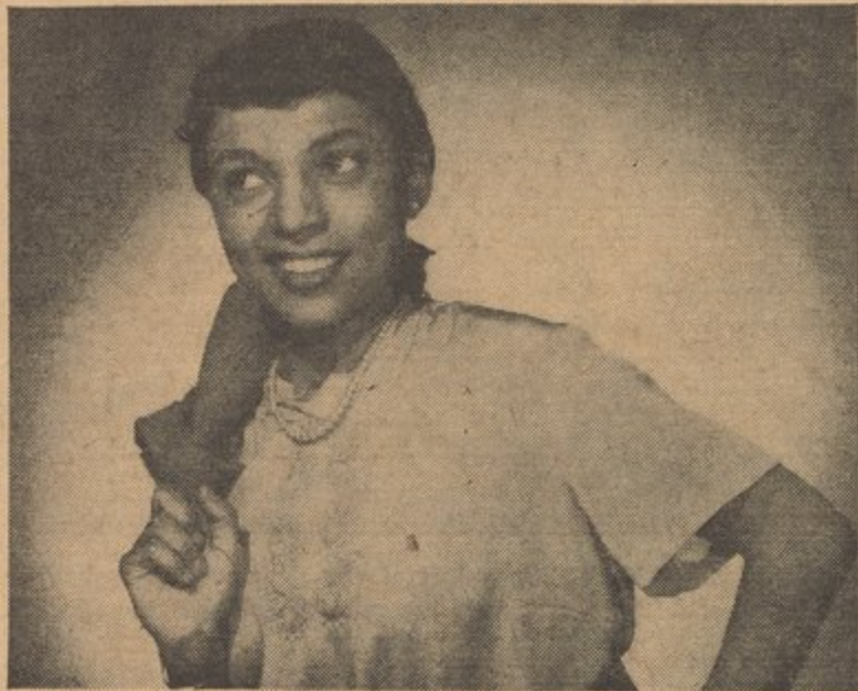
RUBY DEE, star of the "Jackie Robinson Story" and "No Way Out" looks forward to the development of a national Negro theatre.

I thought how typical this bright young woman was of the talented Negro artists who wait from "special role" to "special