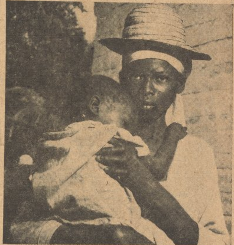
THE LARGEST organized body of Negro people in the U.S., the National Baptist Convention of America, Inc., reflects not only the problems and aspirations of American Negroes, but those of the peoples of Africa, Asia, Latin America and the Caribbean. Above is a Haitian mother and child.

The traditions set down by Nat Turner and the early heroes of the Baptist Church have not been lost in today's efforts to establish a true brotherhood of mankind.