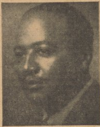
BENJAMIN J. DAVIS, Jr. Harlem wants him in Albany—not in jail.

Canvassers for both committees have been deeply impressed by their experiences in the petitioning. People are eager to know why Ben Davis is in jail. The unproven "force and violence" advocacy charge of the Government is thought a curious one in Negro communities, where white authority is completely disinterested in the part that it plays in the suppression of the Negro people.