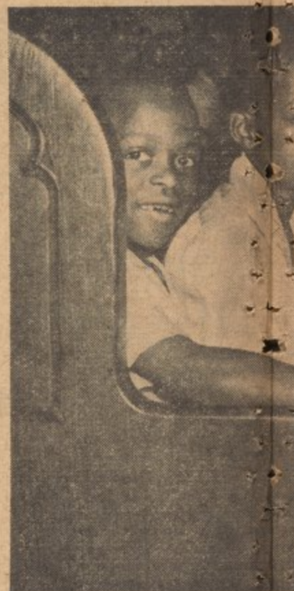
MANY CHILDREN like these young education in Baptist supported schools

This group felt that there should be schools which would be entirely under the direction of Negro Baptists. The results were schools like State University of Kentucky, Selma University in Alabama, Arkansas Baptist College, Guadalupe College in Texas, Virginia Seminary of Lynchburg, Central City College in Georgia,