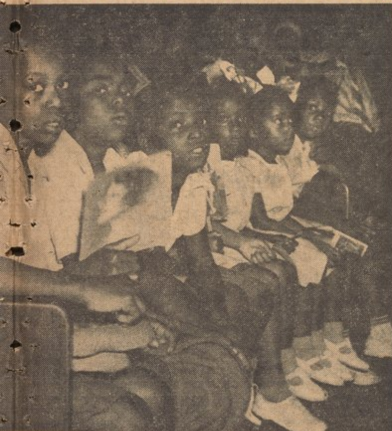
Youngsters above attending Sunday School, will receive their higher education.

opportunities afforded them by the Baptist educational institutions throughout the South which include such nationally known schools as Morehouse College, Shaw University, Benedict College, and Virginia Union