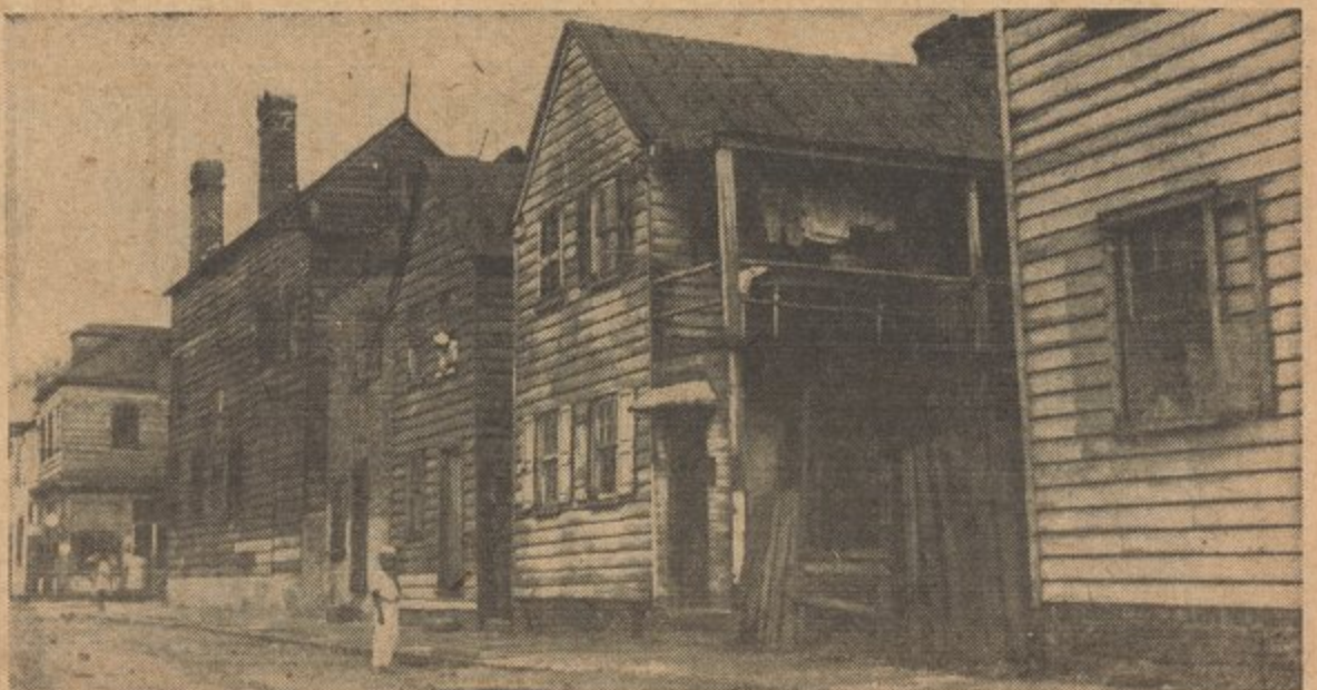
THEY CAN BE VOTED AWAY. The mass registration and vote of eligible Negro voters this fall can wipe out slums like the one above, which scar Negro communities throughout the nation.

October 3, 4, 10 . . . . . 10 a.m. to 10 p.m. October 11 . . . . . 7 a.m. to 10 p.m.