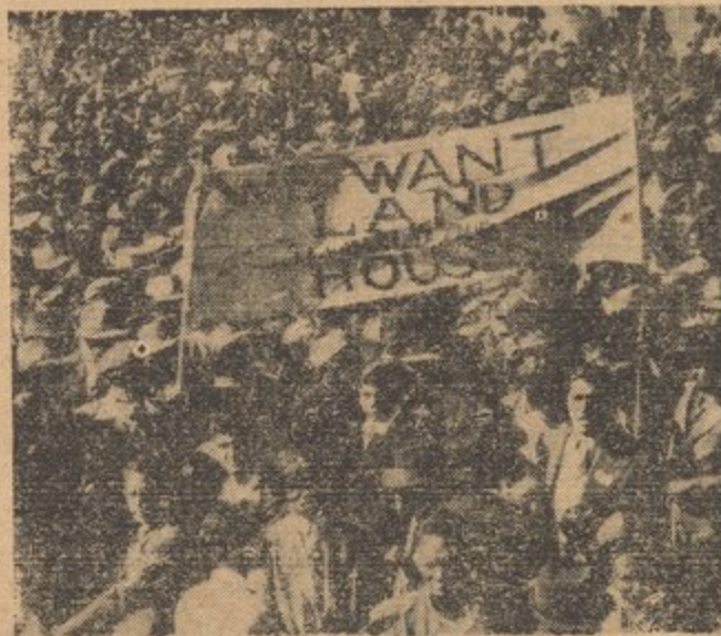
THIS IS A PICTURE of a demonstration of South Africans in the capital city of Johannesburg. Meetings like this one are taking place in all major cities of the country in the campaign of the people against unjust laws.

His brother looked sad, and said: "Yes, they will arrest many more before we win freedom.