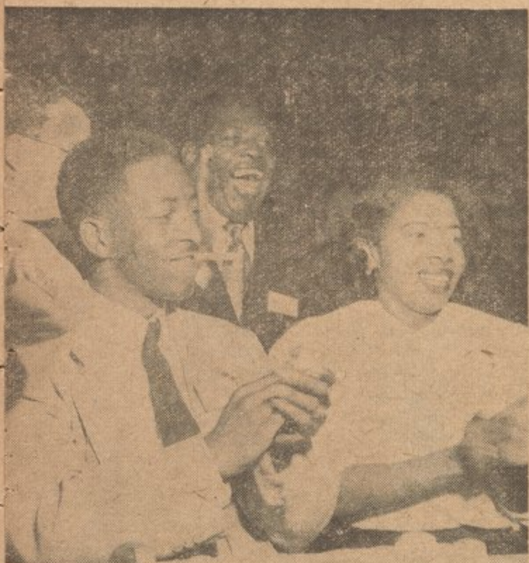
their critics "don't know the difference between communism