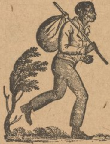
HANDBILL used to advertise for the return of runaway slaves.

I, going to Wellington with the full knowledge of all this,