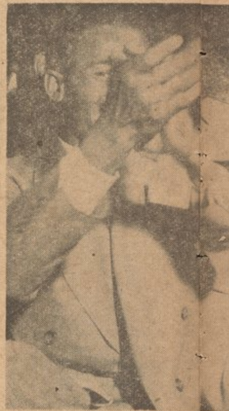
DELEGATES RESPOND to quip their and rheumatism!"