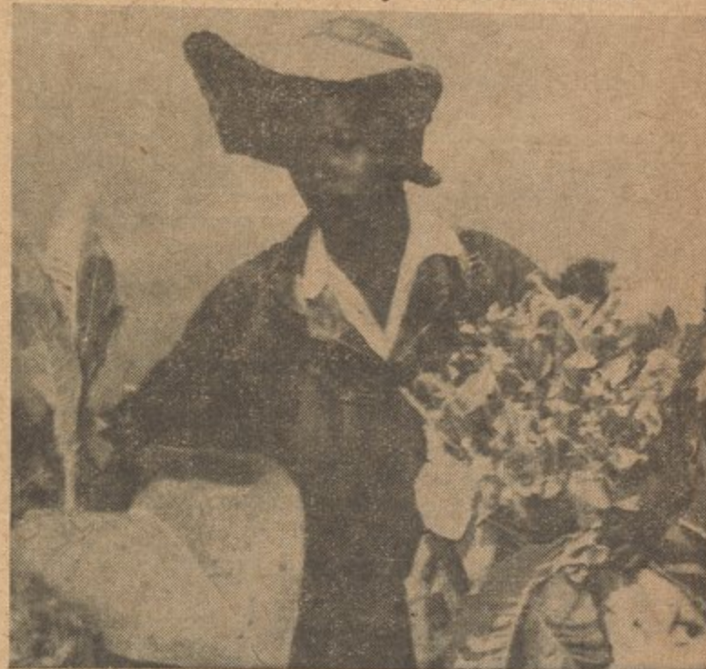
WOMEN TOBACCO WORKERS like this one were represented at the labor convention.