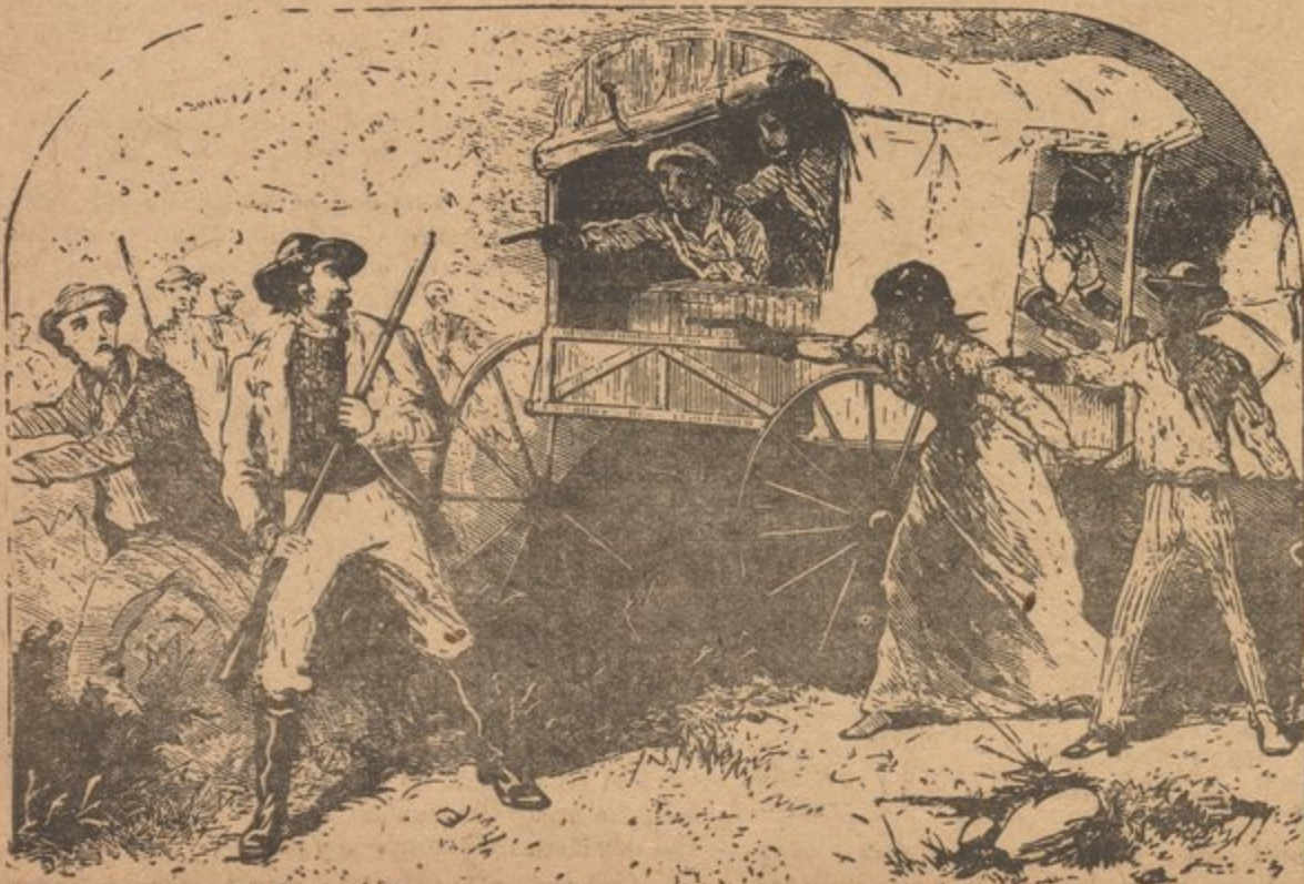
Escaping slaves succeed in breaking through an ambush. (From an old print.)

Registration for the school is going on at 47 West 44 St., N.Y.C., phone MU 7-2161.