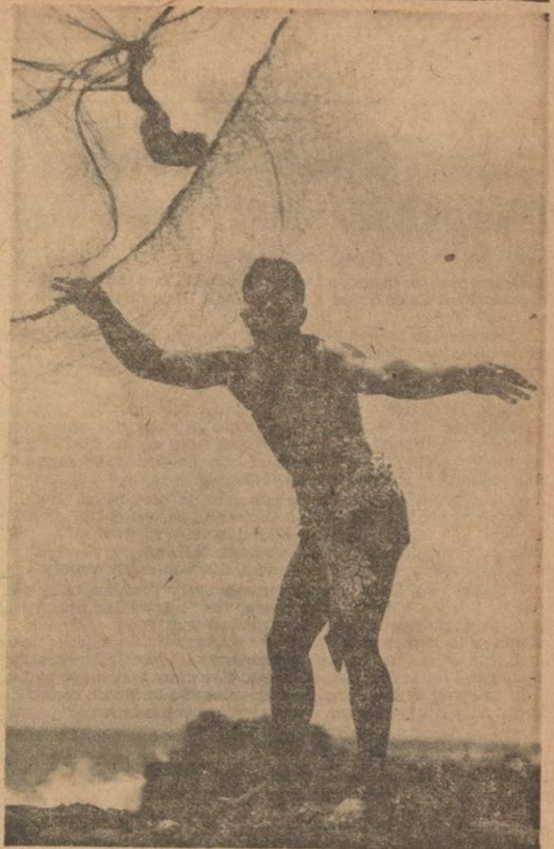
FISHERMAN OF HAWAII spreads his net for the catch that earns him a livelihood. He is descended from the original inhabitants of the island who now form a small minority of the population.