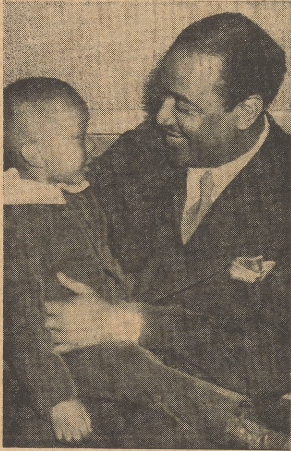
BENJAMIN J. DAVIS JR. , with small constituent when he served as first Negro on the New York City Council.

Of course I am no lawyer, but it seems to me that if Rankin and others can TEACH AND