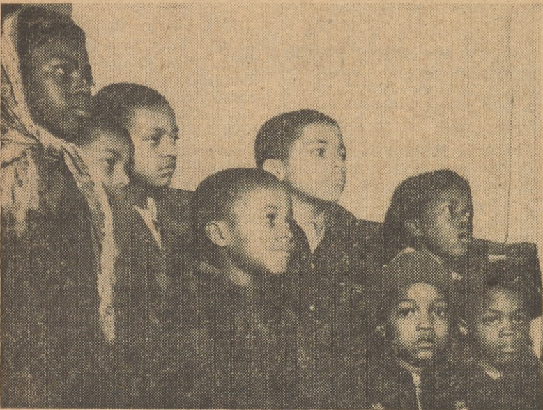
HARLEM'S CHILDREN—what kind of experience can they expect in the crammed, prejudice-ridden schools?

Let's keep the eyes of our youngsters bright! Let the adults make the schools what our children want them to be: "A place to learn the truth about themselves."