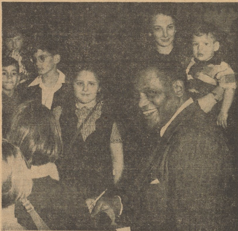
MOTHERS BRING THEIR CHILDREN to meet Paul Robeson. From Norway, Israel, Scotland, India and many other spots they are asking him to come.