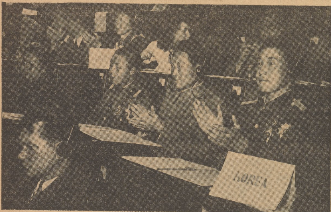
A DIFFERENT KIND OF YOUTH CONFERENCE. This one is in East Berlin, where 25,000 youth from 104 nations joined two million young Germans in a World Youth Festival for PEACE. Photo shows part of the Korean delegation.

For the Voice of America has made it plain that its line is not the line of the majority of Americans, but belongs to the paternalistic plantation owners and bankers who view Negroes as pawns and wards of THEIR "democracy."