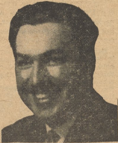
Adam Clayton Powell, Jr. He's gone peddling while...

While Negro "good-will ambassadors" travel all over the world to explain U.S. race relations, the State Department's "Voice of America" has been beaming to European listeners programs which are practically carbon copies of the Dixiecrat attitude toward the Negro people. The broadcasts, intended for the ears of German listeners and not for home consumption, raise the familiar bugbear of "Negro domination" in the South, justify the Klan terror against Negro victims and describe Negroes during Reconstruction as the tools of unscrupulous white "carpetbaggers."