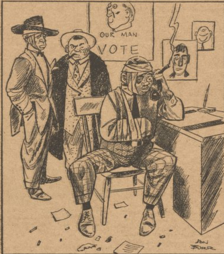
"Look, Senator, we told the meetin' just like you said, to fight the reds and forget about how much pork chops cost. Now if folks downtown gonna keep THAT platform, me and the boys are just naturally gonna have to ask for some group insurance!"

The United States is in honor bound not only to protect its own people and its own interests, but to guard and respect the various peoples of the world who are its guests and allies. Because