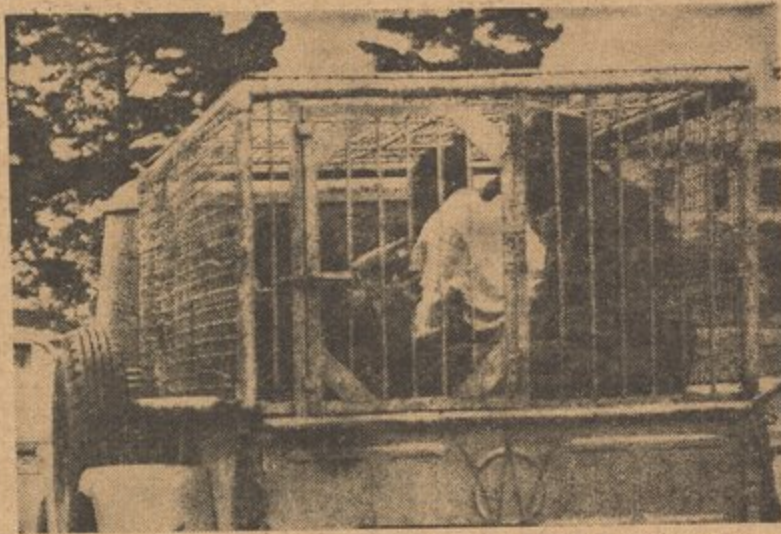
SOUTH AFRICANS being transported in padlocked, caged truck through the streets of Johannesburg to work in the fields of a white farmer. The few pennies a day he pays for this forced labor is turned over to Malan's "white supremacy" government.

Among other faults in the terms forced by the trustee powers upon the U. N.—and more particularly upon the people under their rule, who had no voice whatever in the matter—were the failure to set any time limit on the duration of trusteeship and the failure to provide for the full economic as well as political independence of the colonial peoples upon the termination of trust-