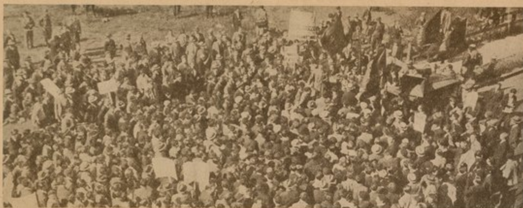
Where Fascist and anti-Fascist meet! When Fascists from Italy attempted to utilize Columbus Day for Mussolini propaganda, the youth of New York responded with a counter demonstration.