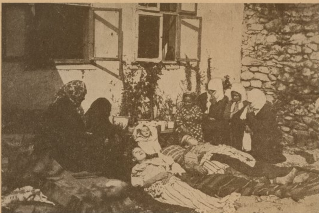
Innocent victims of the World War killed by gas at Monastir, Serbia (now Jugoslavia)

In spite of the strict censorship, the sterilization and castration laws in Germany have produced a wave of indignation which has forced the government to publish in its press reassurances that it will henceforth restrict the enforcement of these laws. Meanwhile, however, these two measures continue to claim new victims.