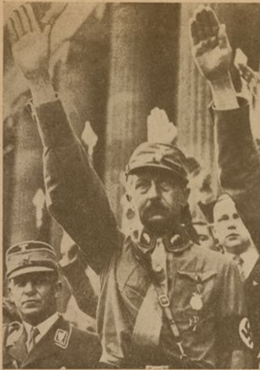
Wilhelm Hohenzollern, son of the ex-Kaiser, in Nazi uniform, giving the Nazi salute