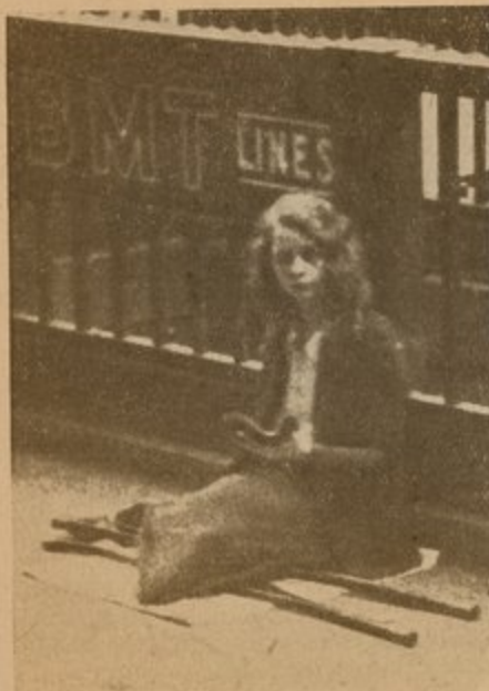
The unemployed and hungry in a great industrial center, in the richest country in the world. (LEFT) A young legless girl begging pennies for bread. (CENTER) A night's lodging. (RIGHT) Rooseveltville, in the heart of New York—here the jobless "eat and sleep"

When a representative of the Socialist Party of New Orleans, the chairman of the Student L.I.D., declared: "I am calling upon the members of the National Committee of our party to enter the League Against War and Fascism and declare a united front with all workers" the hall rocked with applause. When one of the Negro delegates from the Young Women's Christian Association came to the front and pleaded: "Give us literature, pamphlets, material to fight War and Fascism, our members are hungry for it," many realized for the first time that a new spirit was abroad in the land.