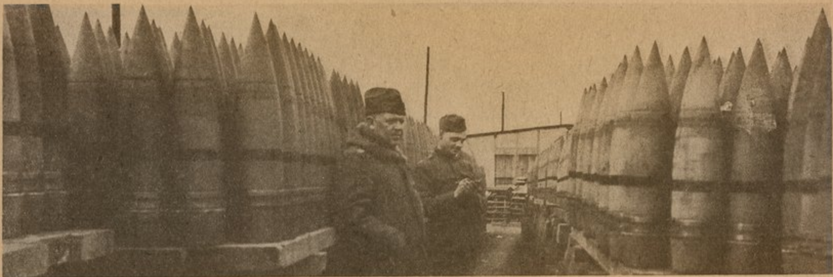
1918-1934 (ABOVE) Classifying ammunition for shipment. (LEFT) A battlefield "over there" where ten million workers and farmers laid down their lives. (RIGHT) A battlefield "over here" in Washington where the Government gave bullets and tear gas to the returned soldiers