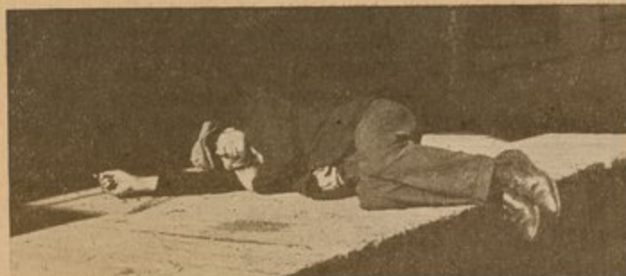
Film and Photo League