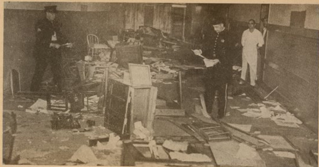
The terror in San Francisco! (ABOVE) The Restraining Order gotten out by the American League Against War and Fascism during the Pacific Coast terror. The Judge denied the order, but the mass meeting was held anyway (see page six) which was the first breach in the anti-assembly drive of the Fascist forces. (LOWER) A worker's hall in San Francisco smashed by the police and hired thugs during the General Strike

men who thought—ah, thought is revolutionary!—that people, even working people had a right to eat and feed their children sufficiently. Perish the un-American thought! Loyalty to the Stars and Stripes means your children must grow up rickety (the fruit packers of California are limiting their peach packs to 40 percent of the crop)—that you must take