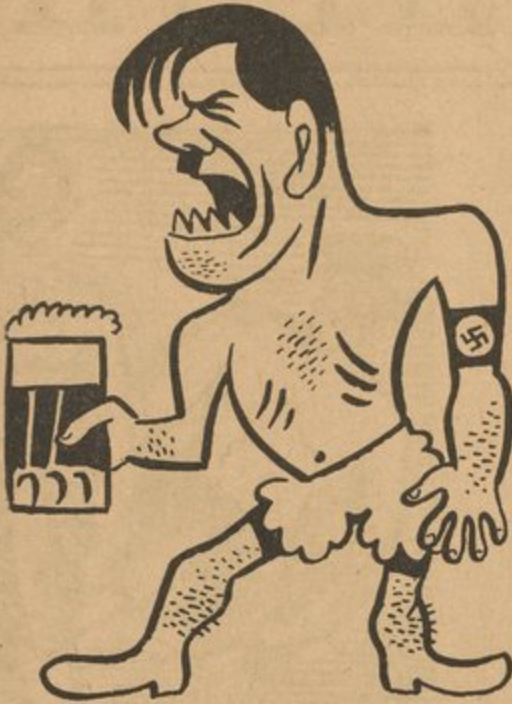
THE BEER PUTSCH