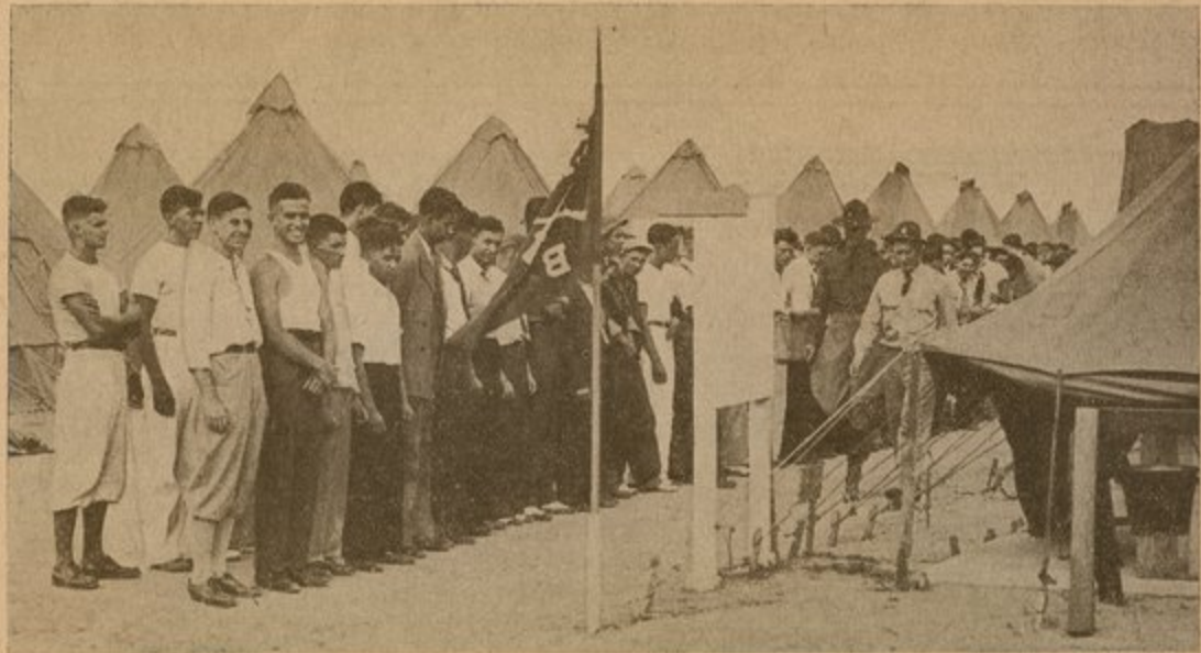
Tens of thousands of young men are being prepared every summer in Civilian Military Training Camps (C. M. T. C.) for imperialist slaughter. (ABOVE) Some of the 500 newly arrived boys at Camp Dix, N. J., receiving military training

BERLIN.—According to a statement issued by the State Statistical Office, German economy is in debt for credits to the amount of 85 milliard marks. Of this 19 percent are foreign debts, more than one third short term. This means that within a short time several milliards must be repaid to foreign countries. Since it may be assumed that after the breach of the obligation in the matter of the Young and the Dawes loans, the foreign creditors will be little inclined to accommodate the Hitler Government, the foreign economic debts represent a further serious danger for the German currency.