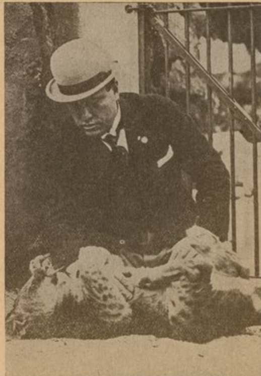
The He-Man of Italy (derby and all) "playing" with a lion. Premier Mussolini

Is not our place, rather, on the side of those who have decided beforehand to make every