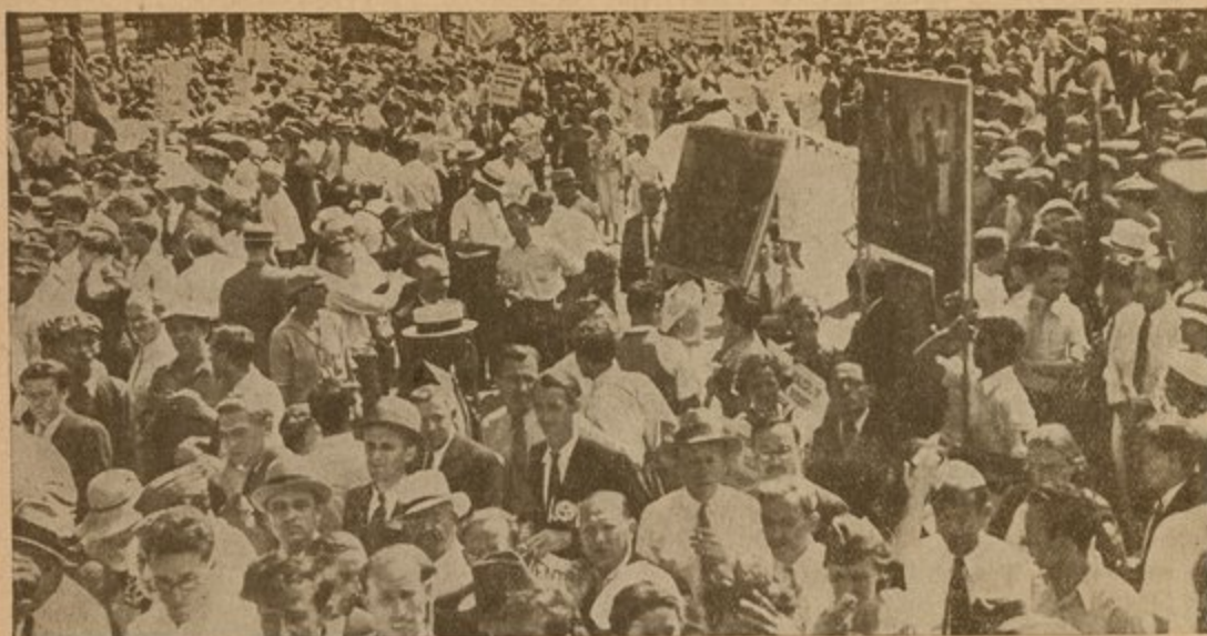
Demonstrating against imperialist War on 20th Anniversary of the World War. (RIGHT) The Nurses and Hospital Workers League carrying the huge banner of the American League Against War and Fascism under whose auspices the United Front demonstration was organized. (ABOVE) Part of the 50,000 demonstrators in Madison Square, N. Y. C.