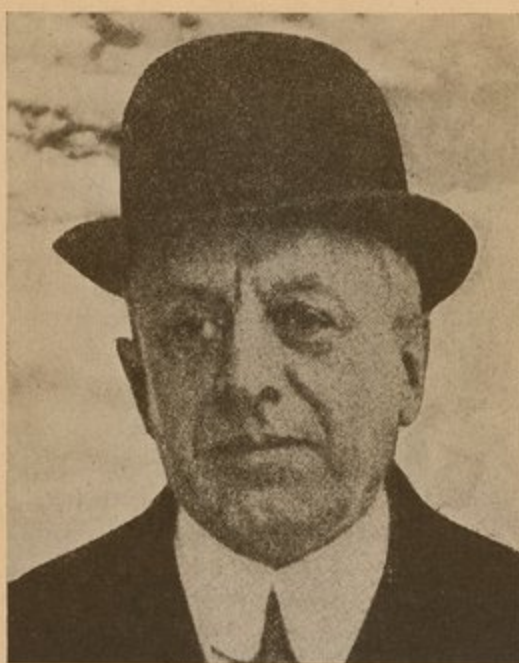
The man behind Hitler and the real ruler of Germany: Fritz Thyssen, head of the most powerful concern in Germany—The United Steel Works

The young Emilio Sereni who was sentenced in Italy, in 1931, to 15 years in prison for his anti-Fascist activities, was recently offered his freedom on condition that he write a letter of "apology" to Mussolini. He declared that he "was not afraid of prison life, and that if Fascism awaited from him a sign of repentance, it would have to wait forever."