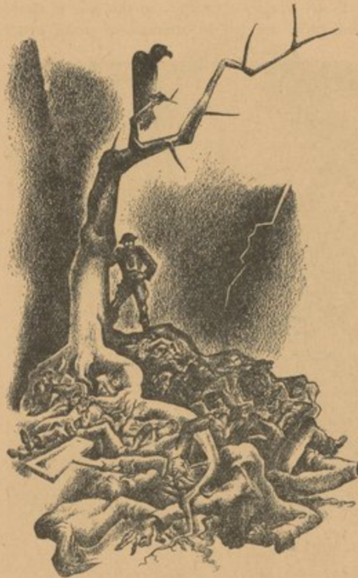
Drawing by Lynd Ward

Another set of pitfalls that threatened the first Congress, was the questions arising around the program. There was the danger of