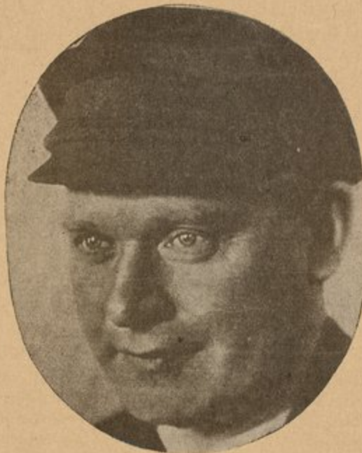
Framed for his anti-Nazi activities; about to go on trial for his life in a Hitler court

Imprisoned by Hitler when Nazis took power in 1933.