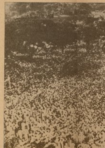
100,000 Natives in Manila demonstrating against American Imperialism

his people before him had lived in that same area for ages. Hence my conviction that these Moros were morally in the right.