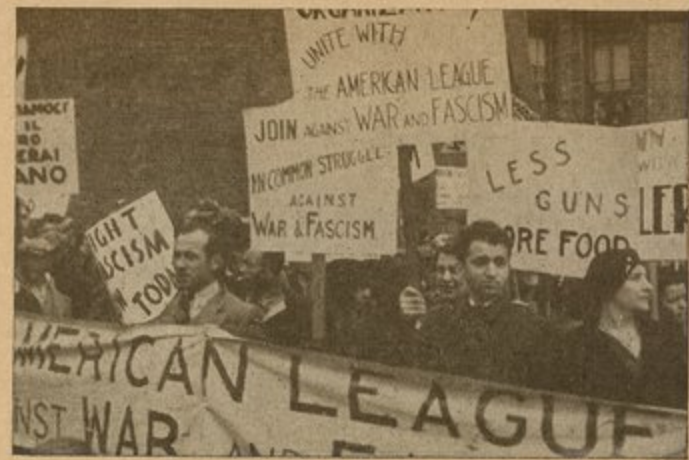
(RIGHT) An anti-Fascist Demonstration held in the same City under the Auspices of the American League Against War and Fascism