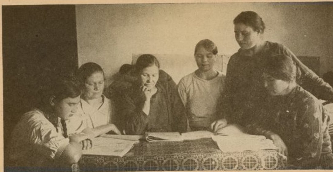
While the Capitalist World is closing schools because of the Economic Crisis, Soviet Russia, under a Socialist Economy, is opening new ones. (ABOVE) Peasant Women of the Ukraine in a class of World Events