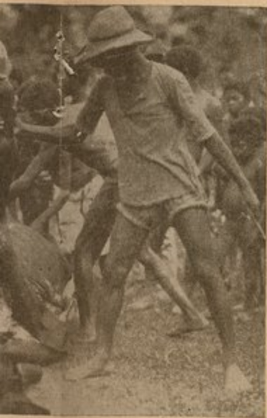
Starving Filipinos carving up a Horse for a Meal