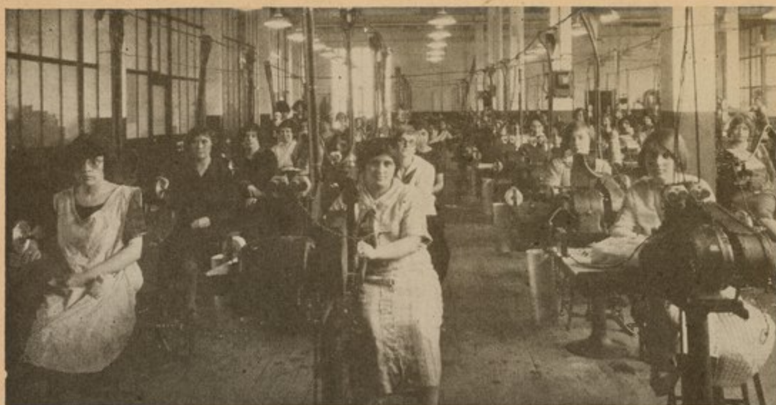
Women Workers are now electing their Delegates to the Women's International Congress Against War and Fascism meeting this month in Paris. (ABOVE) Interior view of the Coil Winding Division—Mica Department of the General Electric

pointed by the government. And no woman of any prominence or intelligence belongs to it.