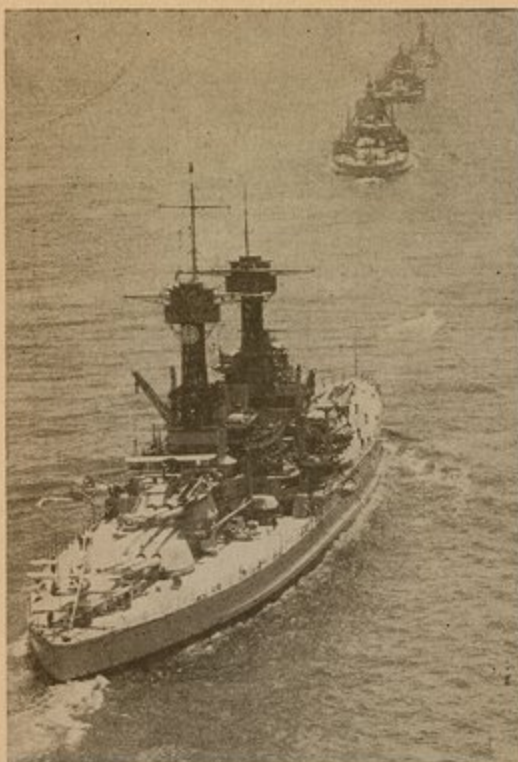
Ninety Five Battleships proceeding in the direction of Ambrose Lightship where they were Reviewed by President Roosevelt in the greatest Naval display in the history of the U. S. A.

Characteristically such talk transcends race and religions, and even national lines. It forges a unity of all the oppressed. Misery recognizes comradeship. Men no longer speak or think in terms of Negro, white, Jew, Gentile, Frenchman, American, foreigner. They