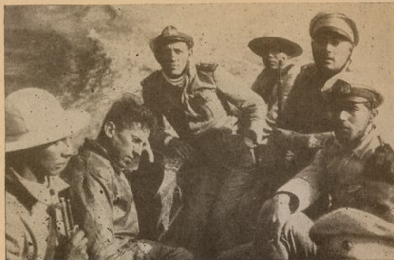
Bolivian Aviators, captured by Paraguayans in the Chaco War

Thus the United States was able to display "her desire for peace" to the rest of the world at the Geneva Disarmament Conference on May 30, by flaunting her own kind of arms embargo in the face of the equally impotent embargo of the League of Nations, now in a deadlocked conference.