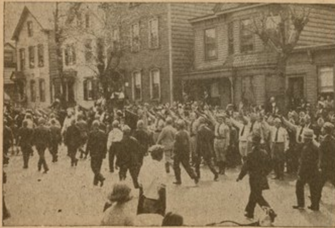
(LEFT) A Fascist Parade in Newark, N. J.