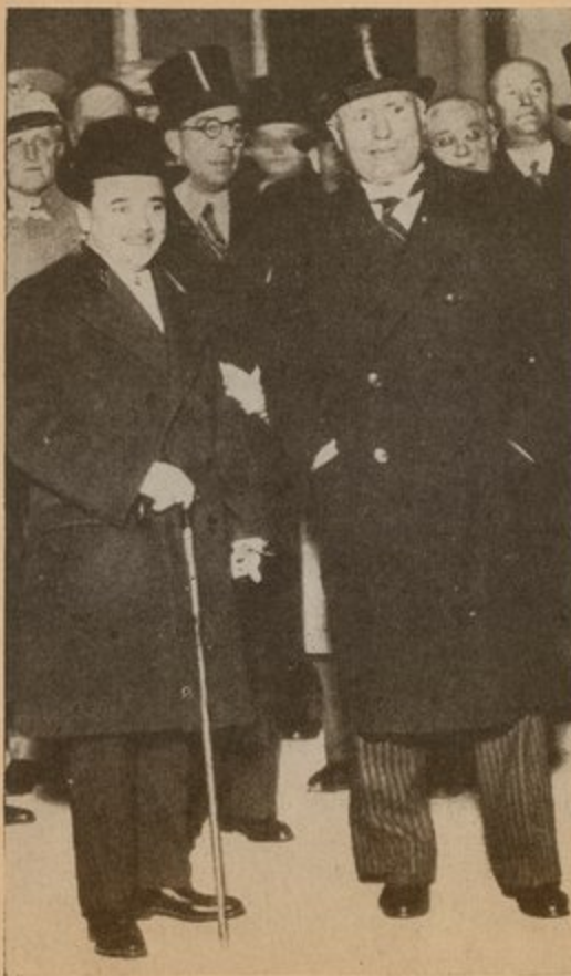
Two Fascists meet—And a Deal is made against the Workers and Farmers! (LEFT) Chancellor Dollfuss of Austria. (RIGHT) Premier Mussolini of Italy