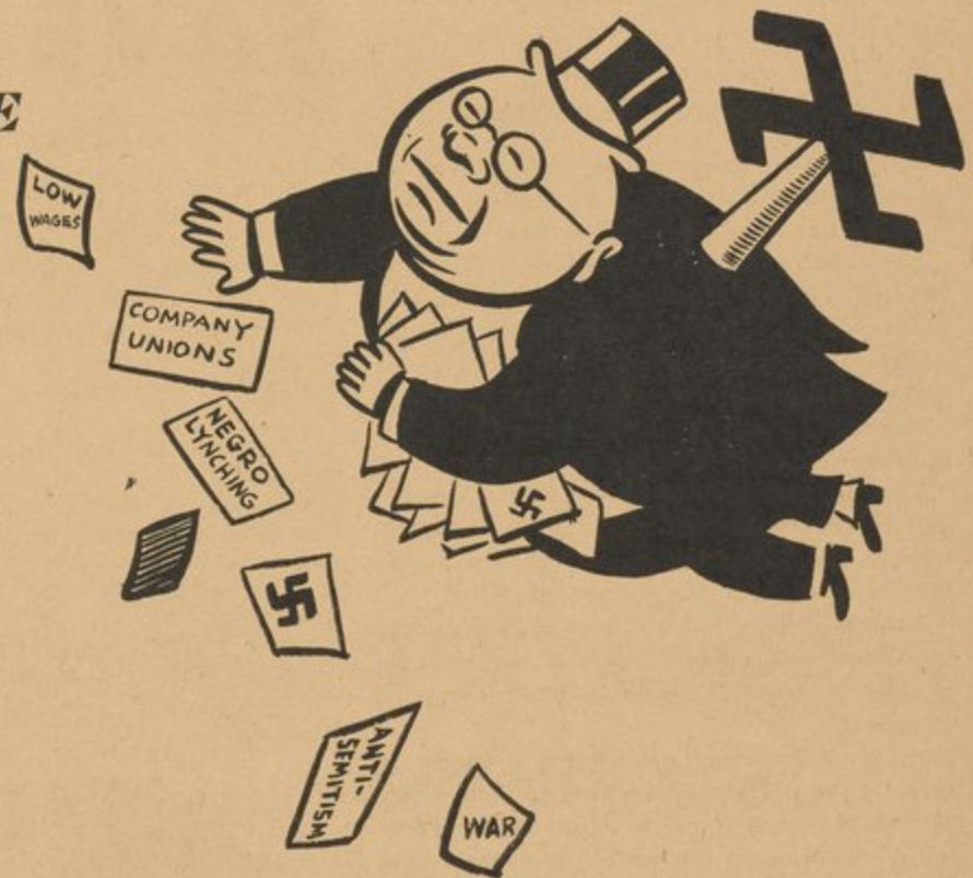
Drawing by Wm. Gropper

retired owner lives in terror for fear the renters will vote in a "consolidated school" with bus and driver—which means a sharp rise in taxes. Stronger fears quake the small town when the renter-farmer is organized into a Non-Partisan League whose socialistic ideas are murder to the railroad superintendent, the store-owner, the banker, and his utility. Whenever the renter raises his head the small-town storm troopers are ready to strike it down with Fascist weapons.