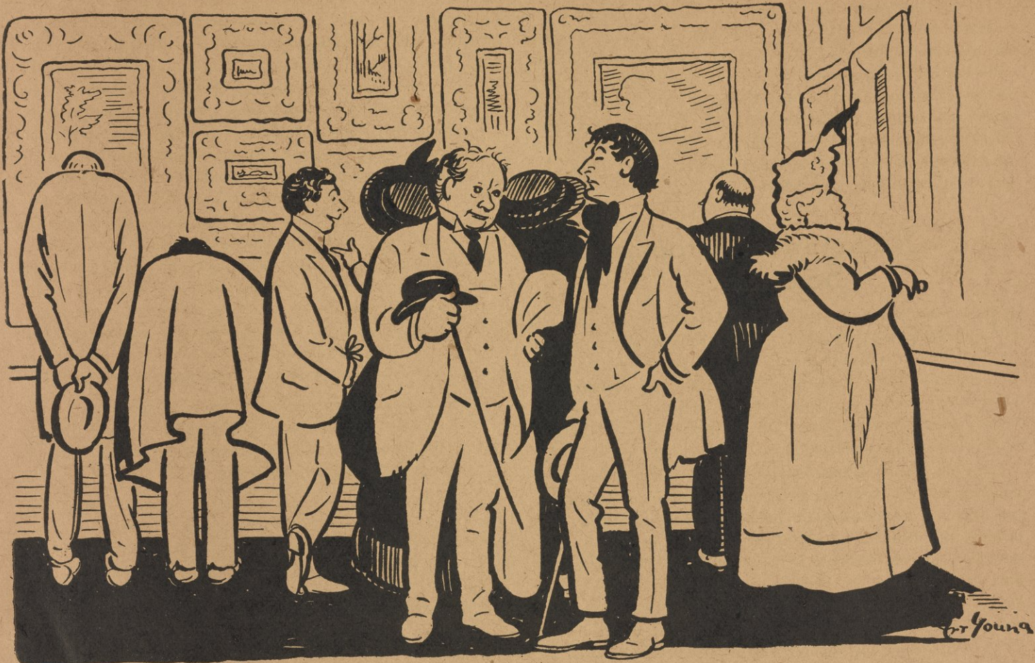
Drawn by Arthur Young.

The Rising Young Artist: "All that I have accomplished in art I owe to the struggle for the necessities of life." The Cartoonist: "That's the way to look at it,—if the cost of living goes high enough, you'll be greater than Michael Angelo."