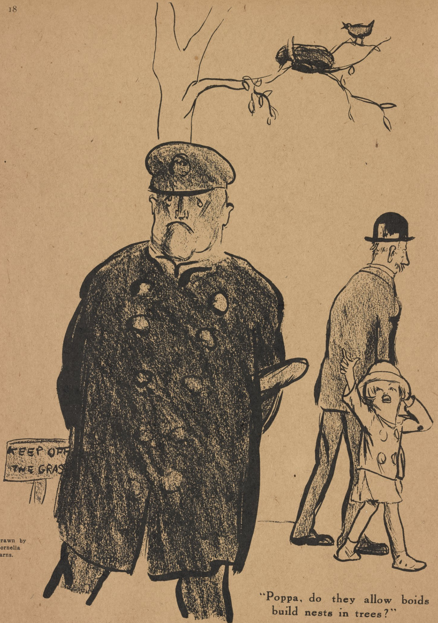
Drawn by Cornelia Barns.

"Poppa, do they allow boids to build nests in trees?"