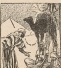
XIX Century Arabian Food

Half Dollar the Half Pound. For Booklet and samples of "LES FRUITS" write ARABIAN FRUITS CO., Dept. X, 1170 Broadway, N. Y.