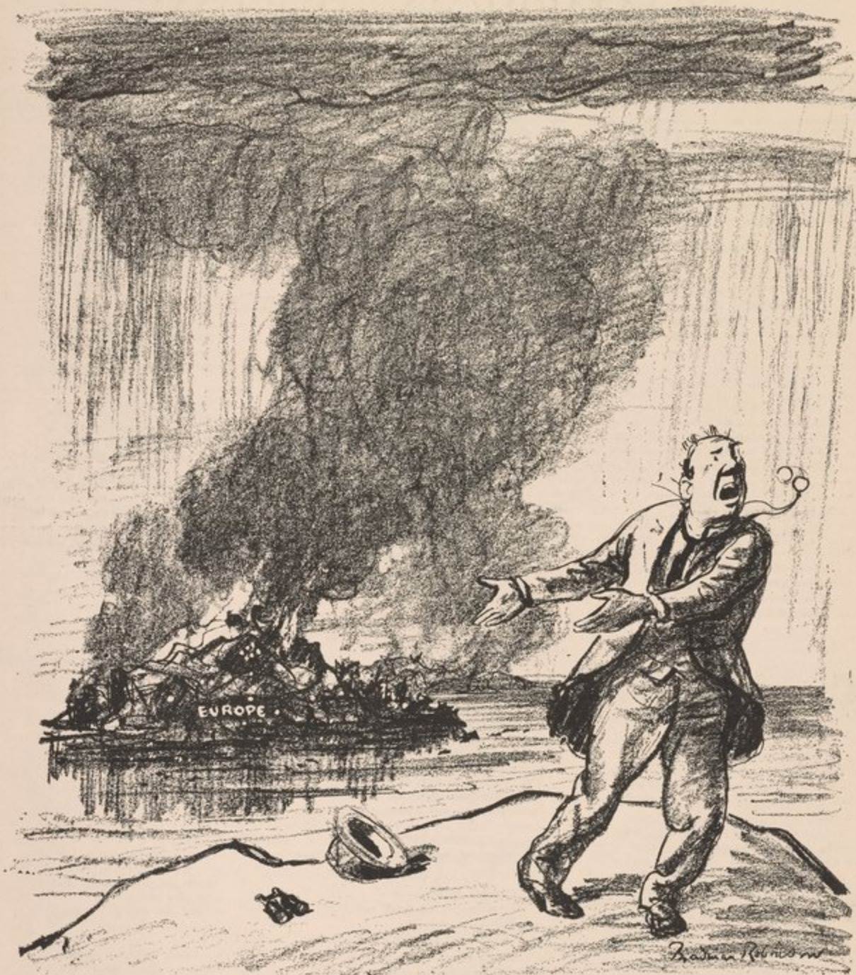
Drawn by Boardman Robinson.