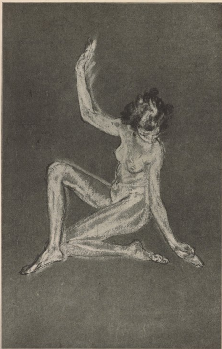
A DESIGN BY ARTHUR B. DAVIES