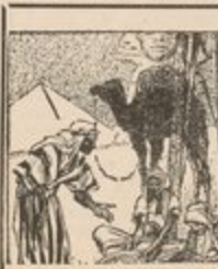
XIII Century Arabian Food

I should like to see the New Review kept alive, for it is valuable. But I want more to see the MASSES saved from death. Must one pull a long face and spout polysyllables to be esteemed thoughtful? Must one keep one's left and right hands in ignorance of each other in this fashion? I doubt whether it is so necessary.