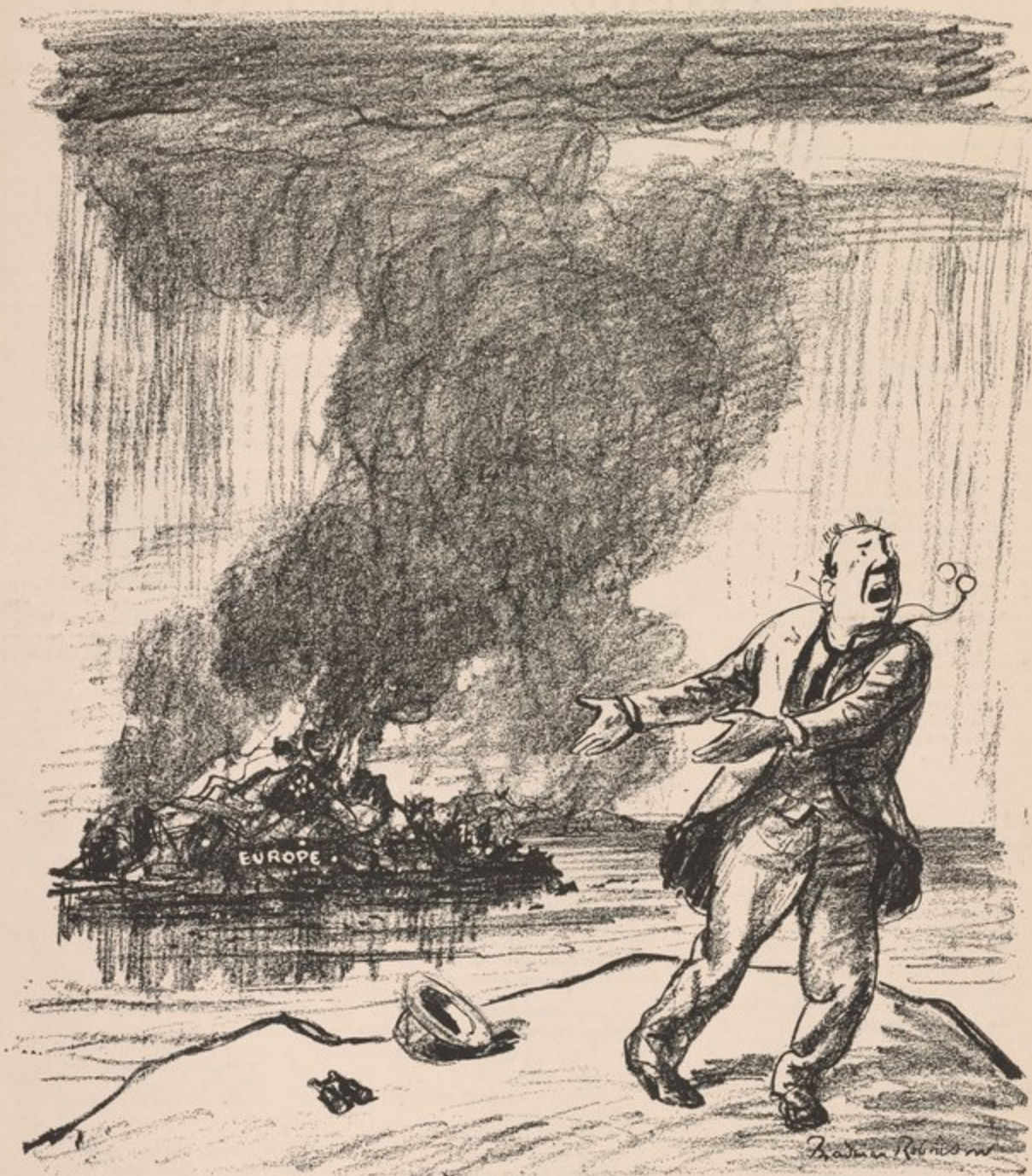
Drawn by Boardman Robinson.