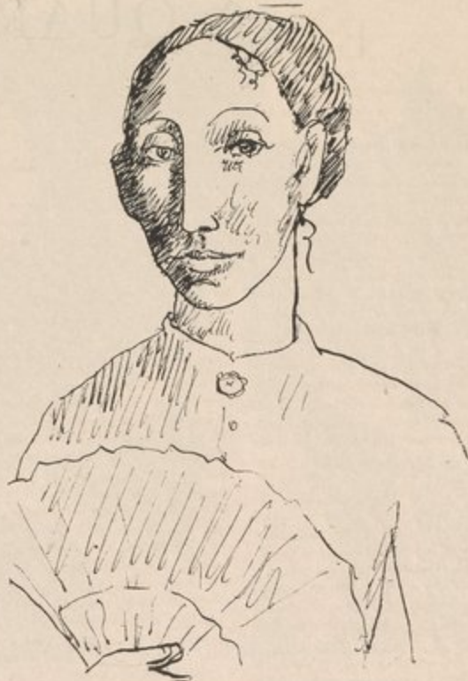
A PORTRAIT BY PABLO PICASSO

(Long before this the audience has taken its departure. The masque may therefore be brought to a close.)