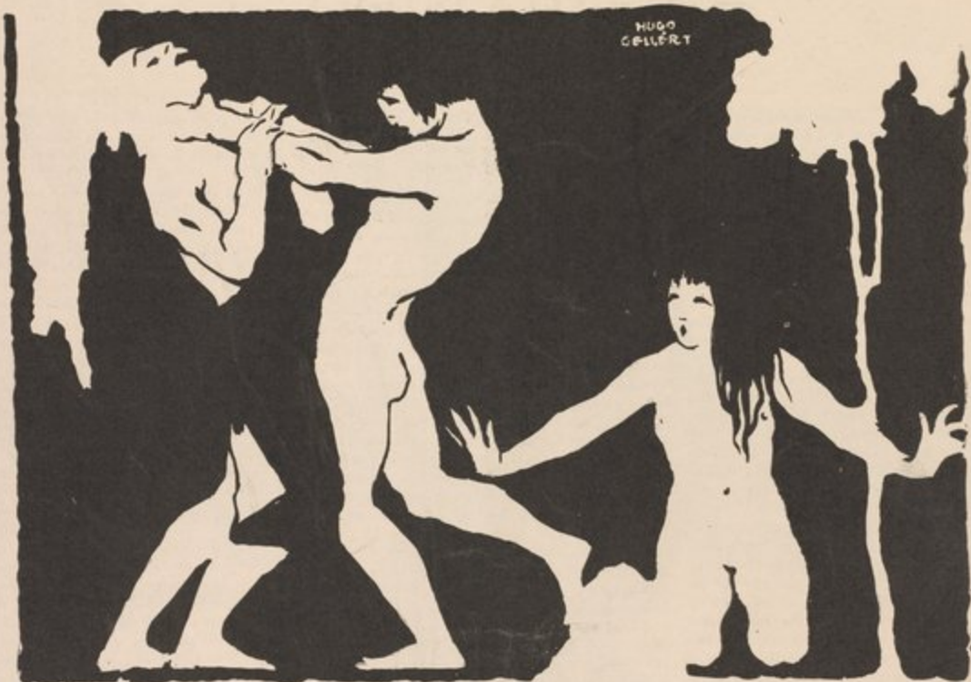
A DESIGN BY HUGO GELLERT

less weight than the air she breathed. Their communication was magical. He sensed her strength as she sat there dead to him—sapping the strength in him, deadly in her desire to mutilate and overcome him.