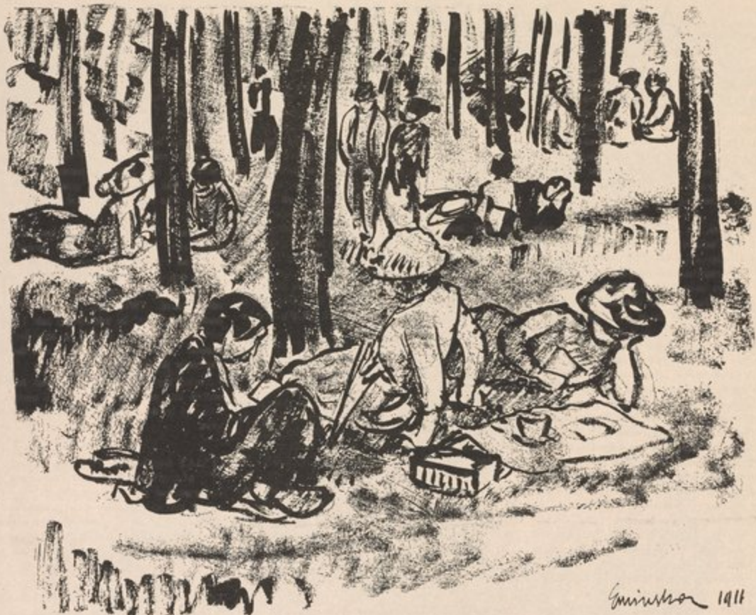
Drawn by E. Omlaska.