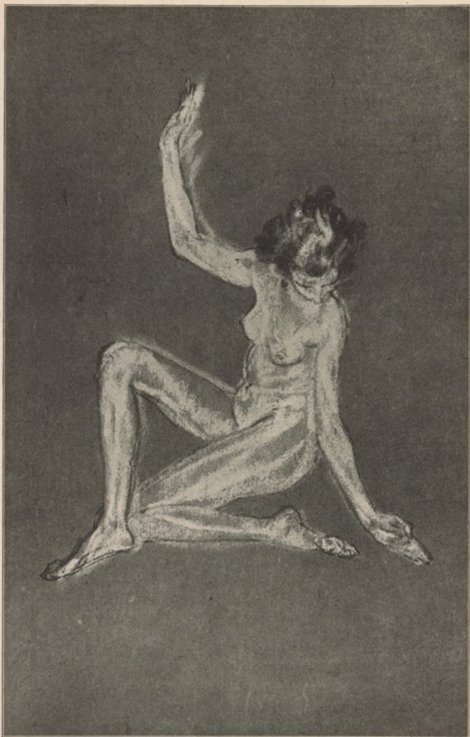
A DESIGN BY ARTHUR B. DAVIES