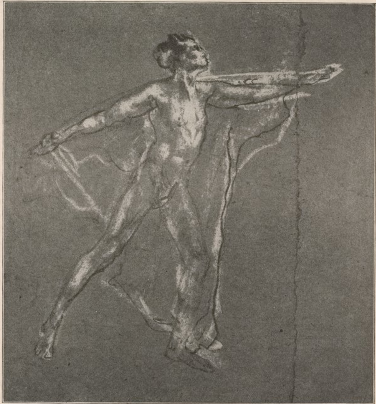
Drawn by Arthur B. Davies.