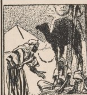
XIIIth Century Arabian Food

Extensively reviewed by the Managing Editor in the July Masses.