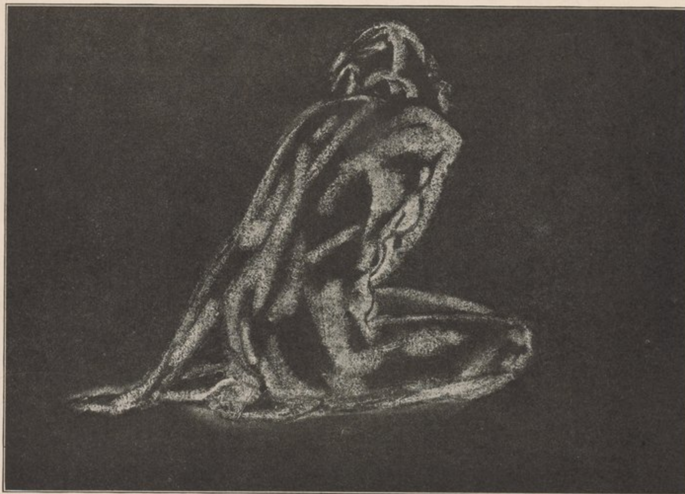
Design by Arthur B. Davies.