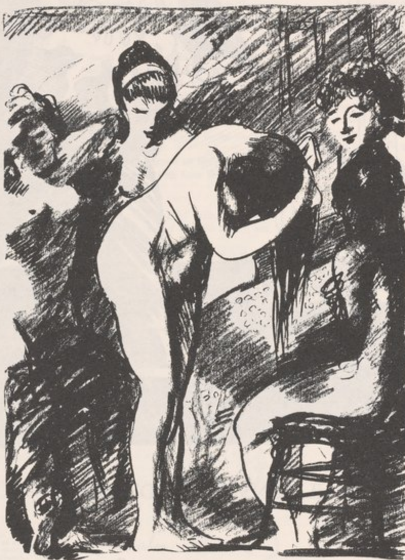
DRAWING BY GEORGE BELLOWES