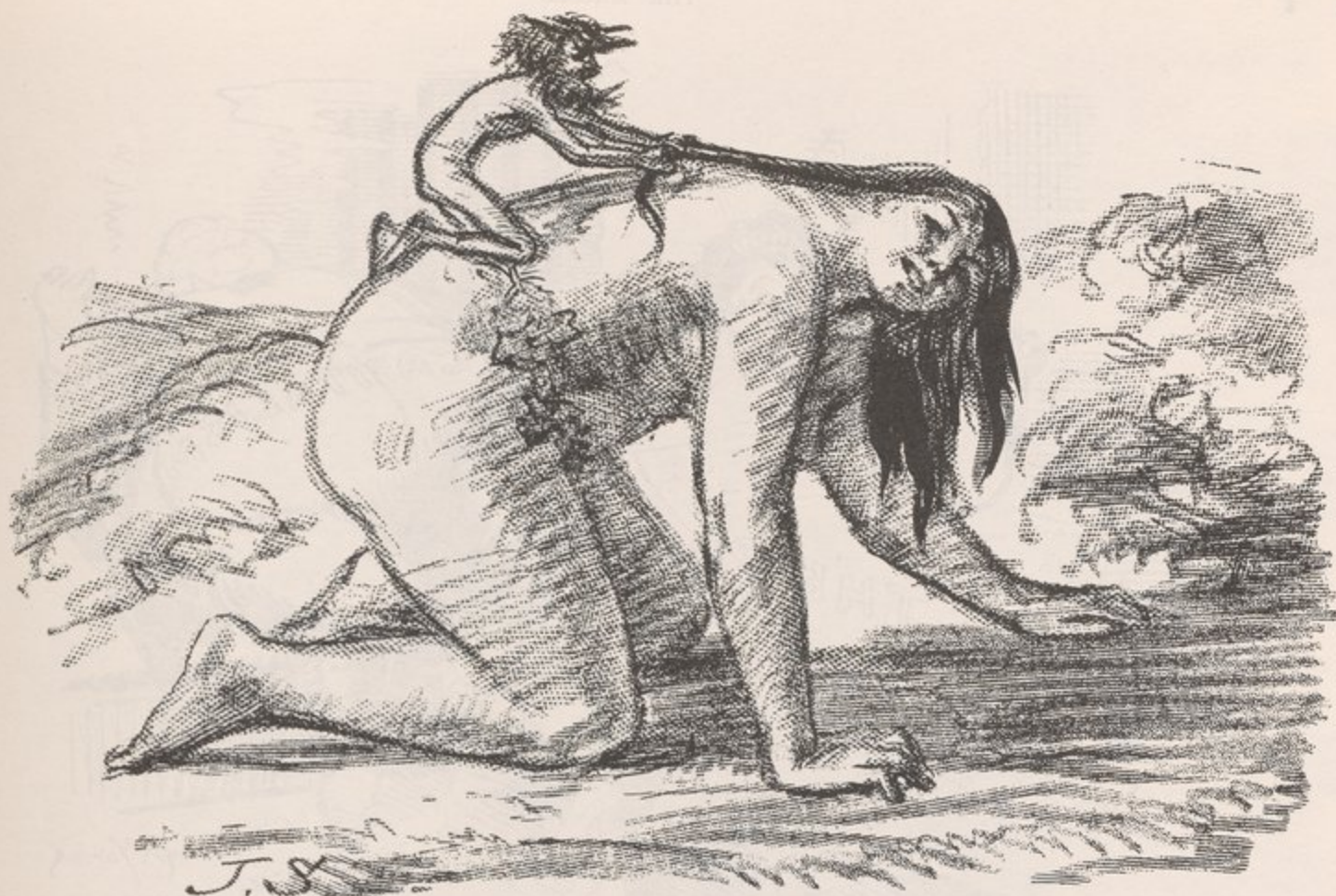
Drawn by John Sloan.