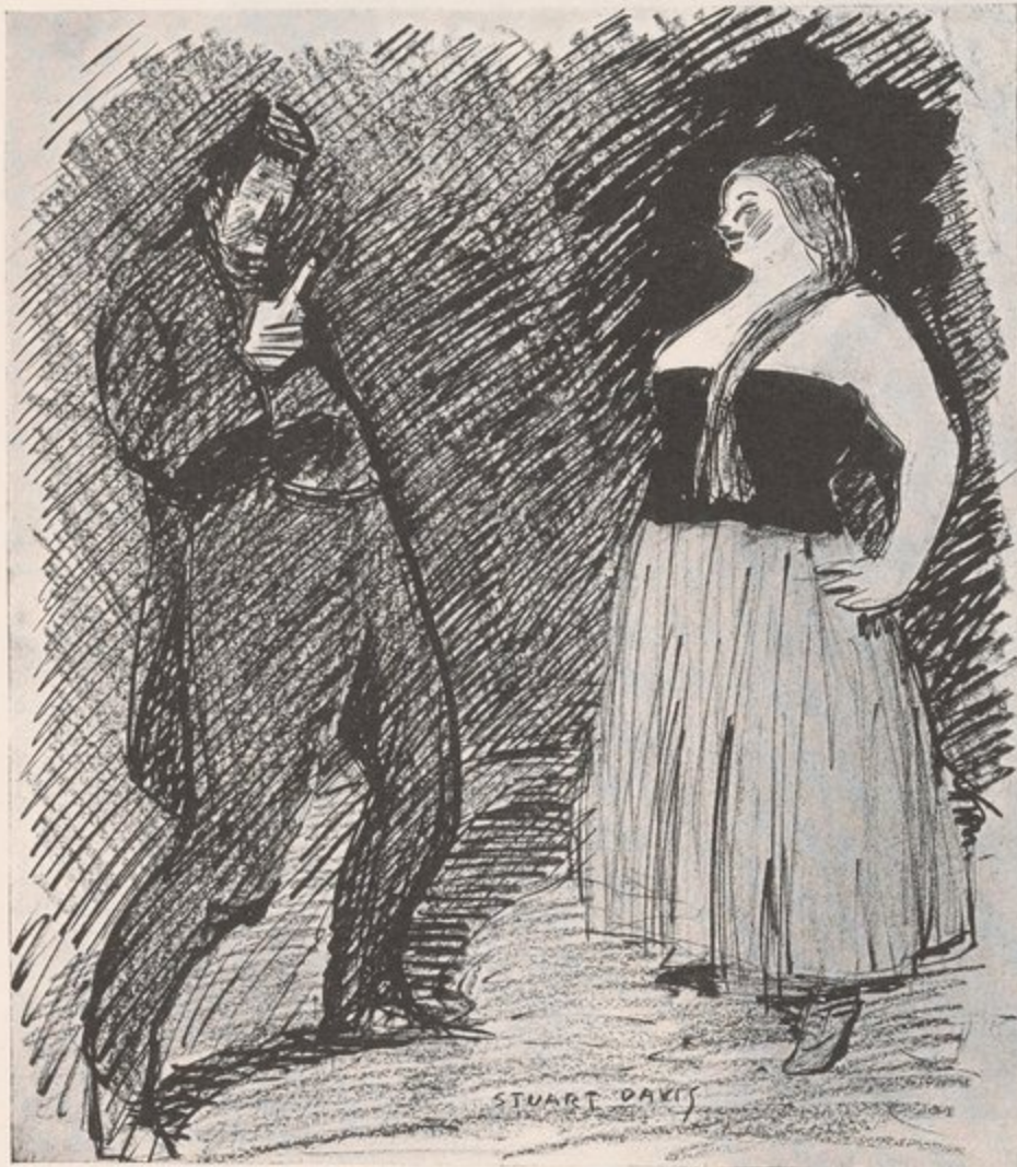
Drawn by Stuart Davis.

Genially, casually, the tall man kicks him in the face whenever he notices him. The tall man has taken