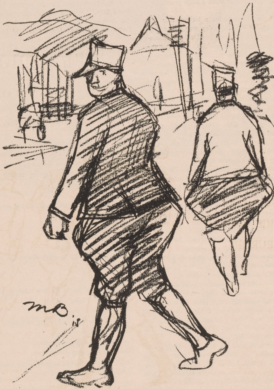
The Eternal Masculine

A year ago all these Parisians would have said they loved France—just as you or I or the corner grocer would say we love America. As far as one could see they loved their country somewhere round ten dollars' worth. And now—after about a year—getting oneself blows to bits for La Patrie is a commonplace. They