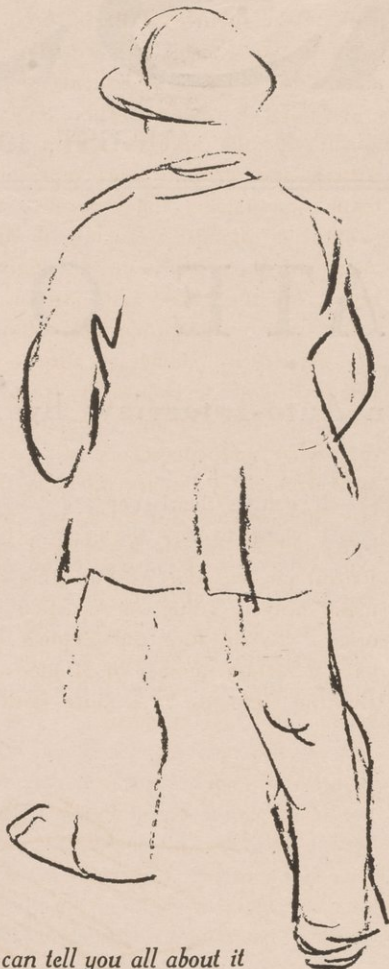
He can tell you all about it