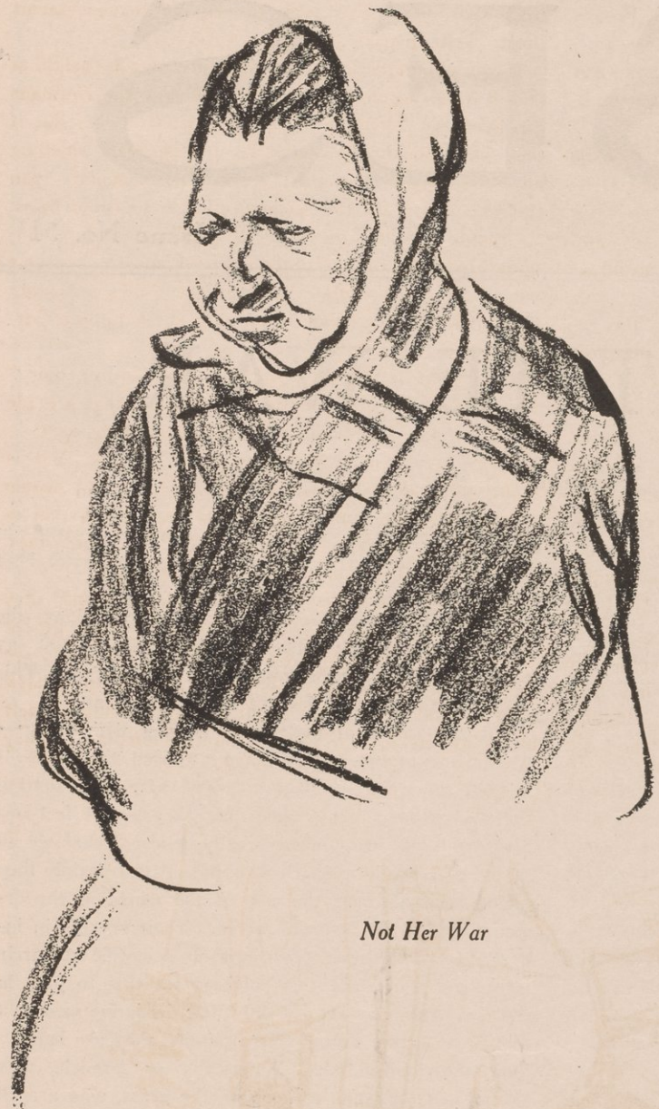
Not Her War