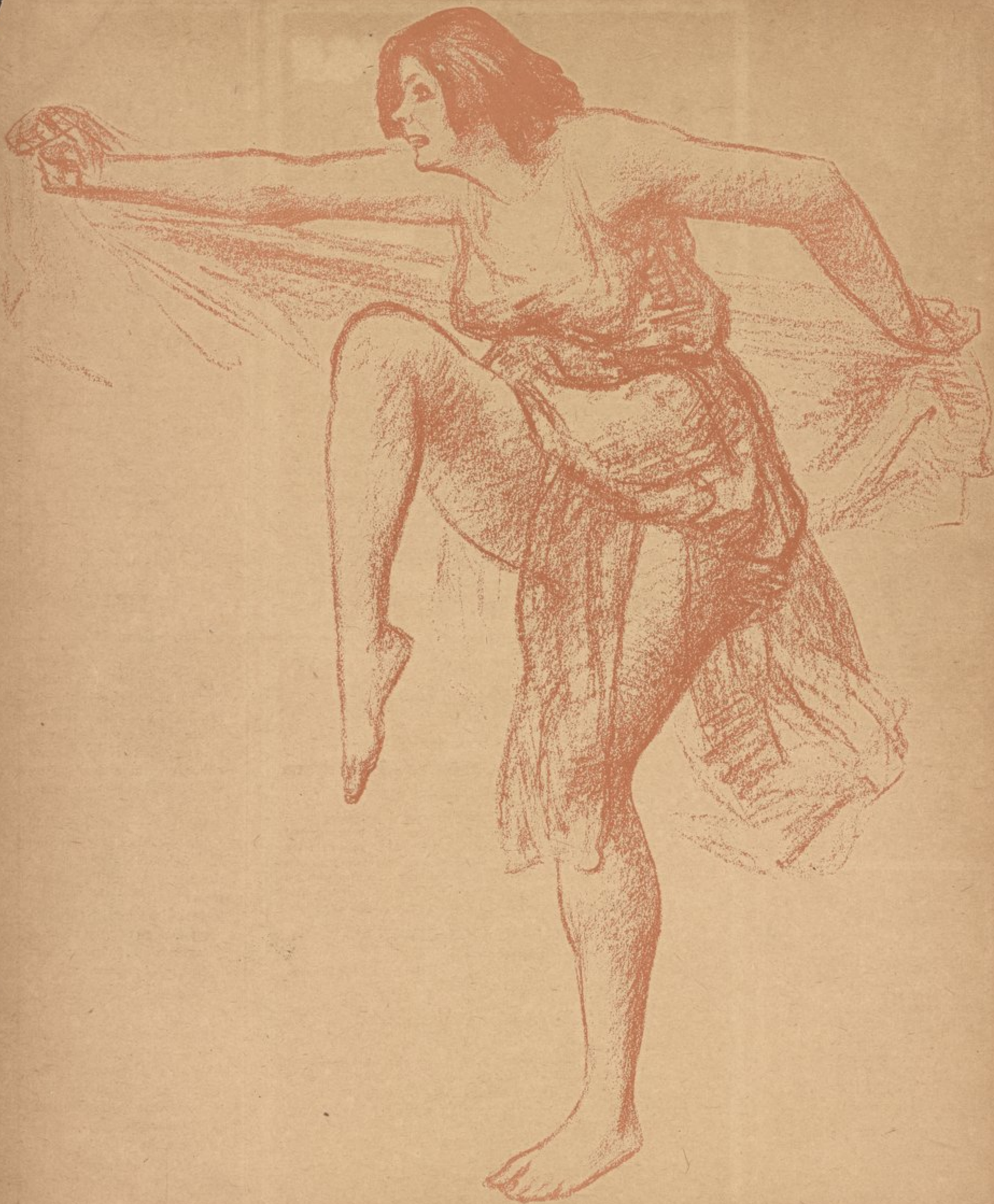
ISADORA DUNCAN IN THE "MARCHE MILITAIRE"