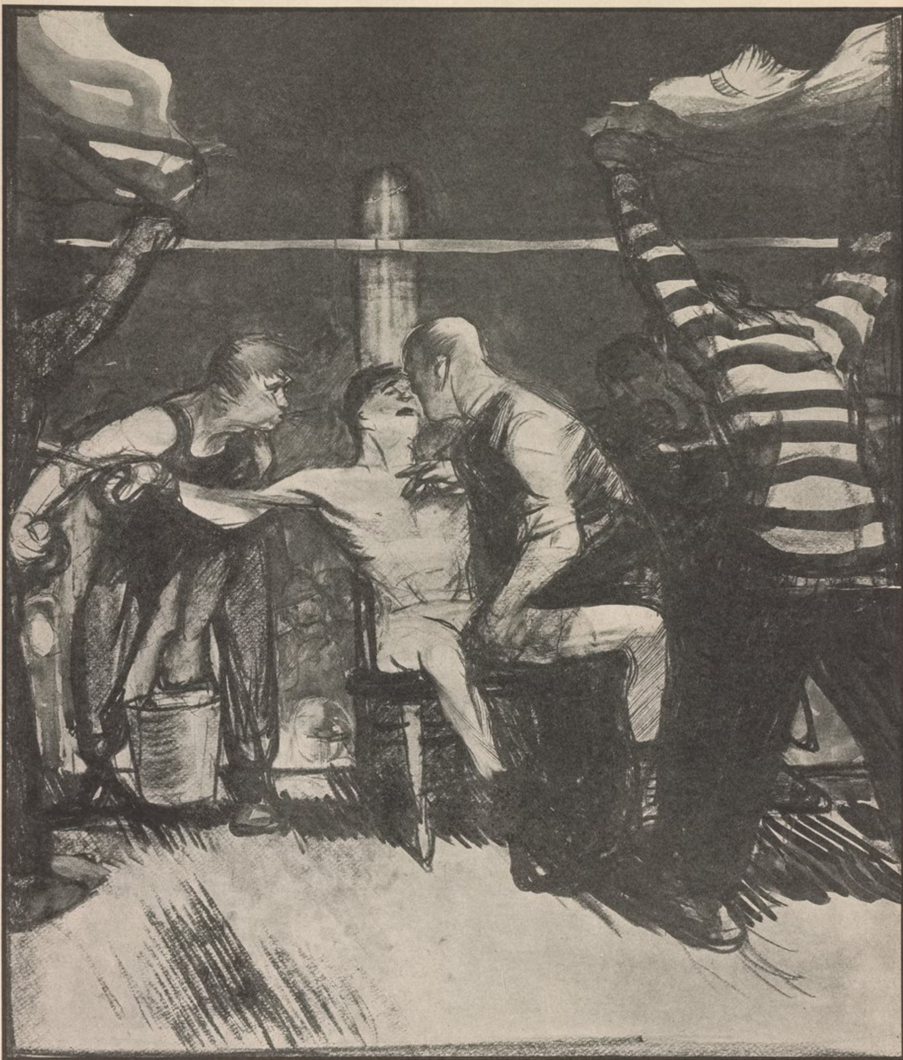
Drawn by George Bellows.