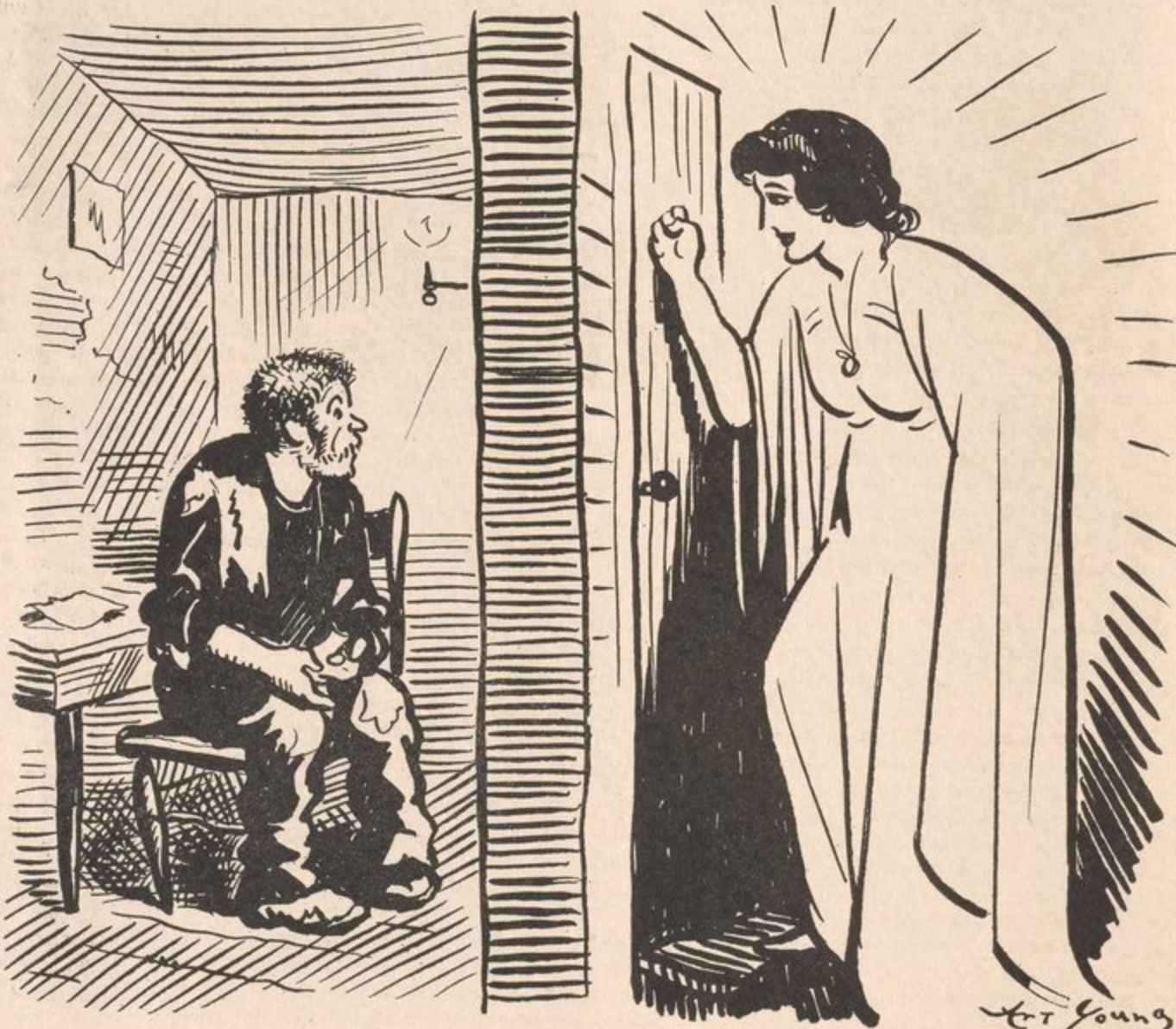
Drawn by Arthur Young.

I must add, for my fellows in ignorance, that I looked up concionary , and it means "preachy."