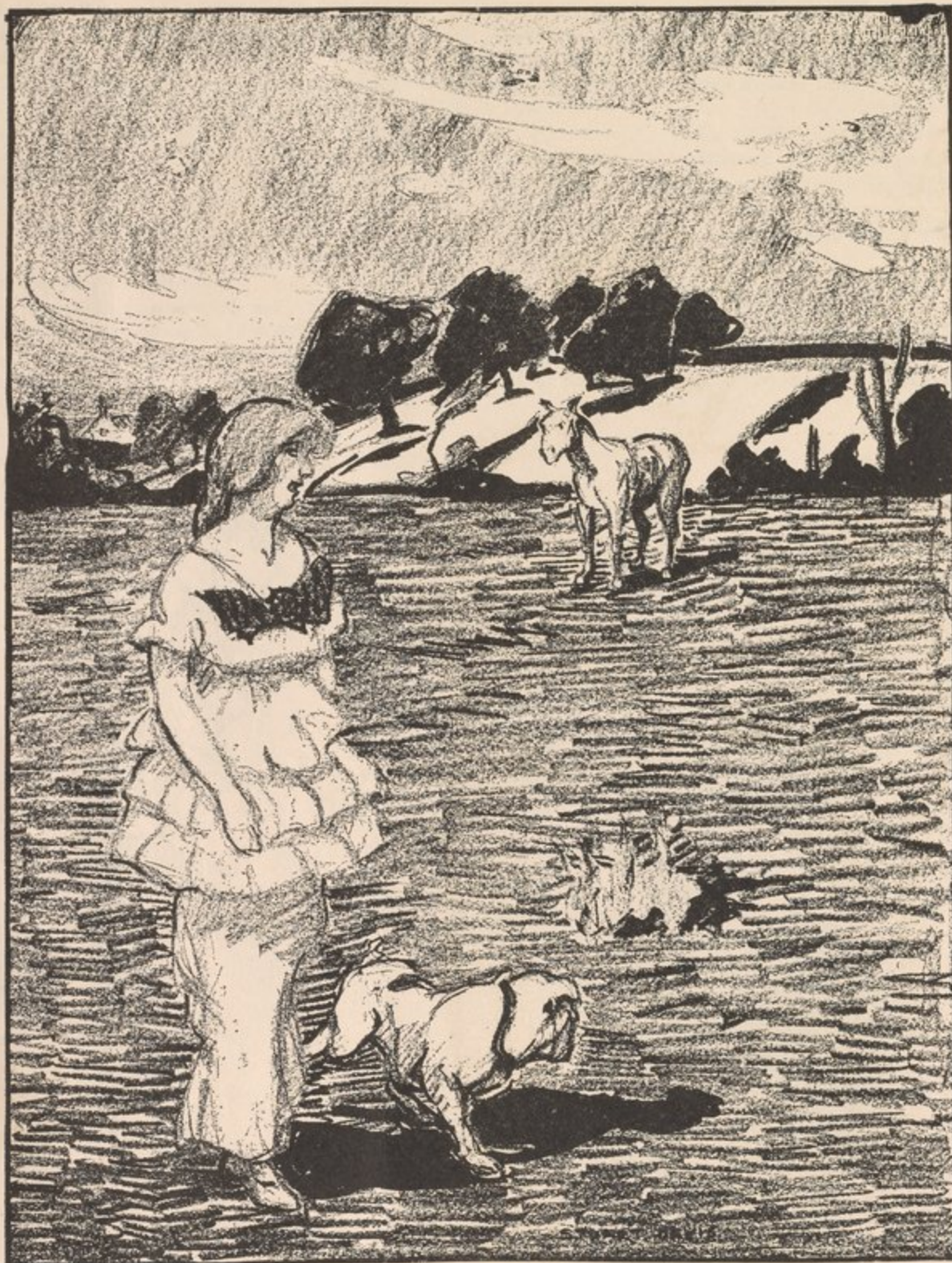
Drawn by Stuart Davis.