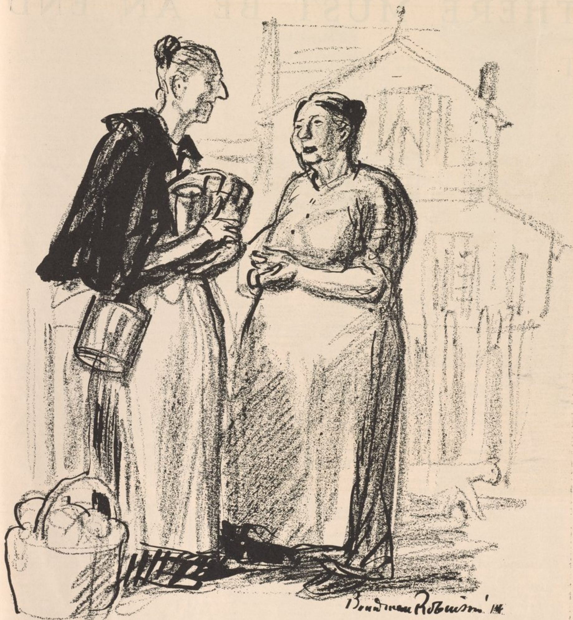
Drawn by Boardman Robinson.

"What's the celebration about, M's Milligan?"