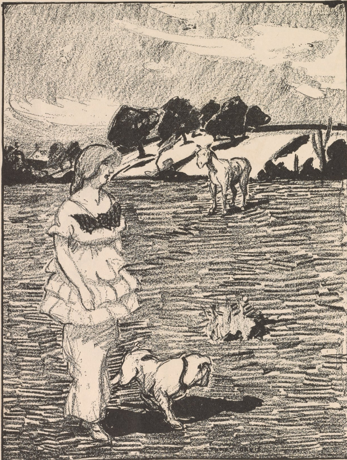
Drawn by Stuart Davis.