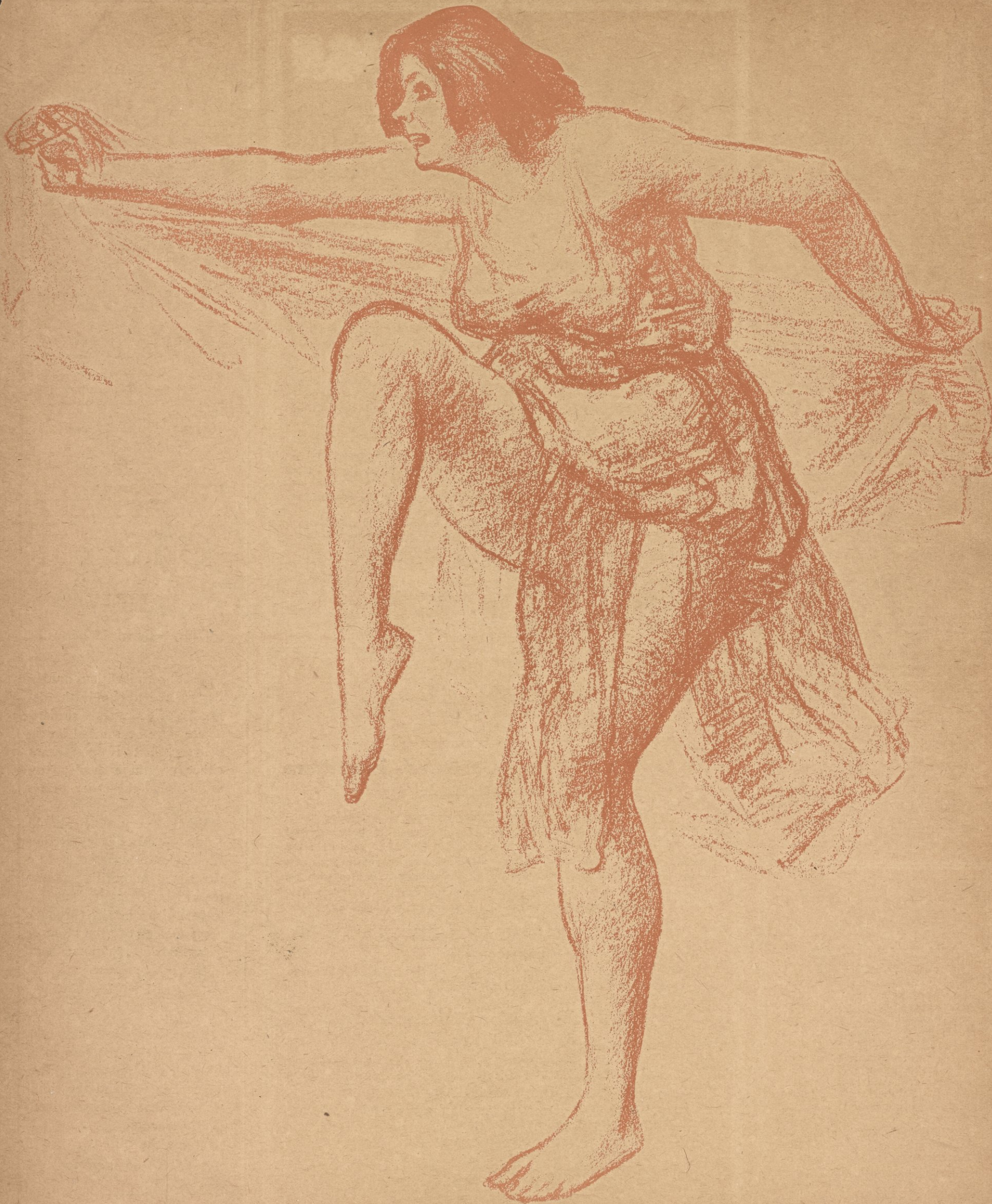
ISADORA DUNCAN IN THE "MARCHE MILITAIRE"