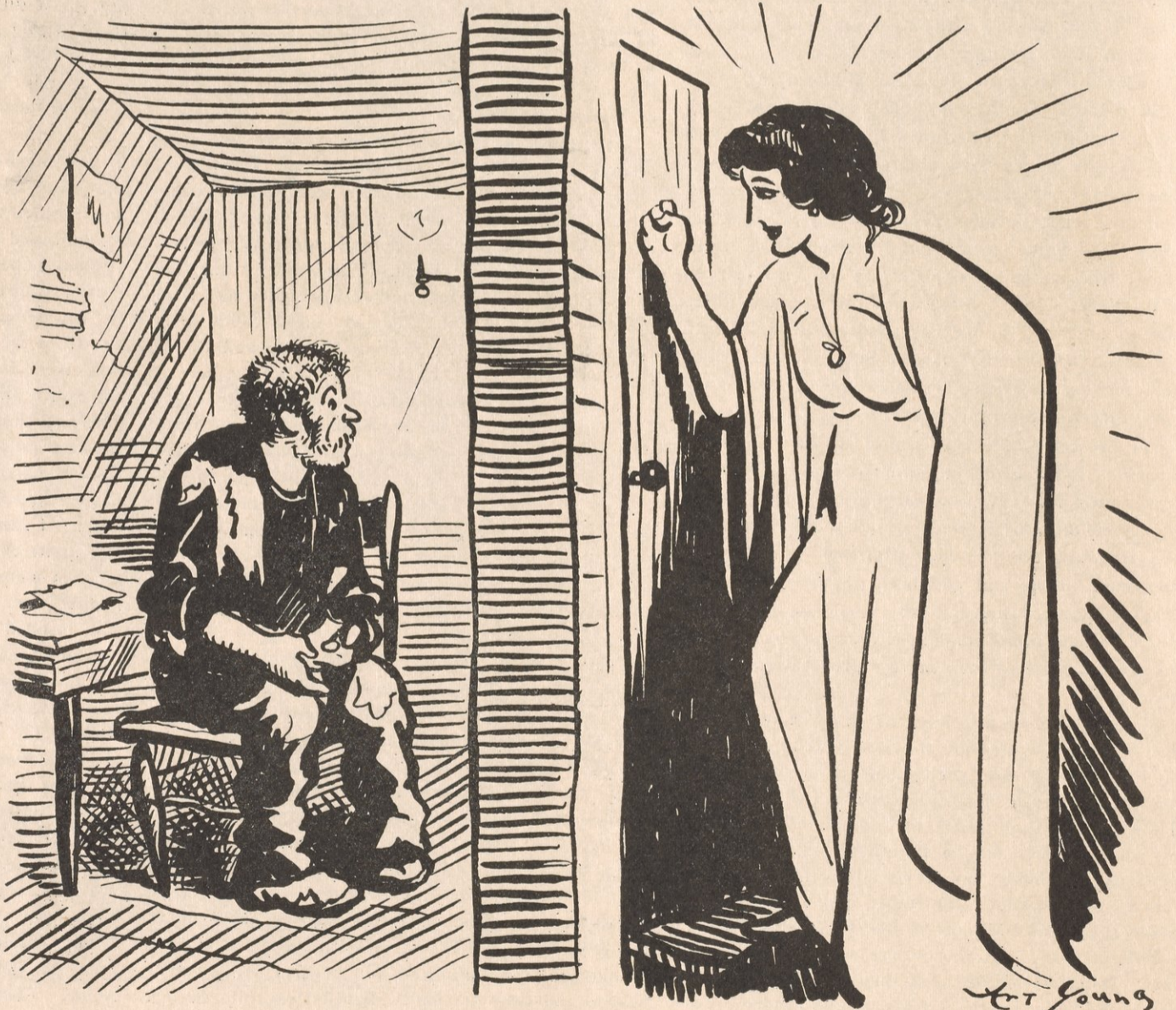
Drawn by Arthur Young.

I must add, for my fellows in ignorance, that I looked up concionary , and it means "preachy."