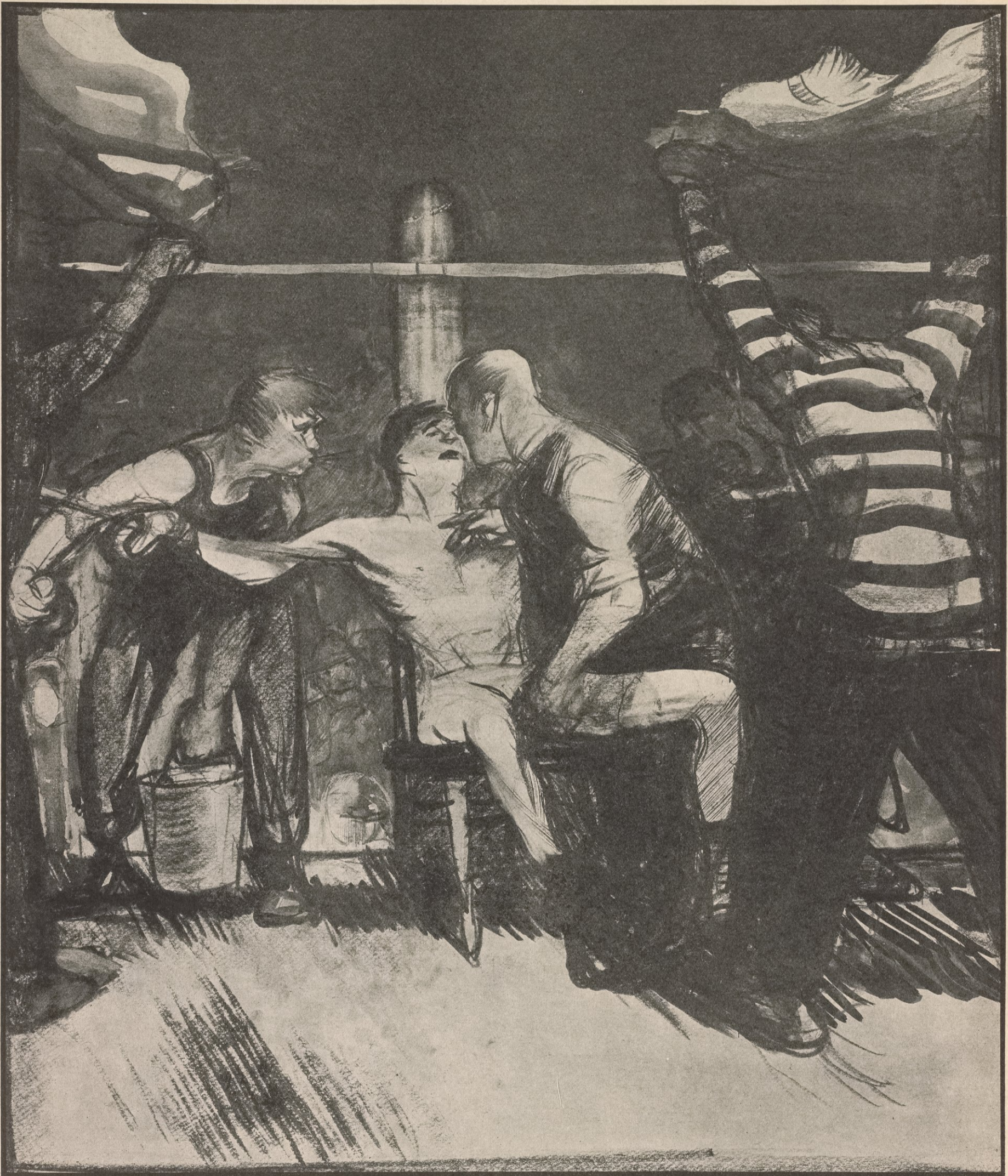
Drawn by George Bellows.