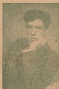
GUTIERREZ DE LARA

The story of the peons' struggle for land and liberty as told by a native Mexican