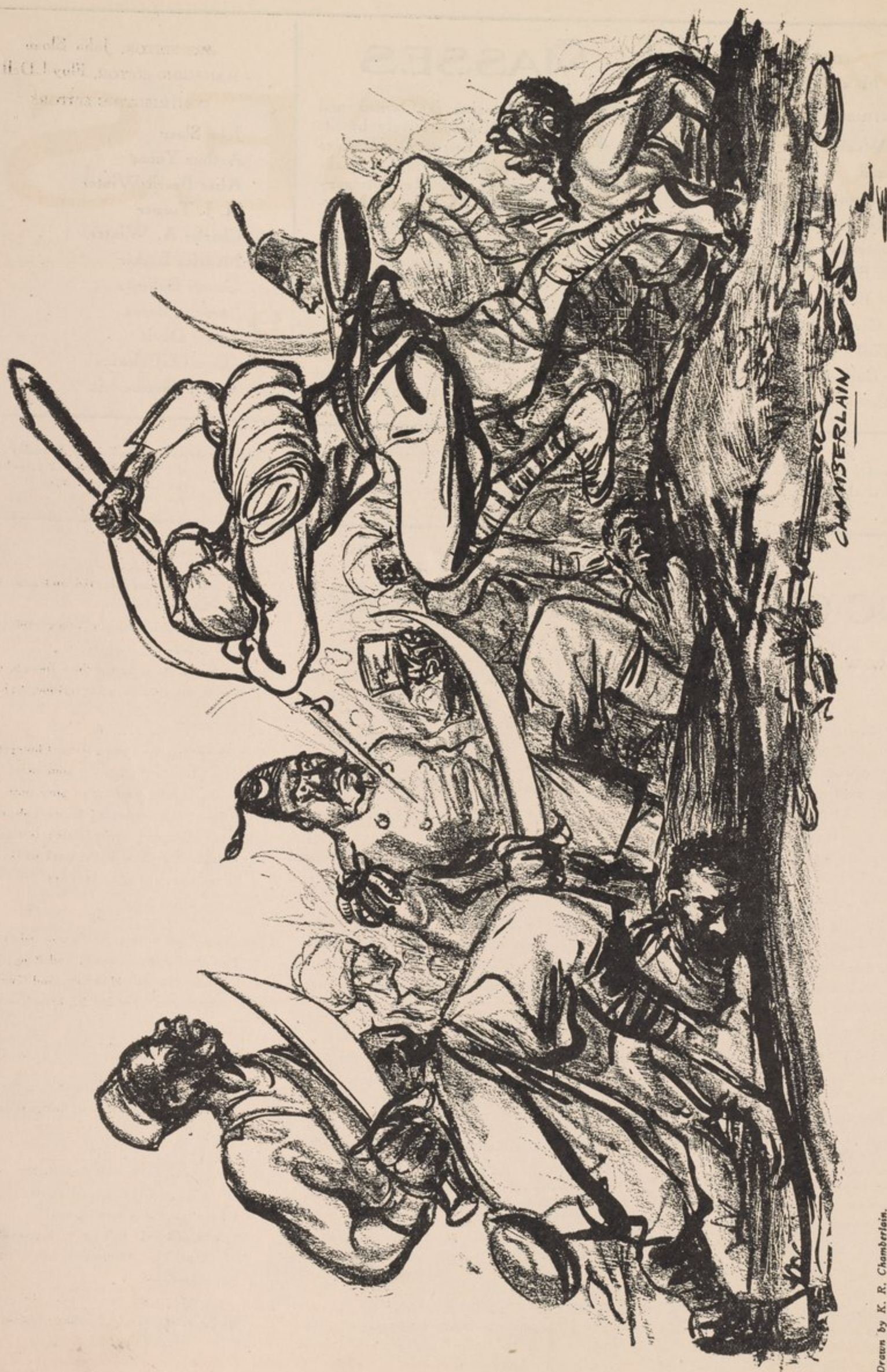
"Teuton Against Slav"