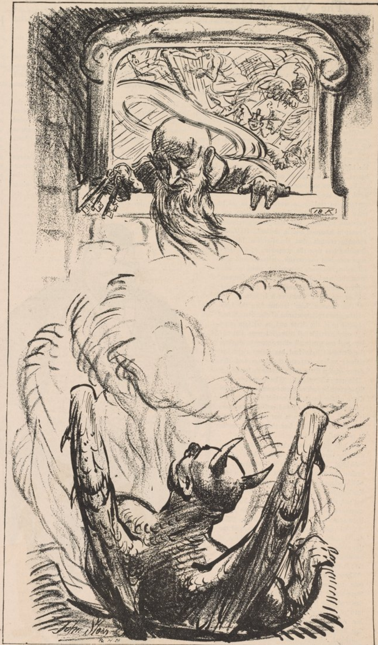
Drawn by John Sloan.