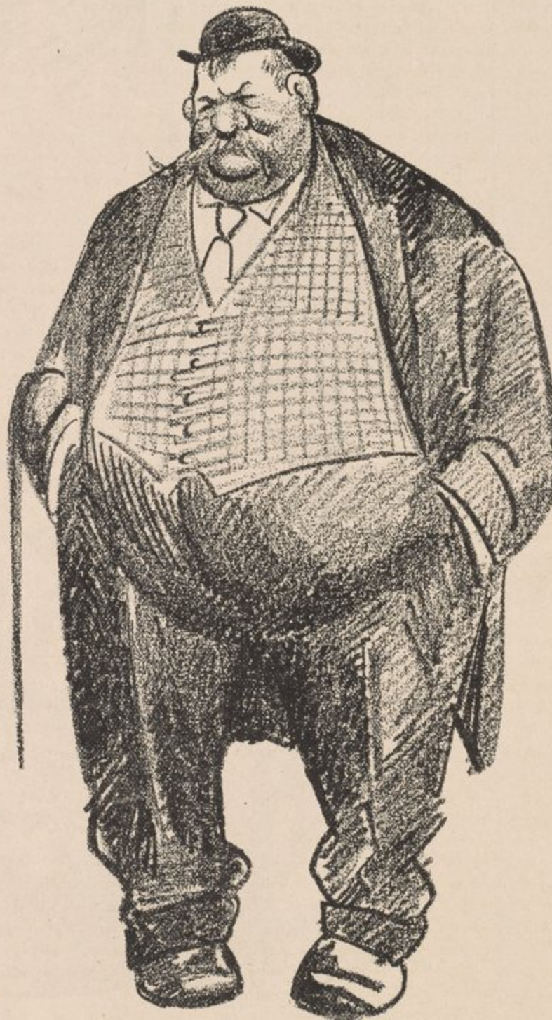
Drawn by Arthur Young.

To him it is like the struggle between the Athens of free men and Sparta with its rigorous militarism, subduing all things to the service of the State. His sympathies as a civilized man and a lover of beauty and freedom are with the modern exponents of the Idea of Pericles (cf. the "Funeral Oration").