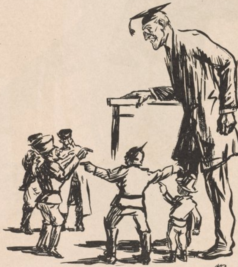
Drawn by Maurice Becker

This should be borne in mind in reading tales of the barbarous atrocity of soldiers, now on one side and now on the other.