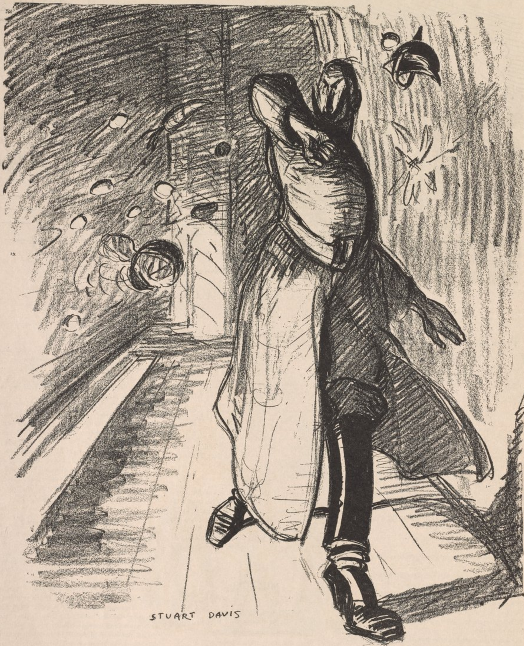
Drawn by Stuart Davis.