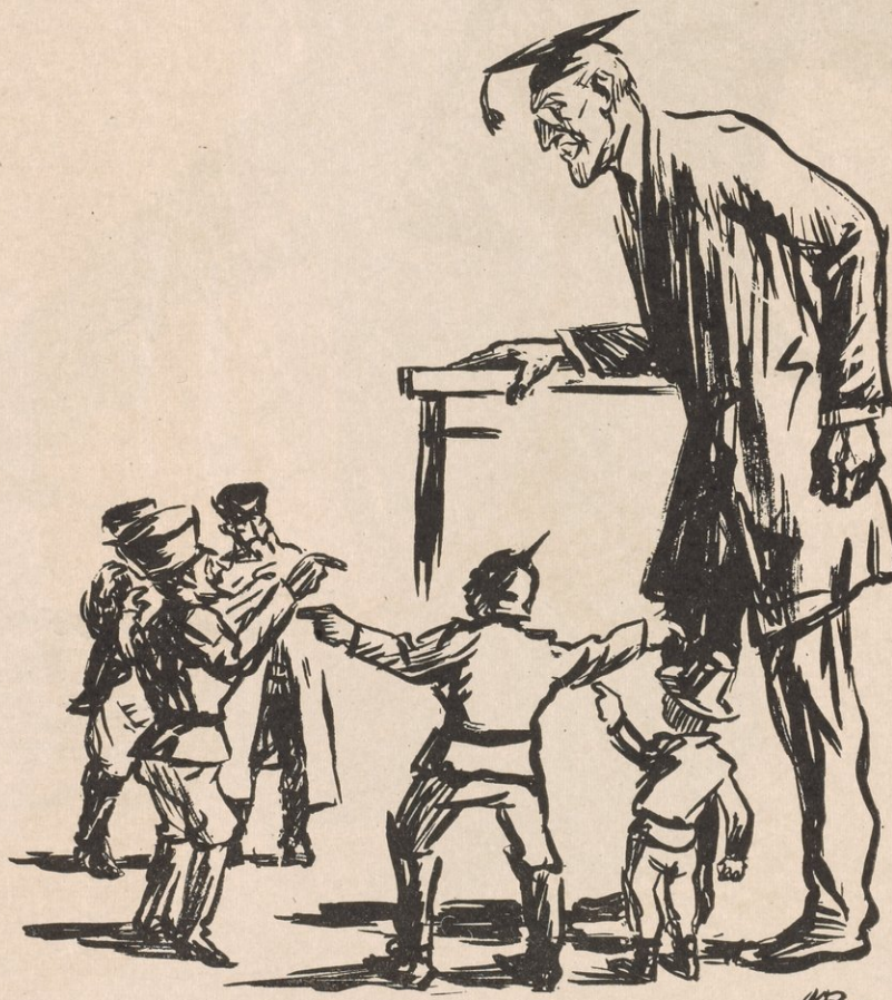
Drawn by Maurice Becker

This should be borne in mind in reading tales of the barbarous atrocity of soldiers, now on one side and now on the other.