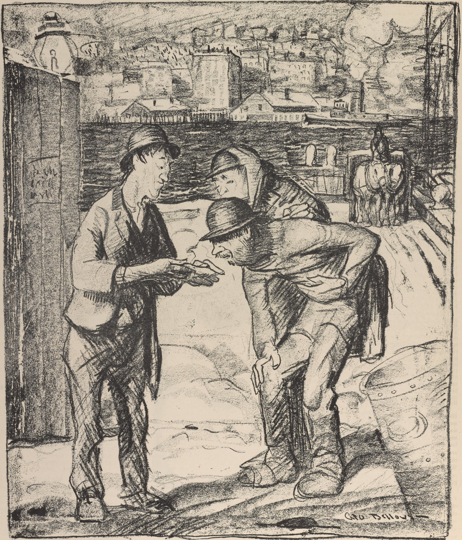
Drawn by George Bellows.