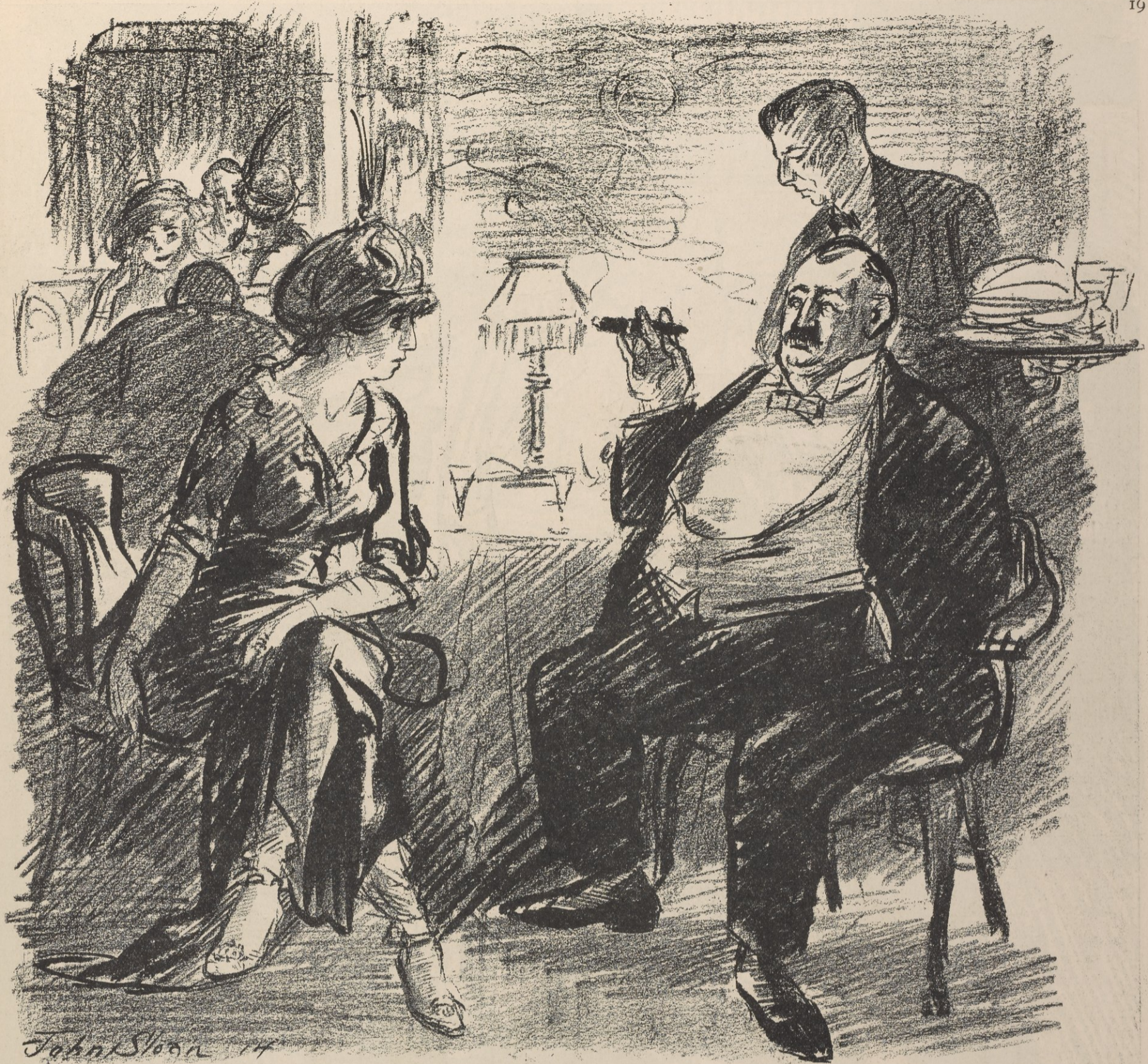
Drawn by John Sloan.