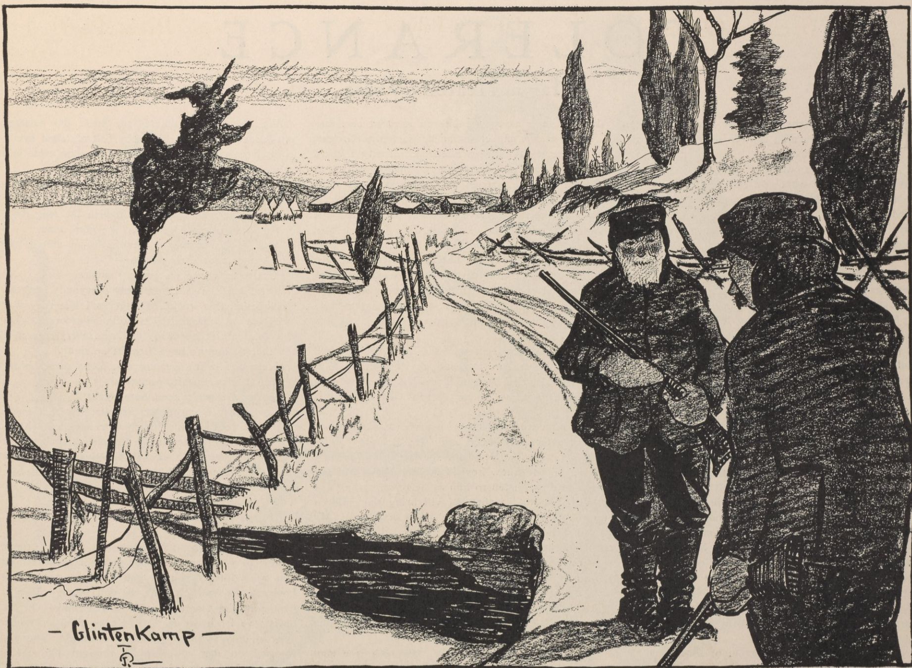
Drawn by Henry J. GlintenKamp.