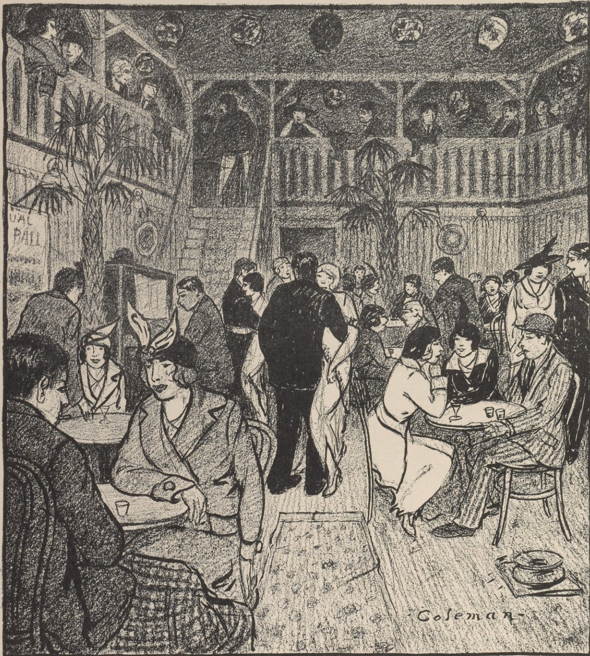
Drawn by Glenn O. Coleman.

The people who, when we say Revolution, gaze with unfocused eye into the dim future, and ask us if we expect violence, are the queerest fools in the world. Let them pick up their papers every morning and look for news of the beating up, or shooting, or forcible imprisonment of a striker, and if they look in the papers that carry truth, they will not be disappointed for one single morning in the whole year. The main trouble with the persons who are supposed to be thinking about these problems, is that they have read history until they are half asleep.