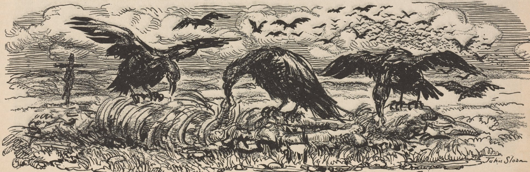
THE COMMON CROWS