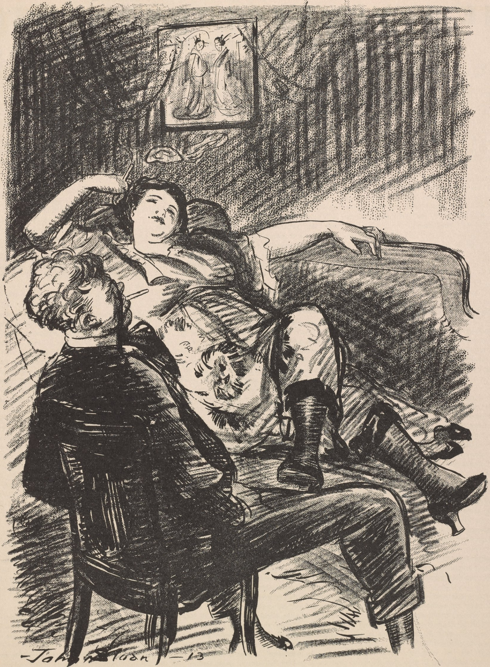
Drawn by John Sloan.