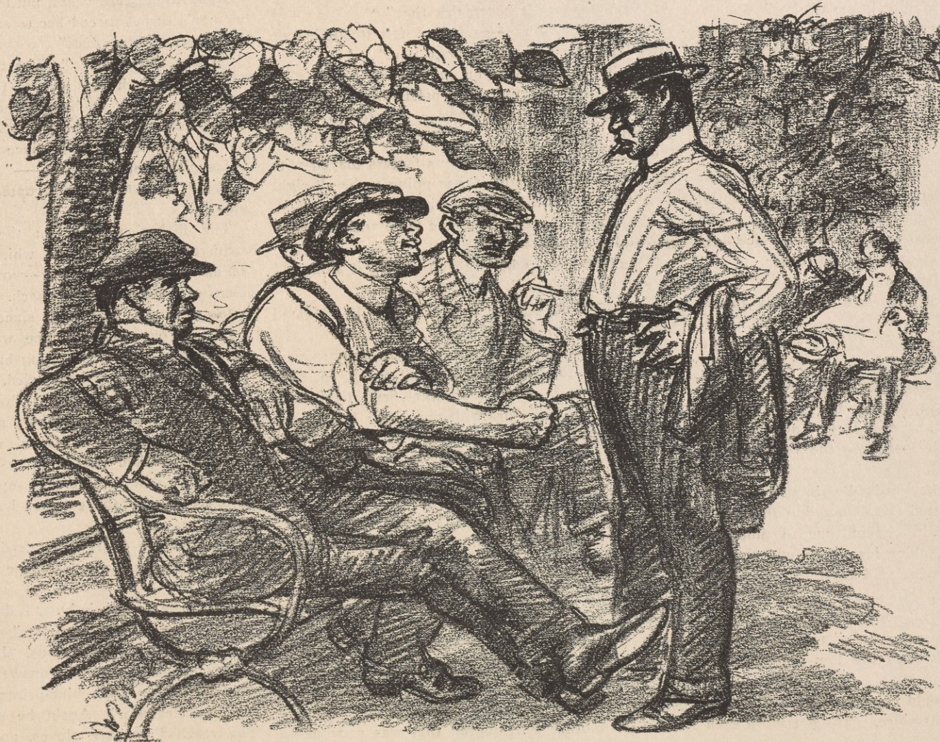
Drawn by John Sloan.

"When they gathered thirteen little colonies together and formed the United States of America they did it for mutual advantage and protection at home and abroad. They formed a holding company ."