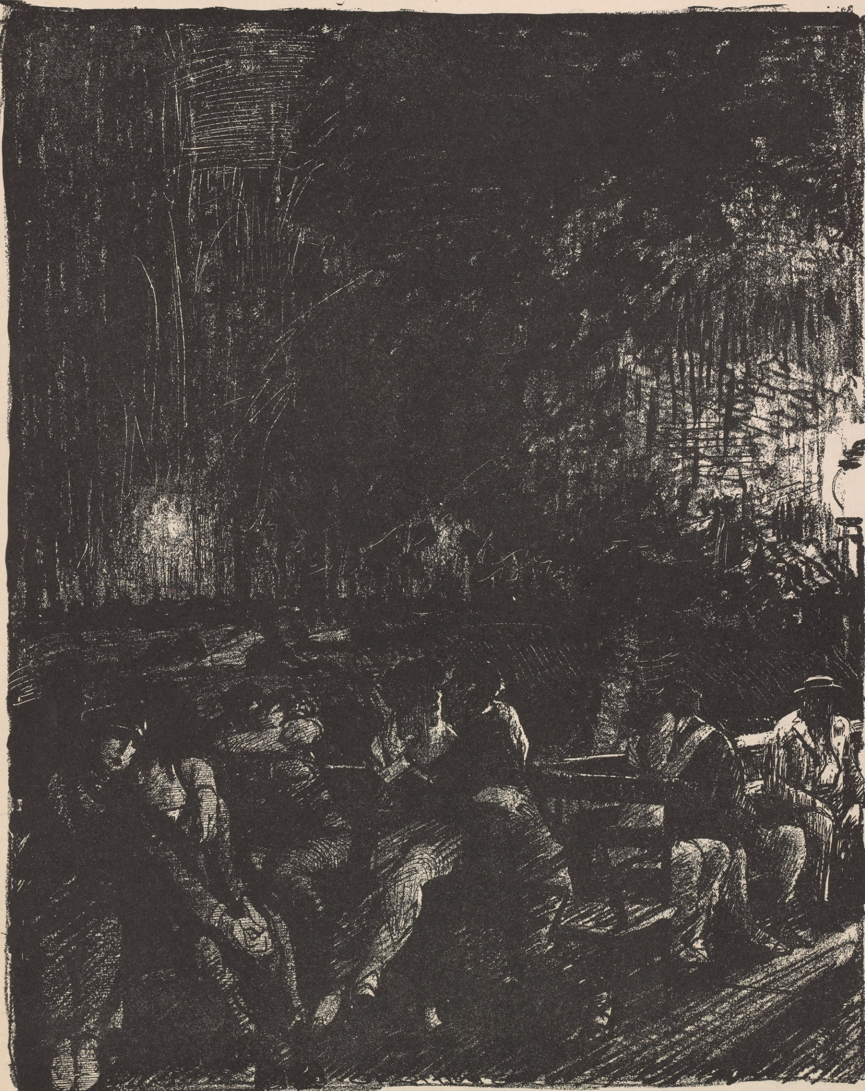
Drawn by George Bellows.