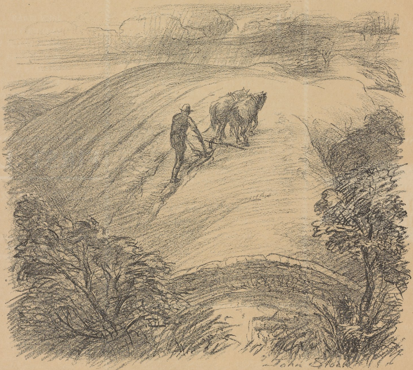
Drawn by John Sloan