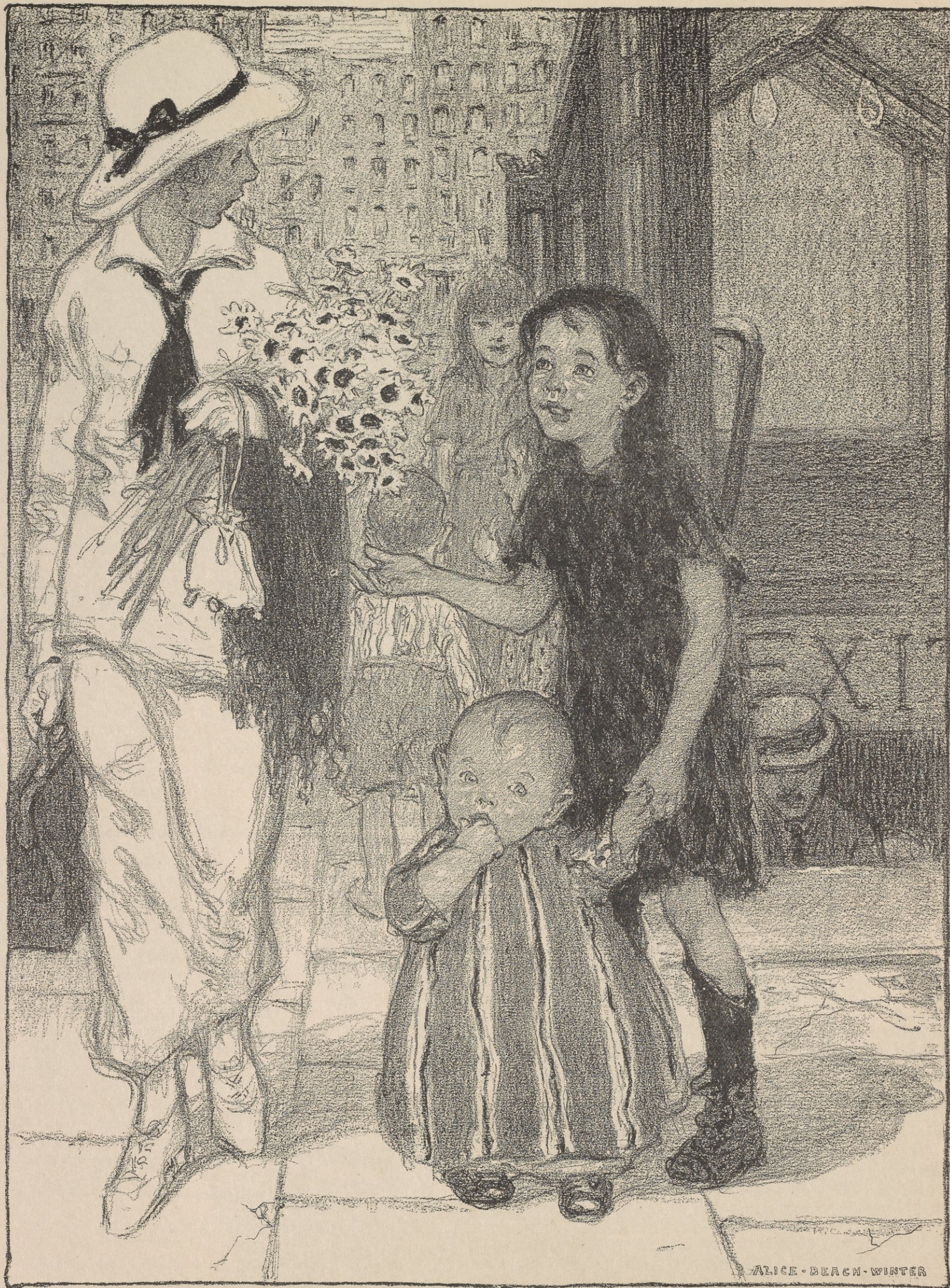
Drawn by Alice Beach Winter