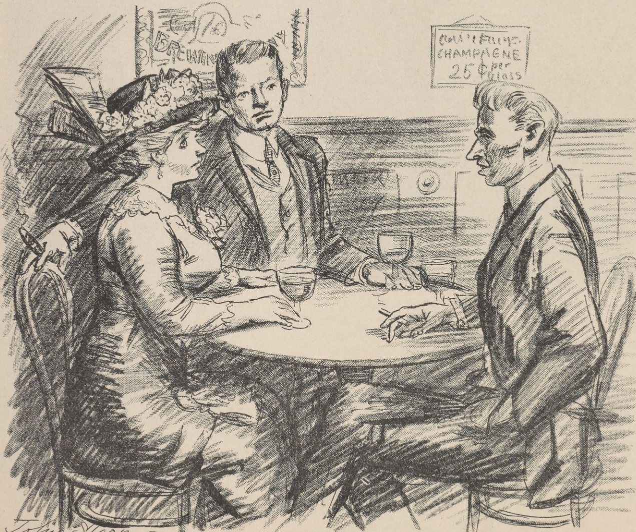
Drawn by John Sloan