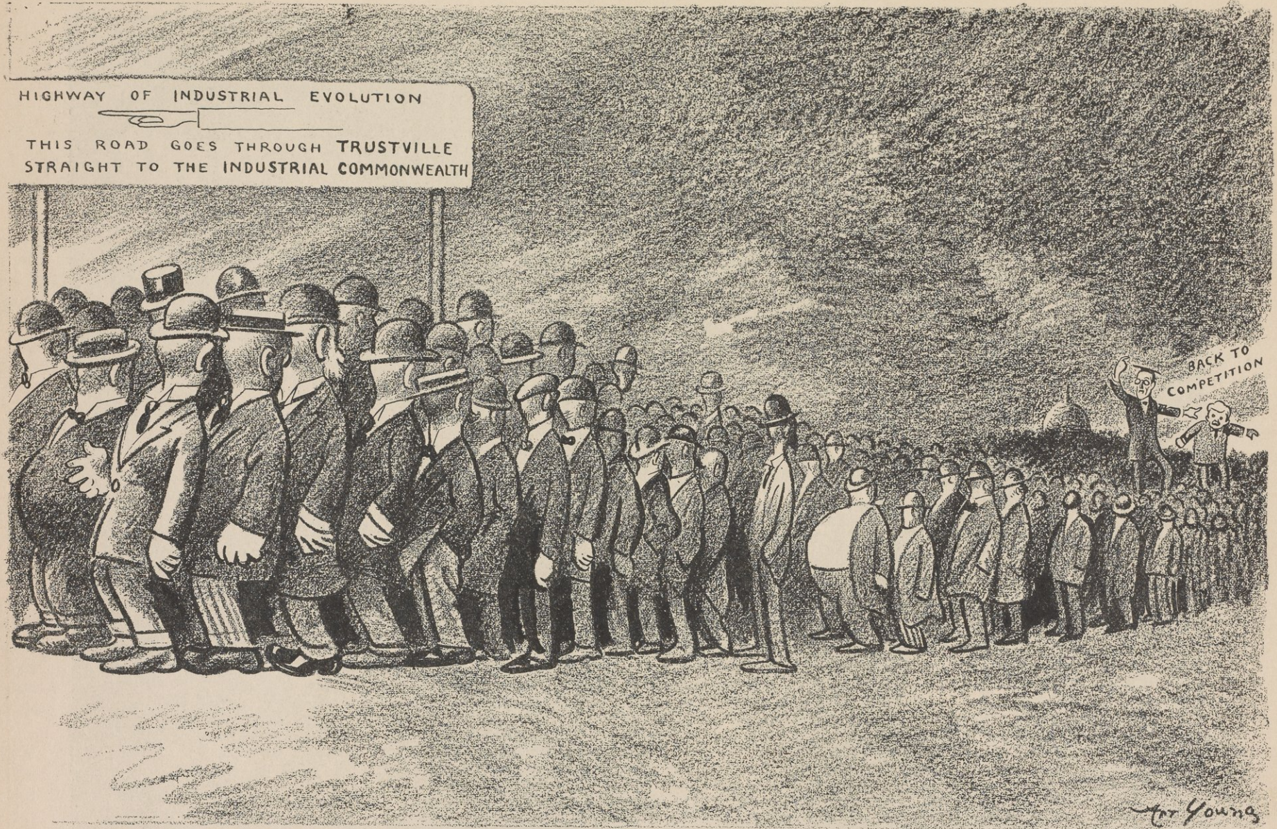
Drawn by Art Young