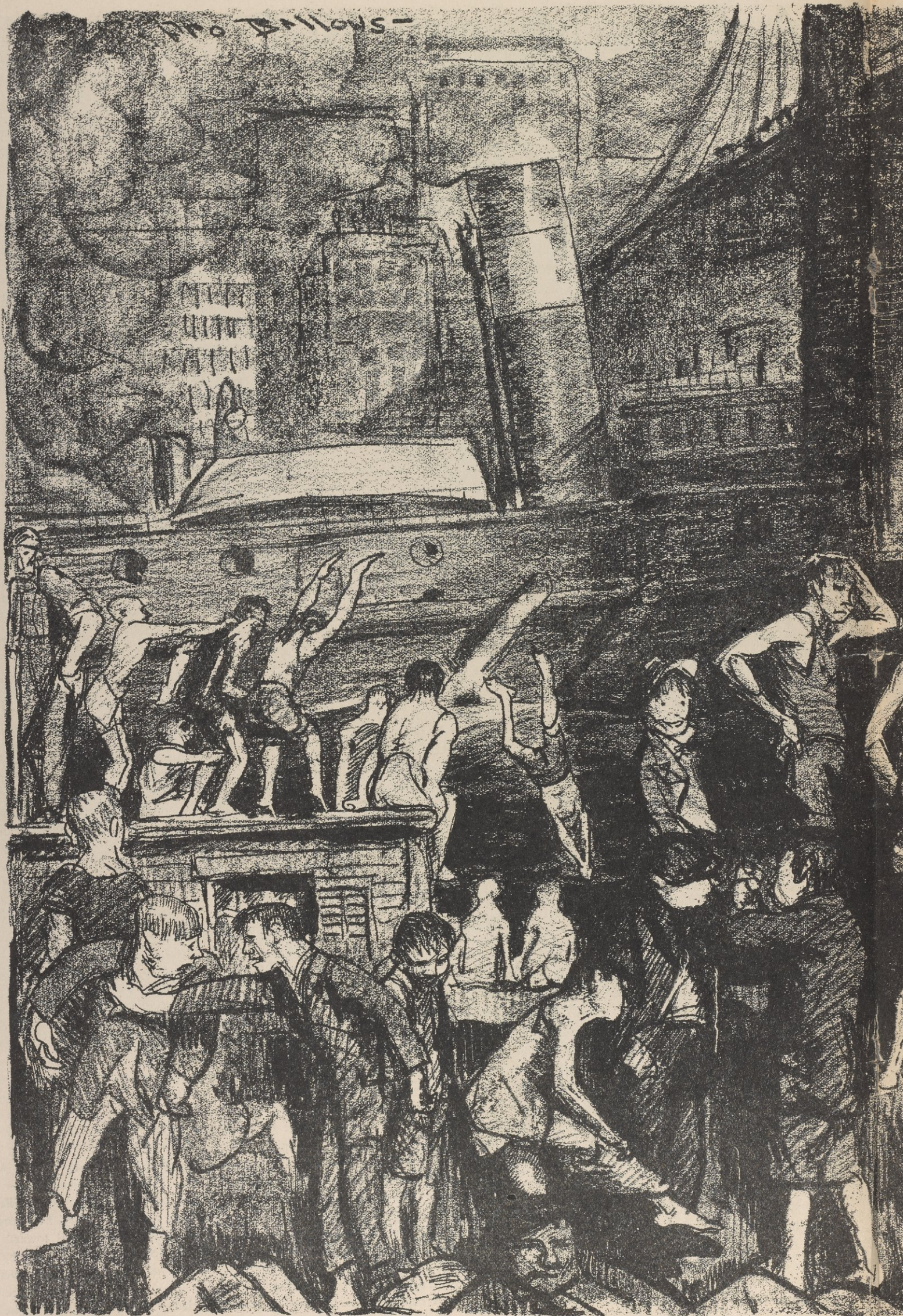
Drawn by George Bellows