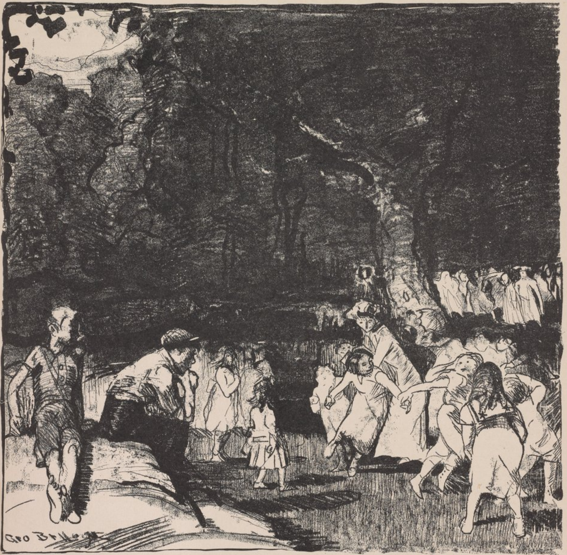
Drawn by George Bellows.

PHILOSOPHER-ON-THE-ROCK: "GOSH, BUT LITTLE KIDS IS HAPPY WHEN THEY'S YOUNG!"