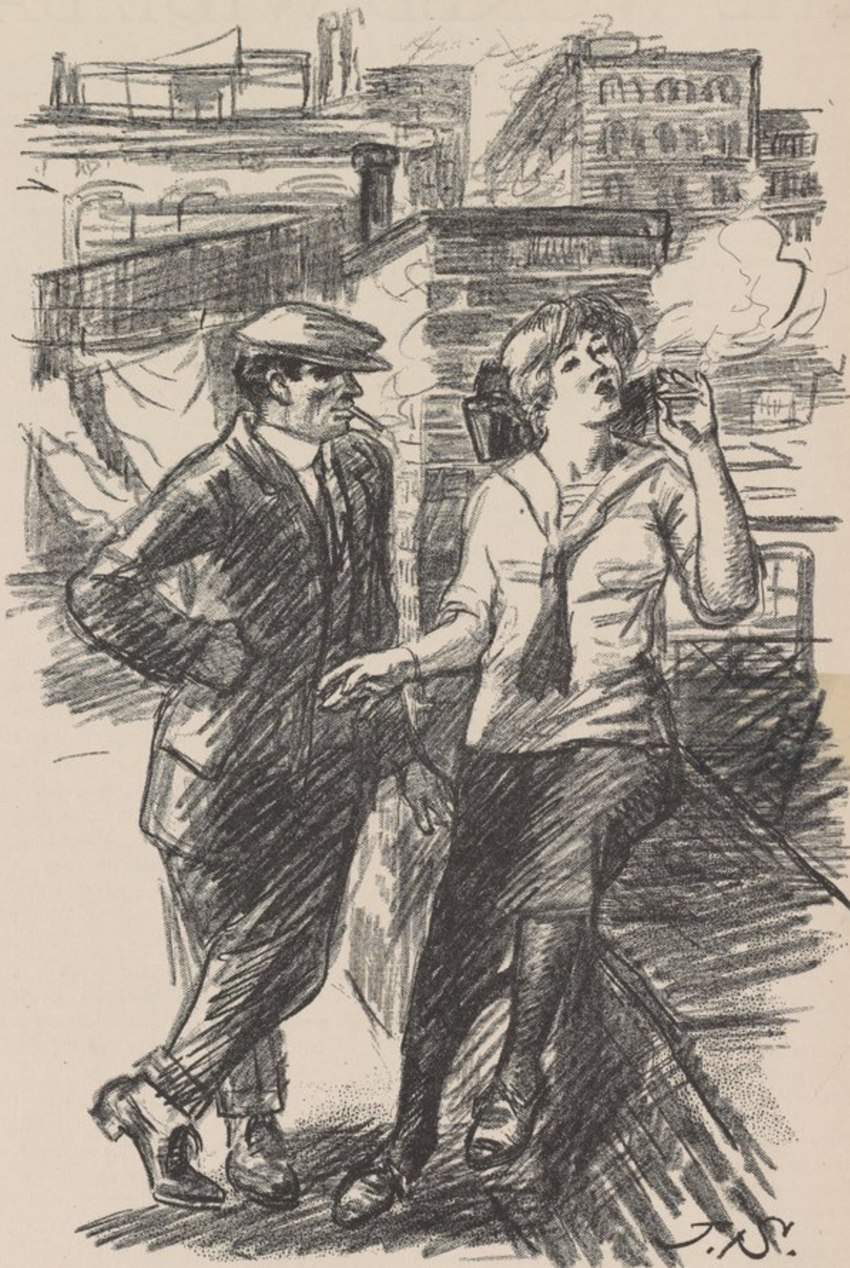
Drawn by John Sloan.