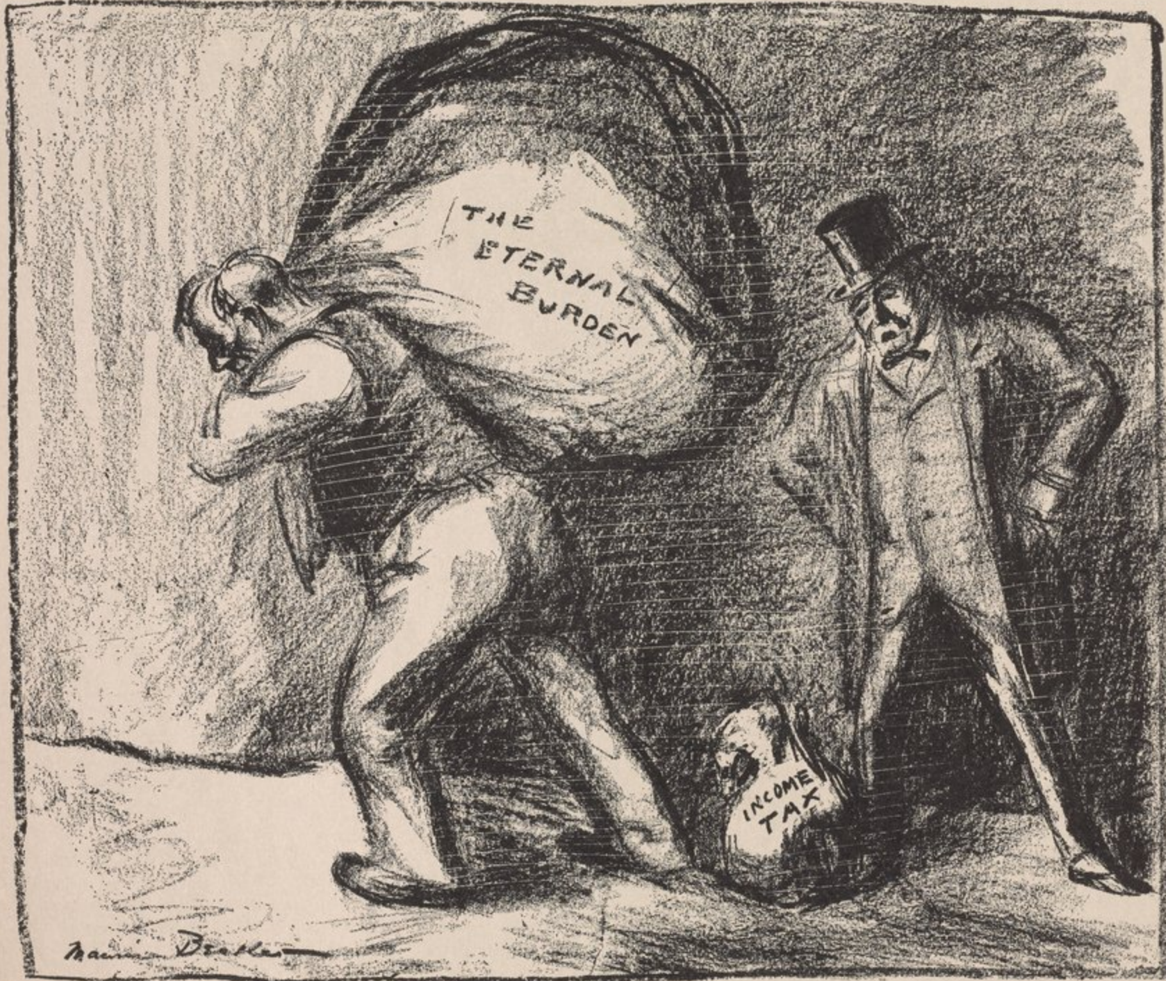
Drawn by Maurice Becker.

T HE only way you can make money and dodge the Income Tax is to buy land that is rising in value, leave it unimproved, and then sell it again.