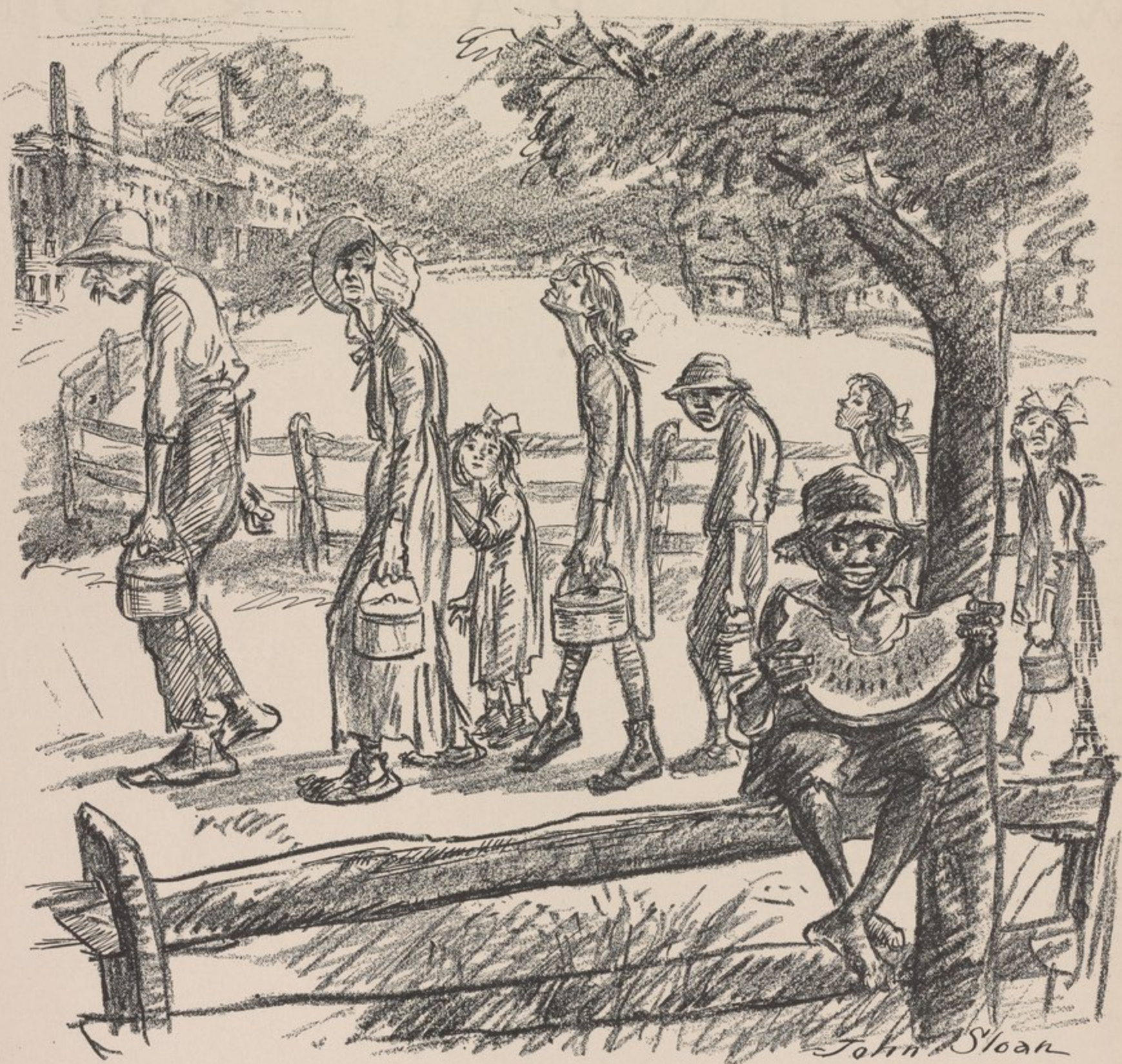
Drawn by John Sloan.