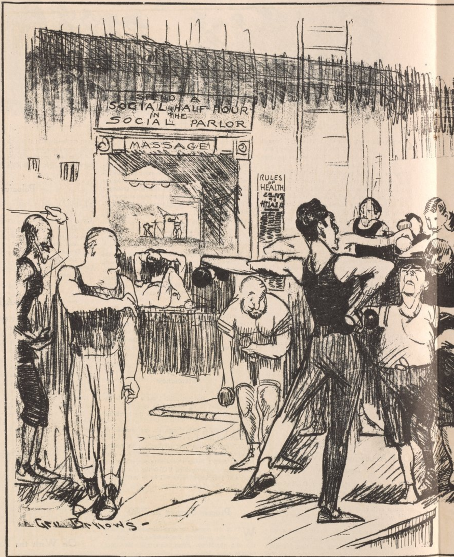
Drawn by George Bellows.