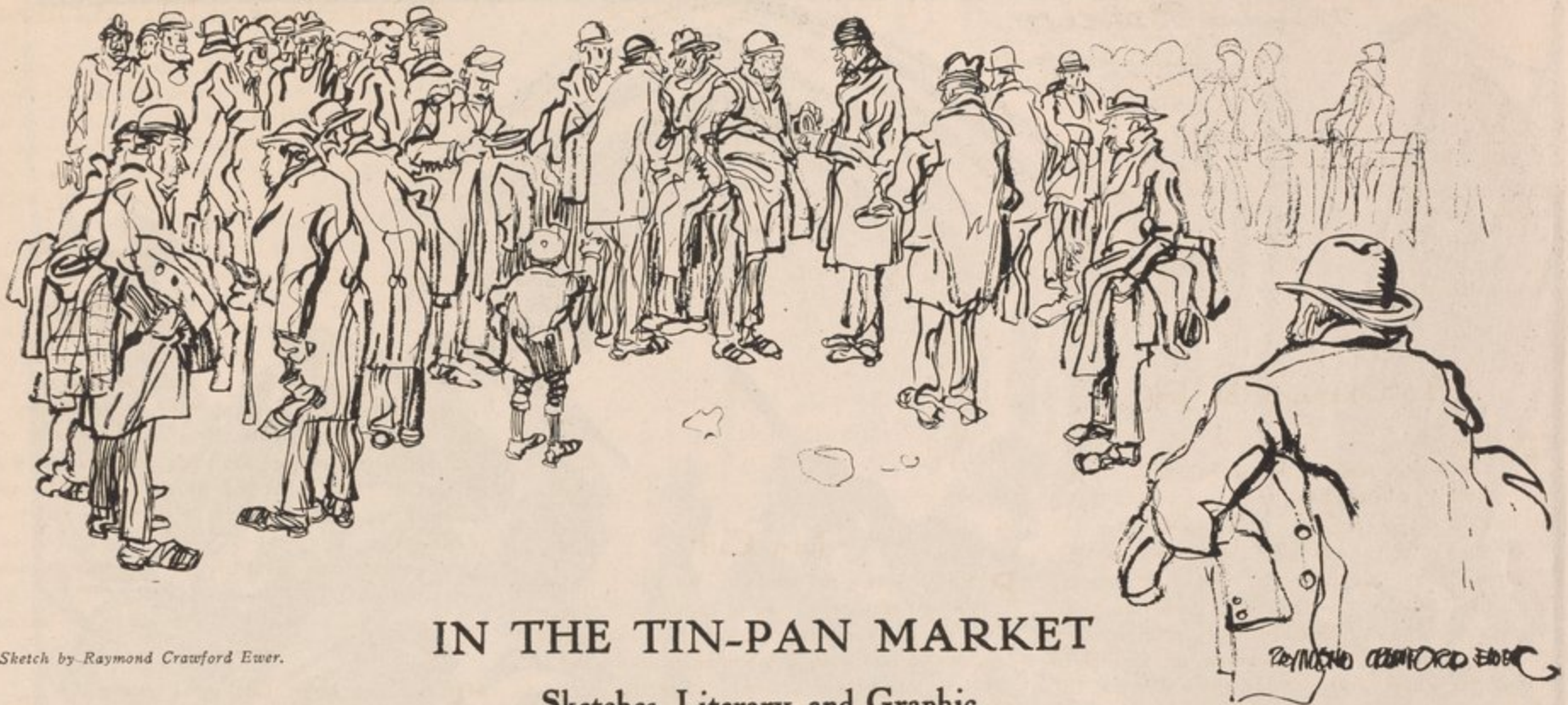
Sketch by Raymond Crawford Ewer.