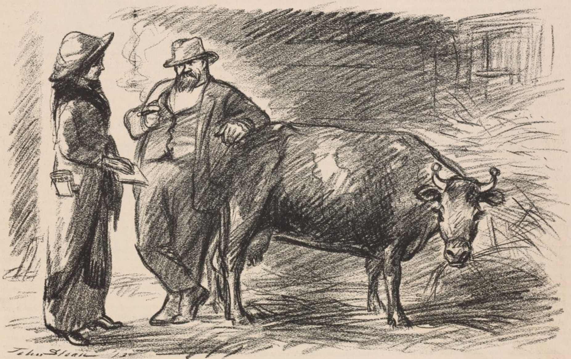
Drawn by John Sloan.