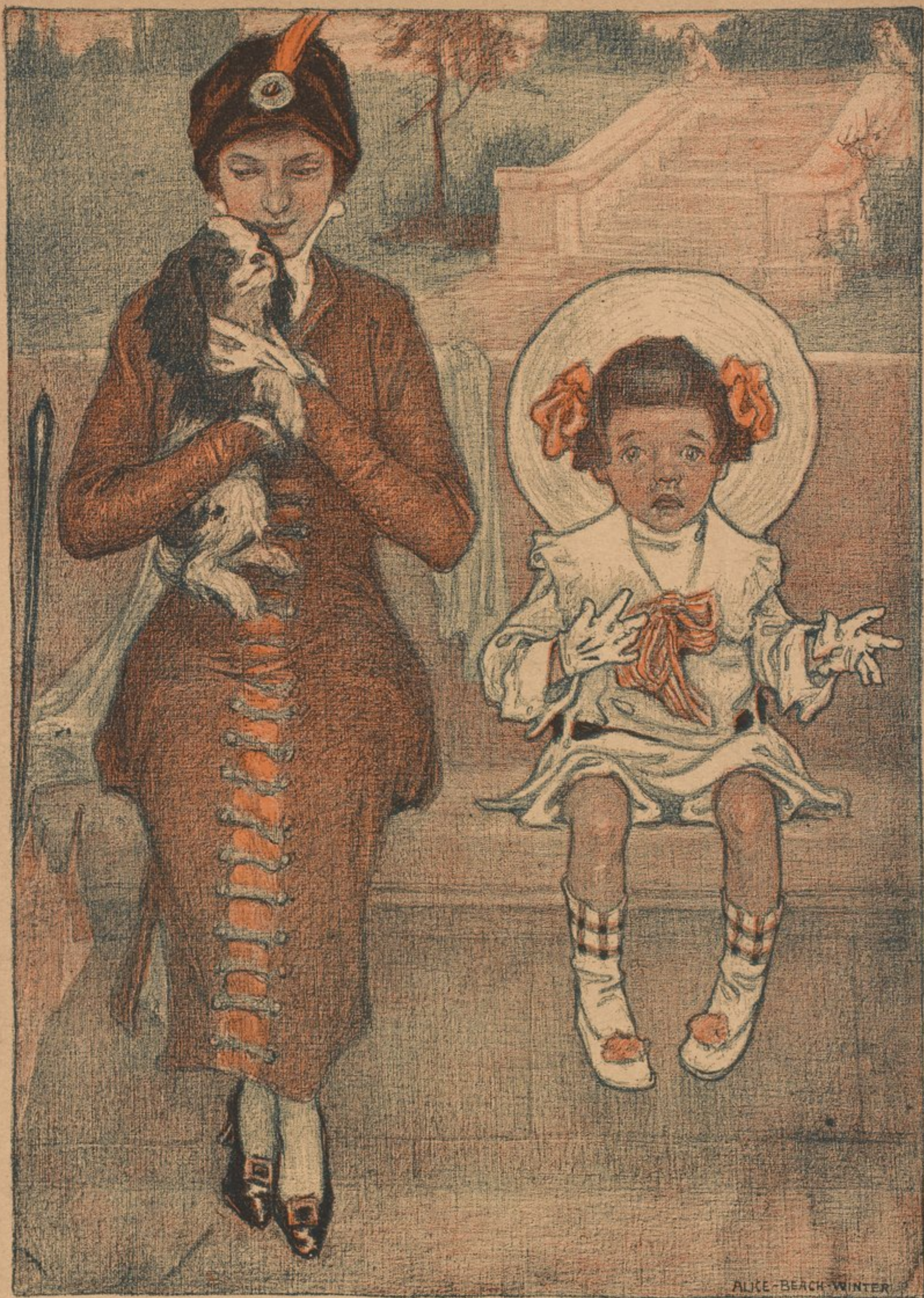
Drawn by Alice Beach Winter.