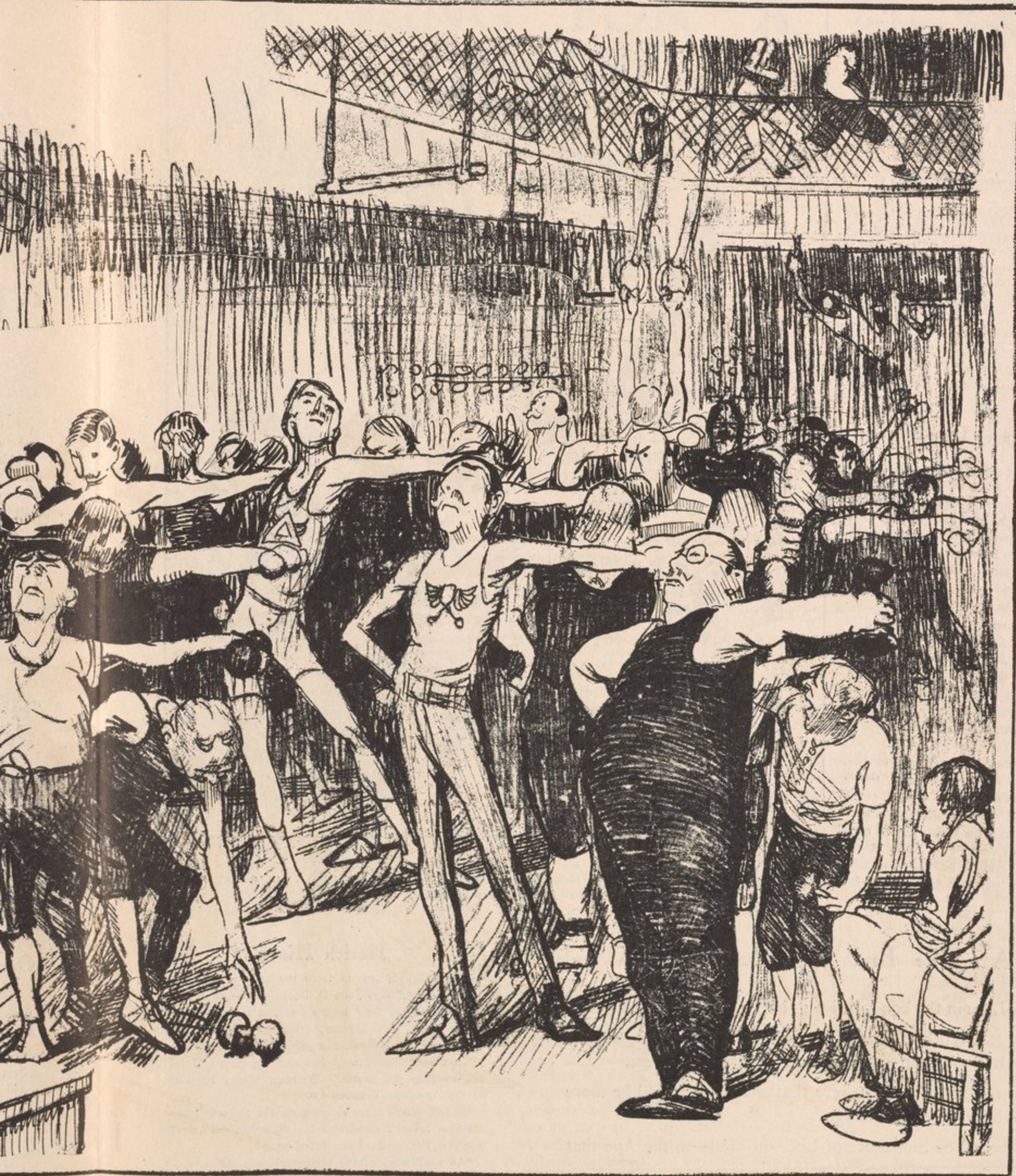
usiness Men's Class