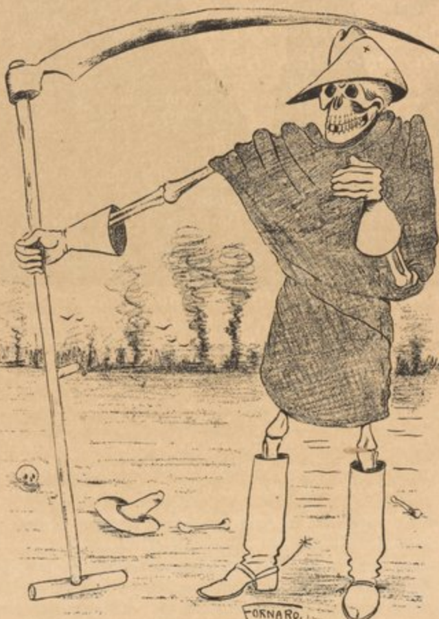
UNITED STATES INTERVENTION IN MEXICO.

The wisest thing for us to do is to stop discussing a thing which cannot and will not be done, unless the men at the head of this nation have gone completely mad. We had better gird our loins for a task that will keep us very busy right here for the next twenty years.