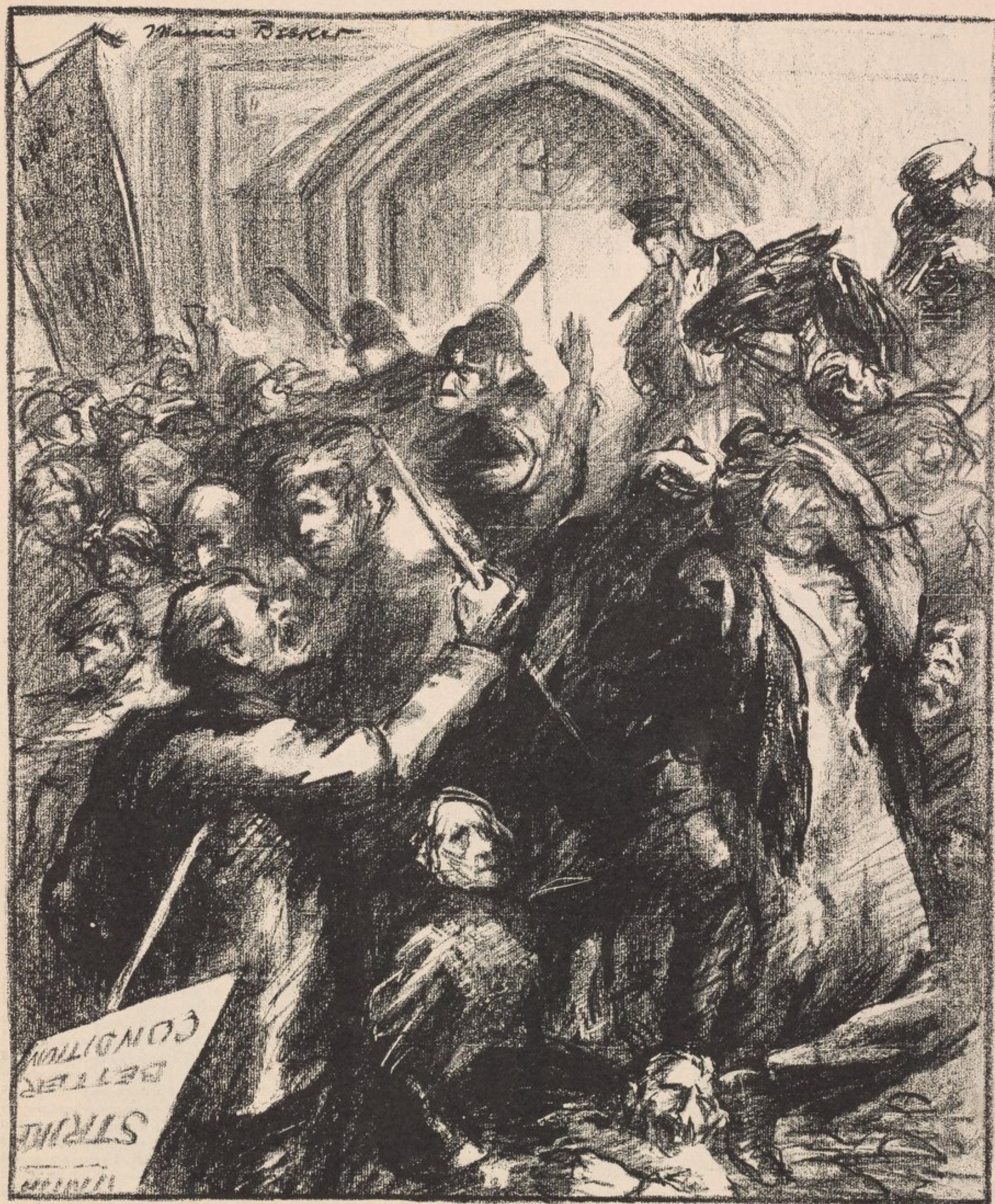
Drawn by Maurice Becker.