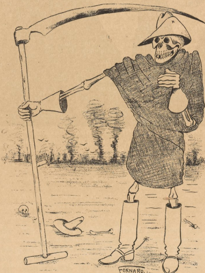
UNITED STATES INTERVENTION IN MEXICO.

The wisest thing for us to do is to stop discussing a thing which cannot and will not be done, unless the men at the head of this nation have gone completely mad. We had better gird our loins for a task that will keep us very busy right here for the next twenty years.