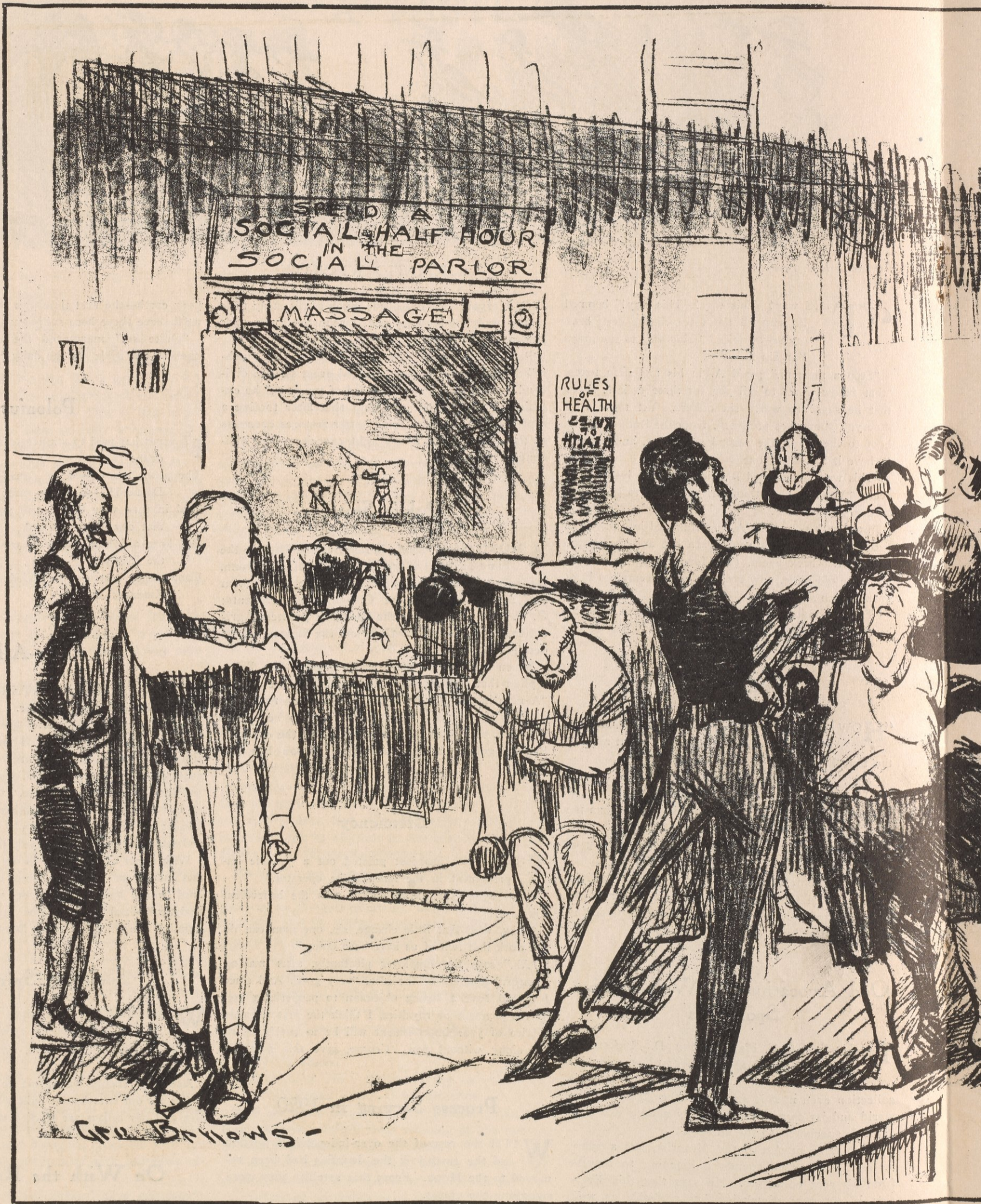
Drawn by George Bellows.