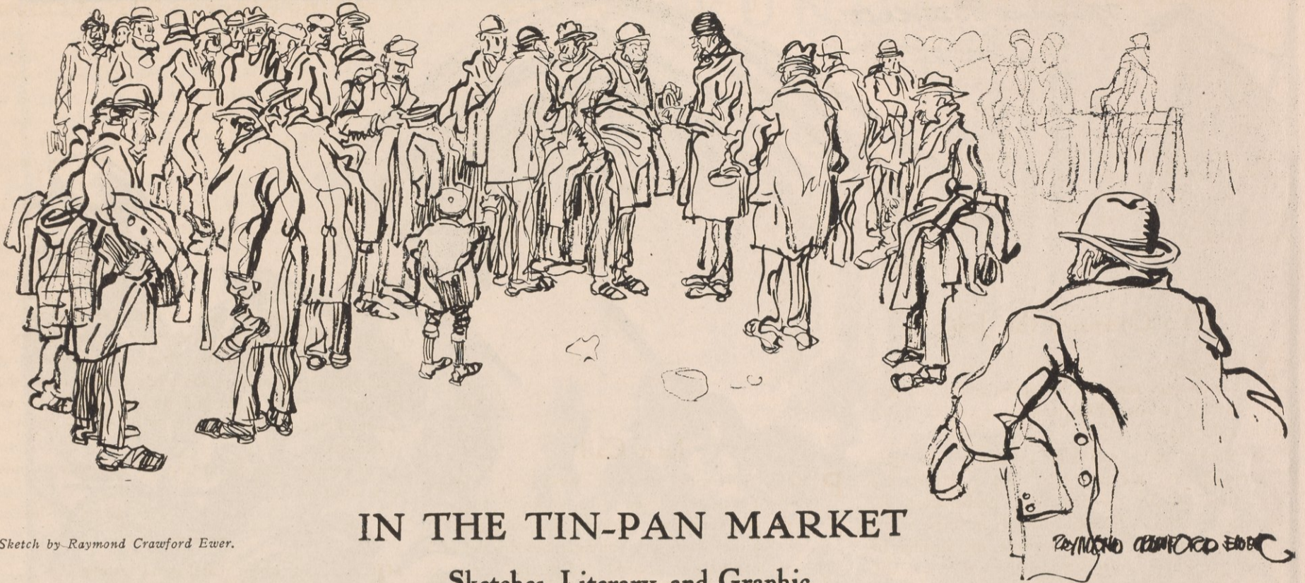
Sketch by Raymond Crawford Ewer.