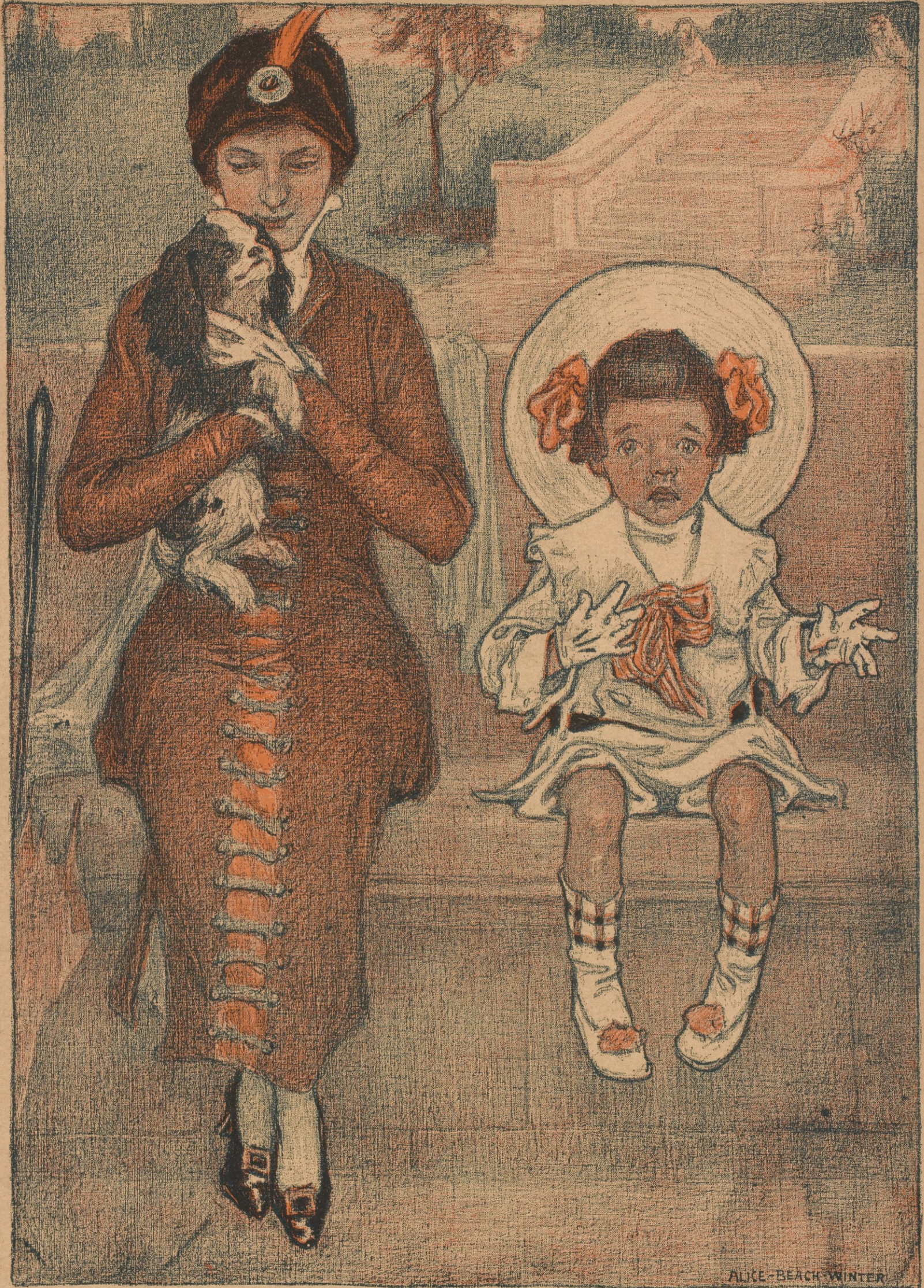
Drawn by Alice Beach Winter.