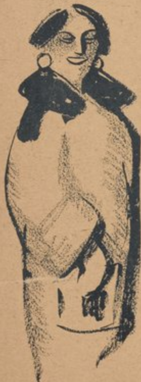
Sketches of the Aristocracy.

HELP US TO FIND IT. SEND US YOUR NAME AND ADDRESS WITH ONE DOLLAR FOR AN ANNUAL SUBSCRIPTION. PASS US ALONG TO YOUR FRIENDS. TALK ABOUT US. PRAISE US. CRITICISE US. DAMN US PUBLICLY. WE MUST HAVE A LITTLE CONSIDERATION.