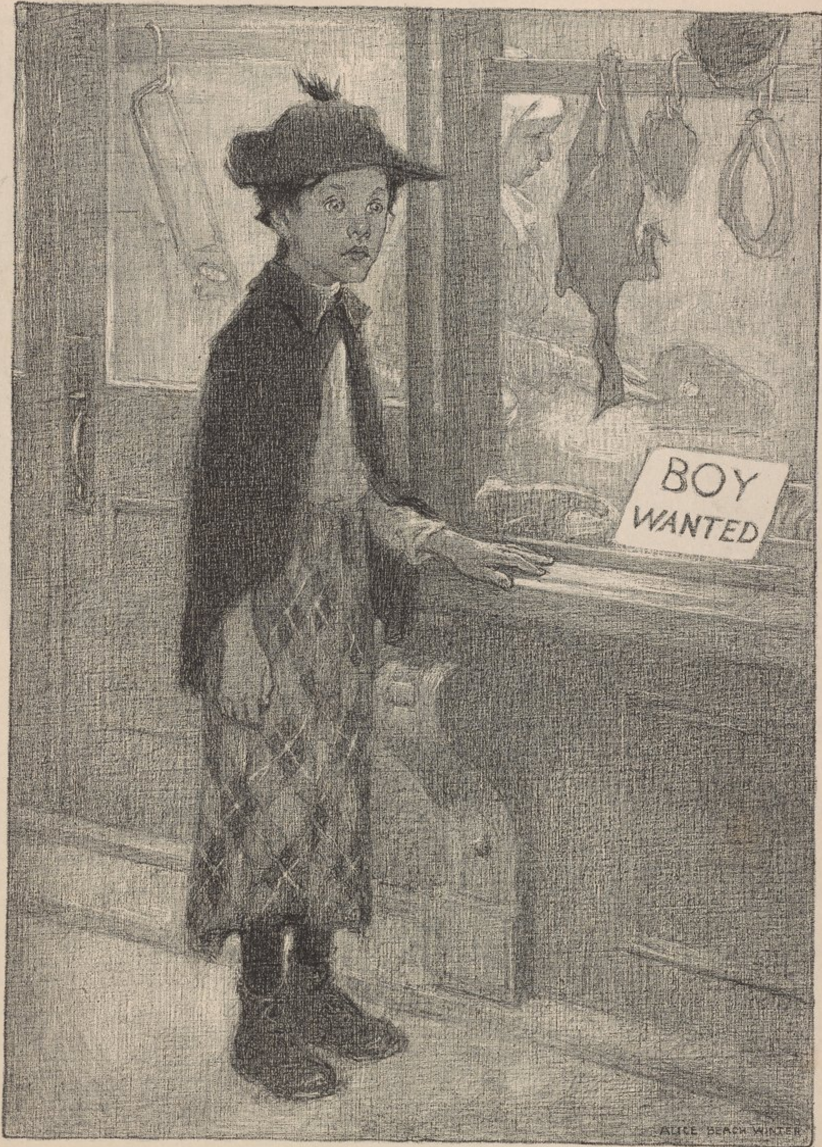
Drawn by Alice Beach Winter.