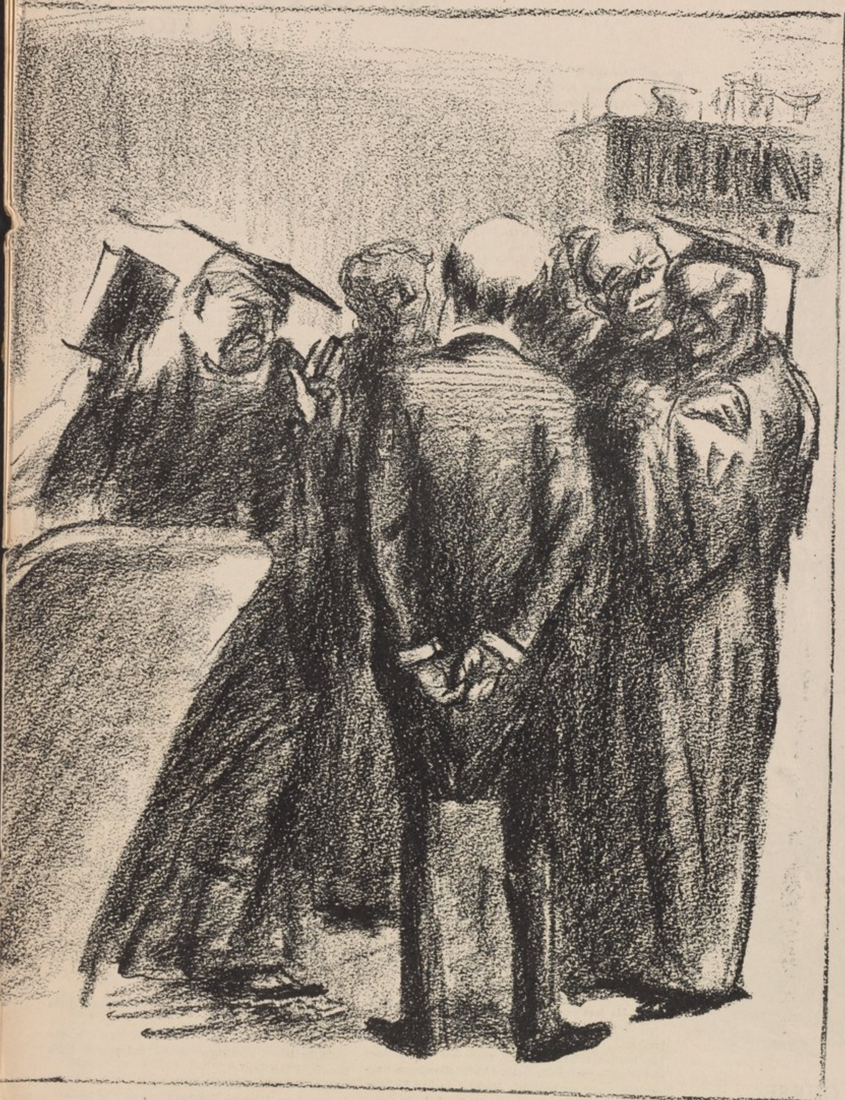
Who Can't Afford To See