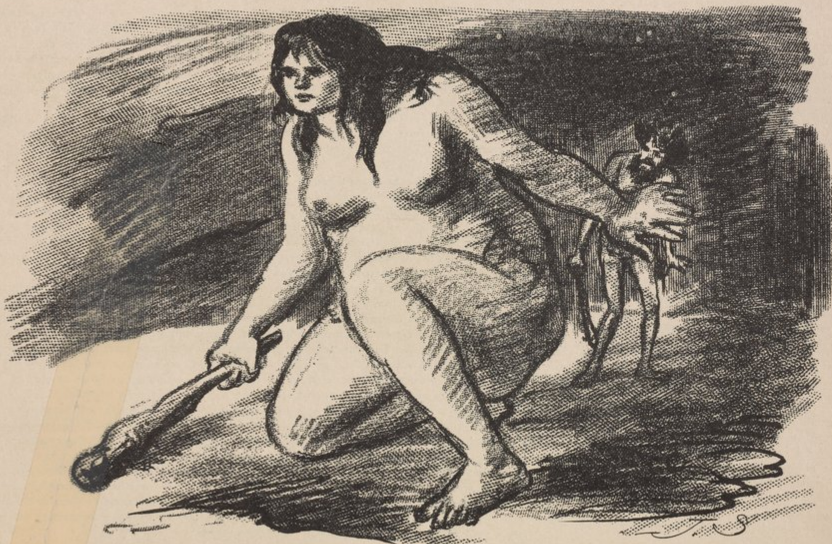
The Sixth Day