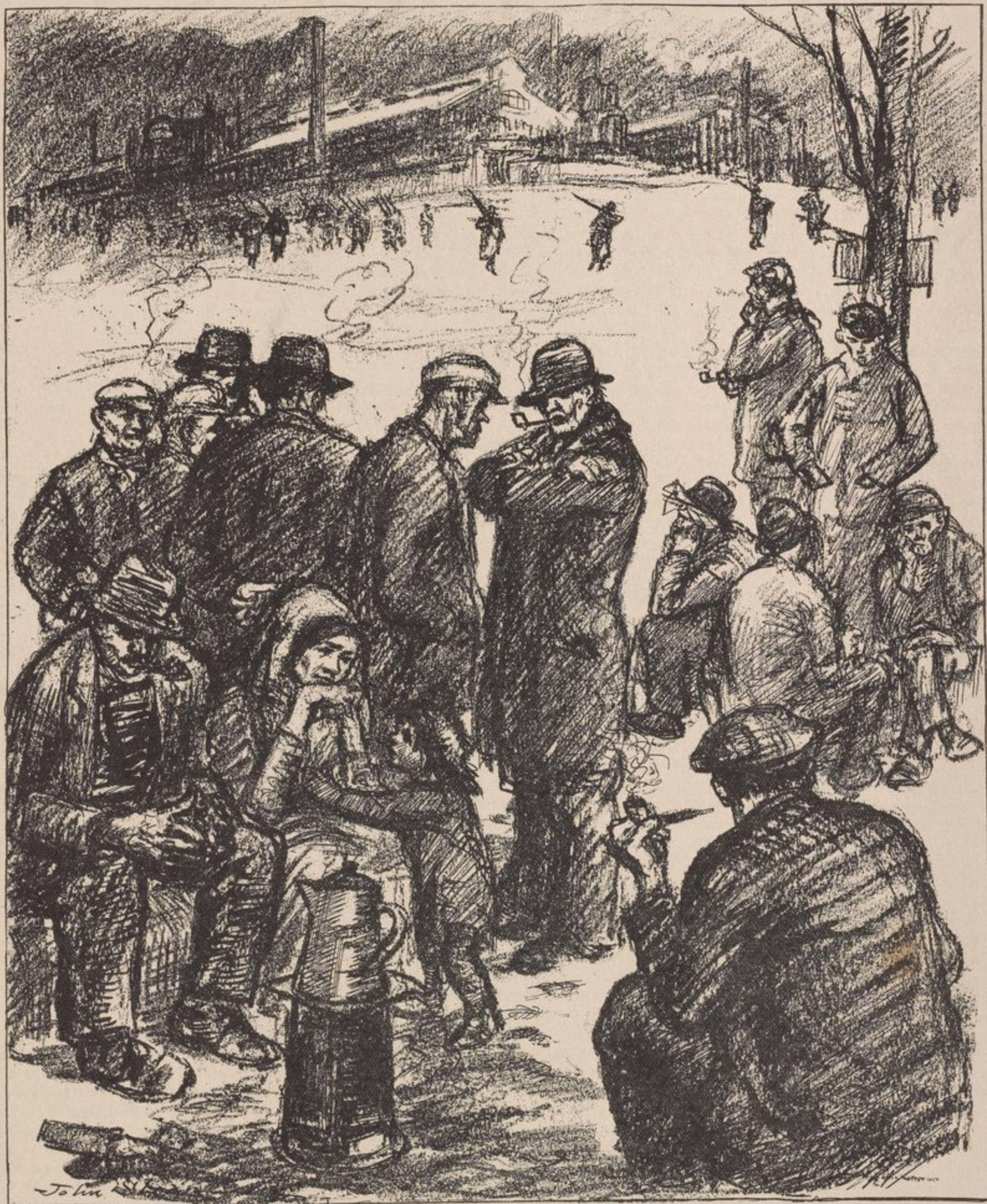
Drawn by John Sloan.